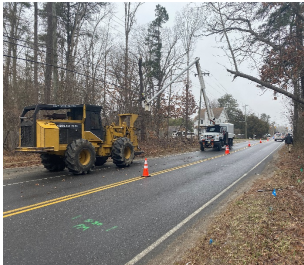
Figure 1: Stella Contracting clearing trees/brush