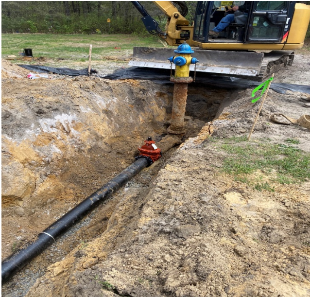
Figure 1: Hydrant Relocation