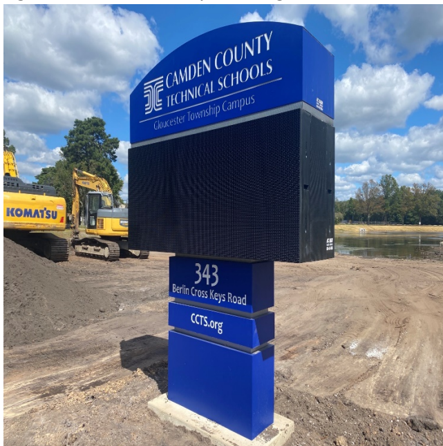
Figure 1: Camden County Tech. Sign Relocation