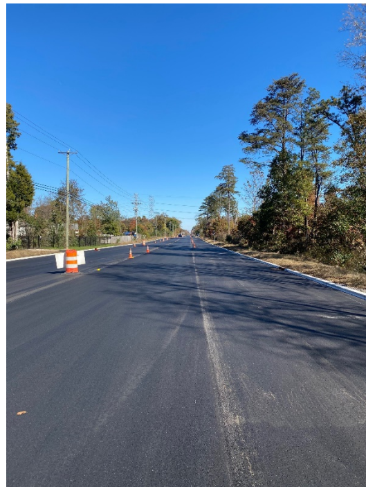
Figure 2: HMA Surface Course Placement