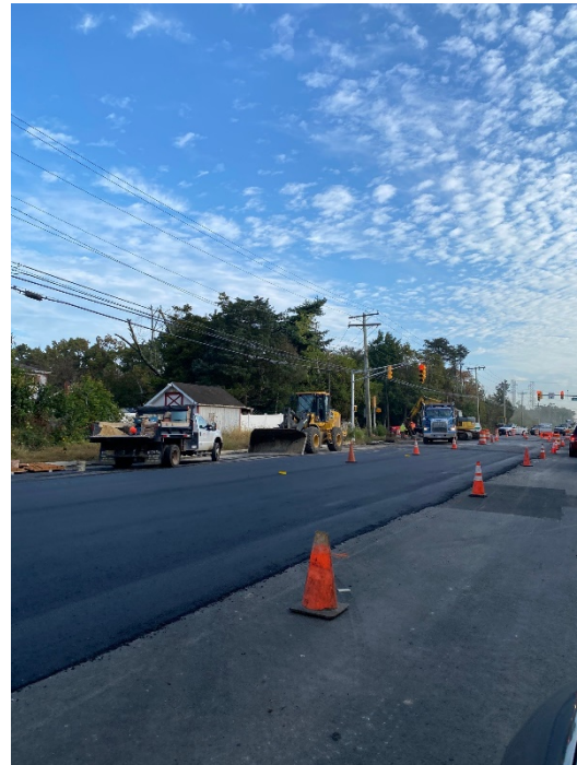
Figure 1: Camden School Driveway HMA Placement Figure 2: HMA Intermediate Course Placement