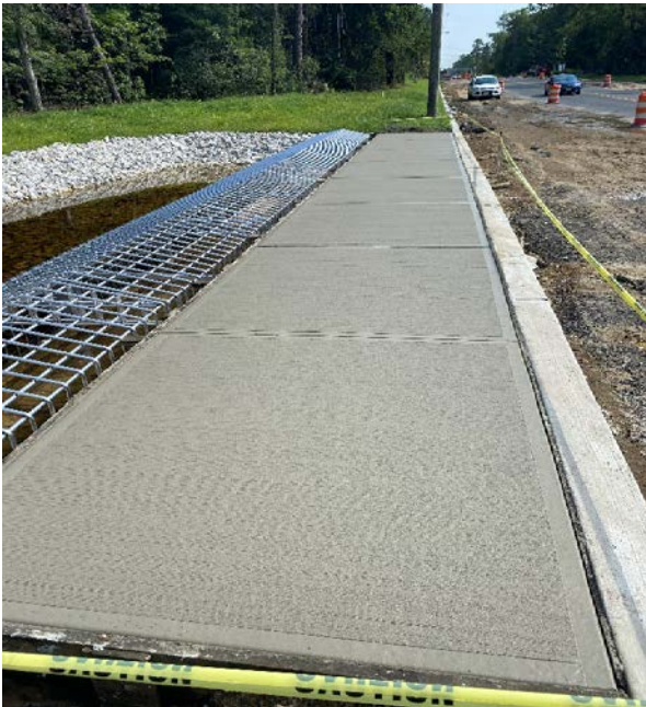
Figure 1: Reinforced Concrete Sidewalk, 8" Thick