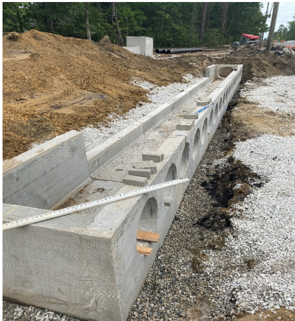
Figure 1: Dropbox installation for 20-18" Pipe Crossing Figure 2: HMA Paving over 20-18" DIP Crossing