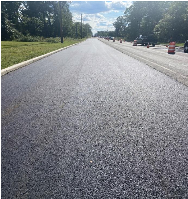
Figure 1: HMA Intermediate Paving