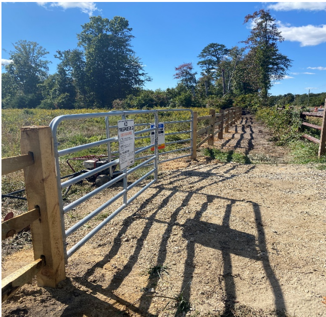
Figure 1: Fence installation for PSEG Property