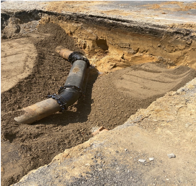
Figure 1: 12" DIP Water Main Repair (Thrust Blocks Added) Figure 2: 4" HMA Base Placement for Widening