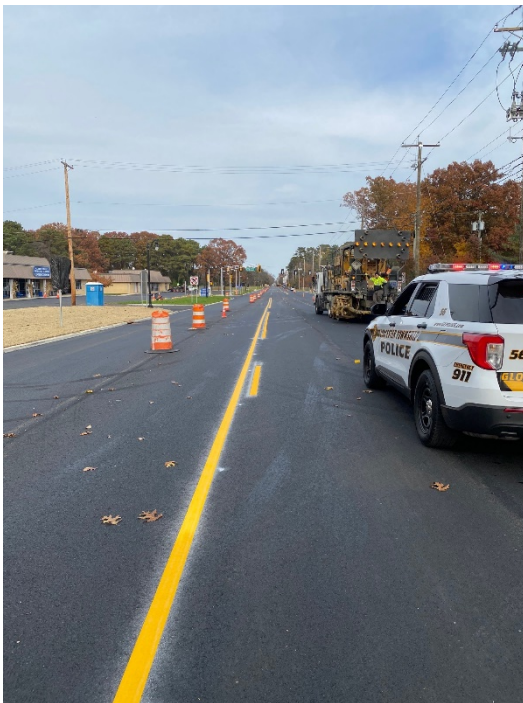
Figure 1: Berlin X-Keys Road - striping