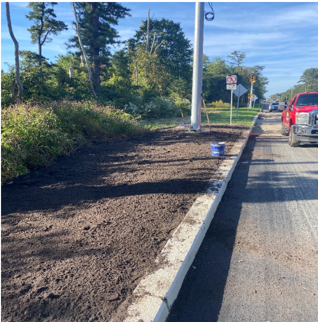
Figure 1: Topsoil near Kearsley Rd