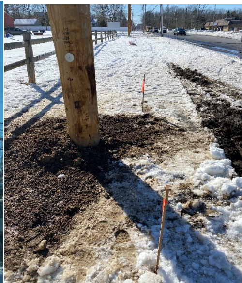
Figure 2: Relocated Utility Pole Location from curb

P&A Construction will be mobilizing on site in the next few weeks to start clearing.