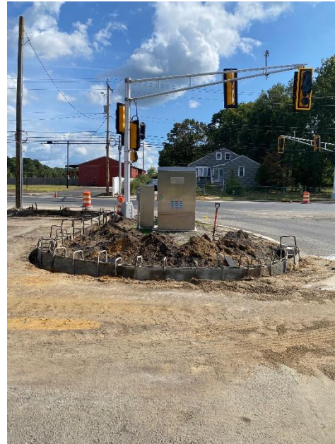
Figure 2: Curb installation near school