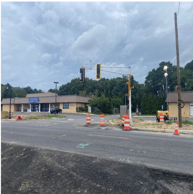
Figure 1: Traffic Signal Installation