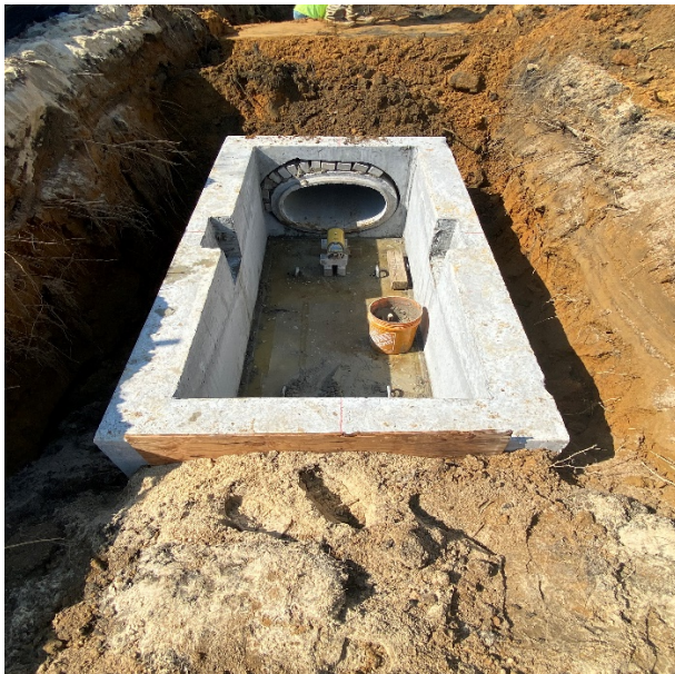
Figure 1: Inlet installation