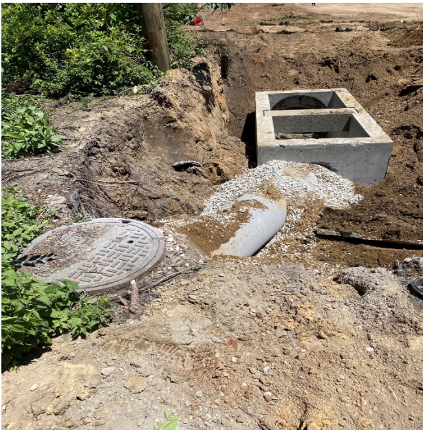
Figure 1: 18" RCP/Inlet Installation