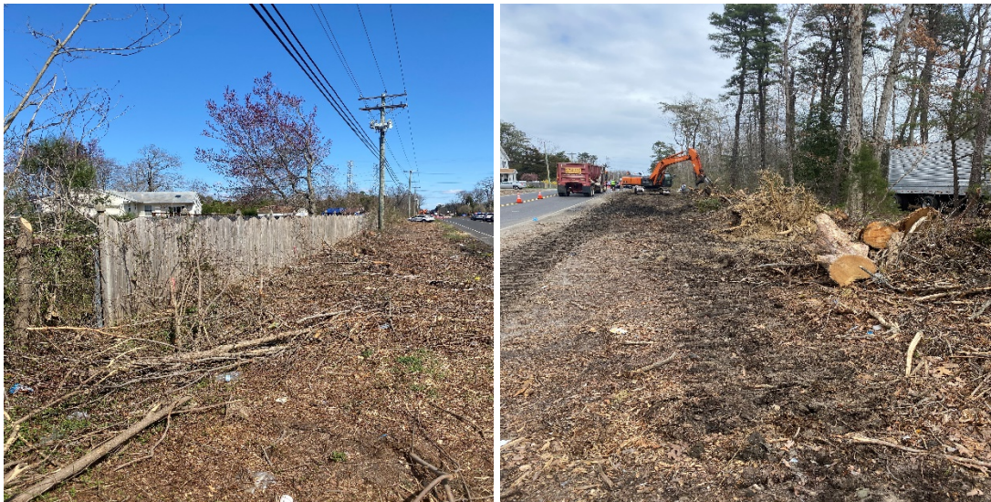
Figure 1: Clearing on North side of roadway Figure 2: Clearing near Erial New Brooklyn Rd