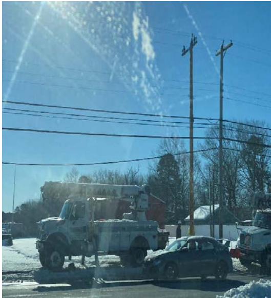
Figure 1: Verizon Relocating Utility Poles