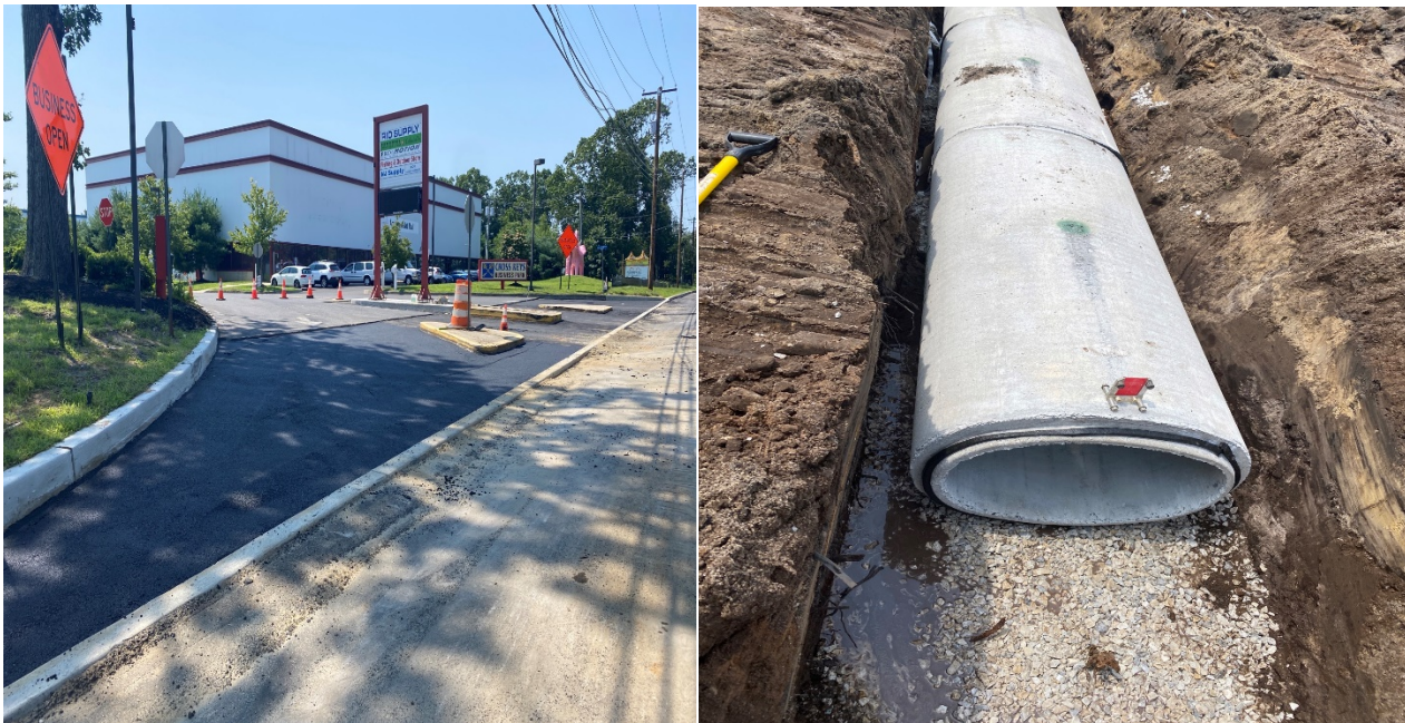
Figure 1: HMA Base Placement for Driveway Apron Figure 2: 22"X34" ERCP Placement with 57 Stone Bed