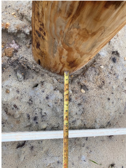
Figure 1: Pole Location from curb

Progress Report # 1 Friday, January 29, 2021