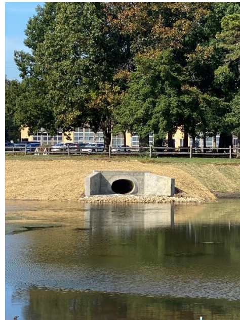
Figure 2: Outfall at school