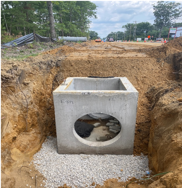
Figure 1: B Inlet Placement