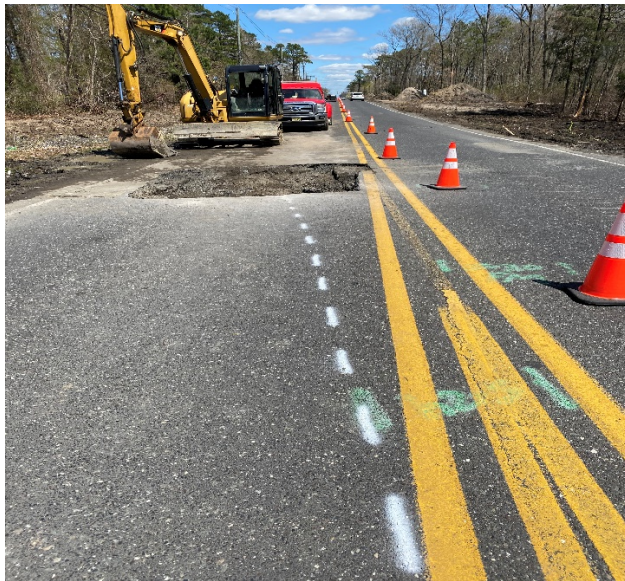
Figure 1: Test pit near Old Bridge Rd