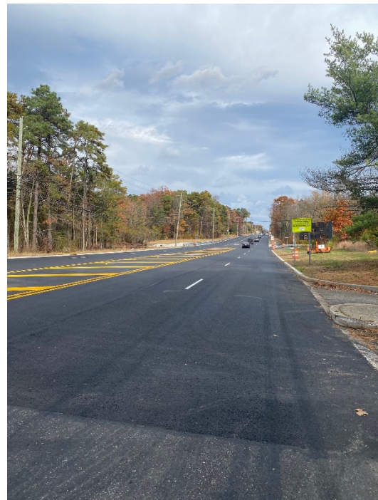
Figure 2: Berlin X-Keys Road - striping