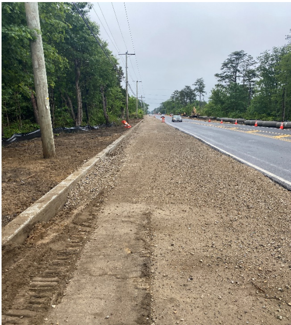
Figure 1: Roadway Boxout on left side of the road