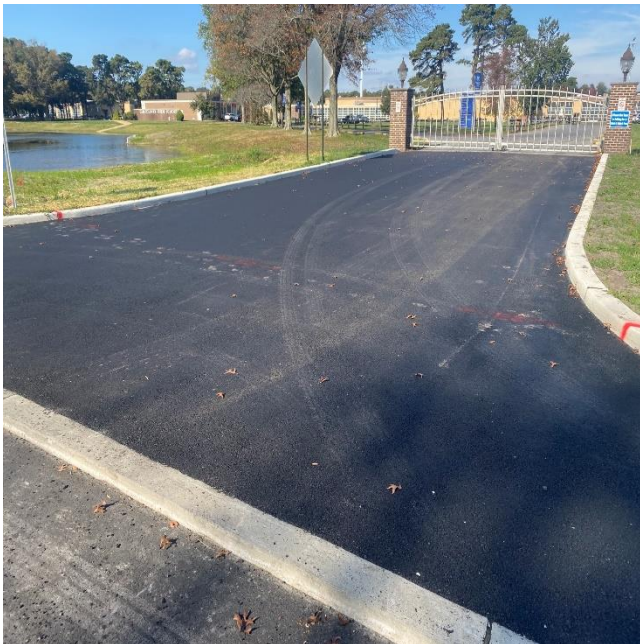
Figure 1: Camden School Driveway 3 HMA Placement