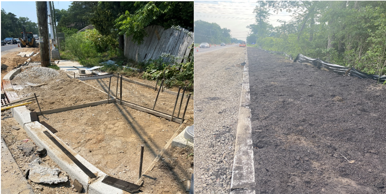
Figure 1: Handicap ramp at Kearsley Rd/Cross Keys Rd Figure 2: Topsoil placement on Cross Keys Rd