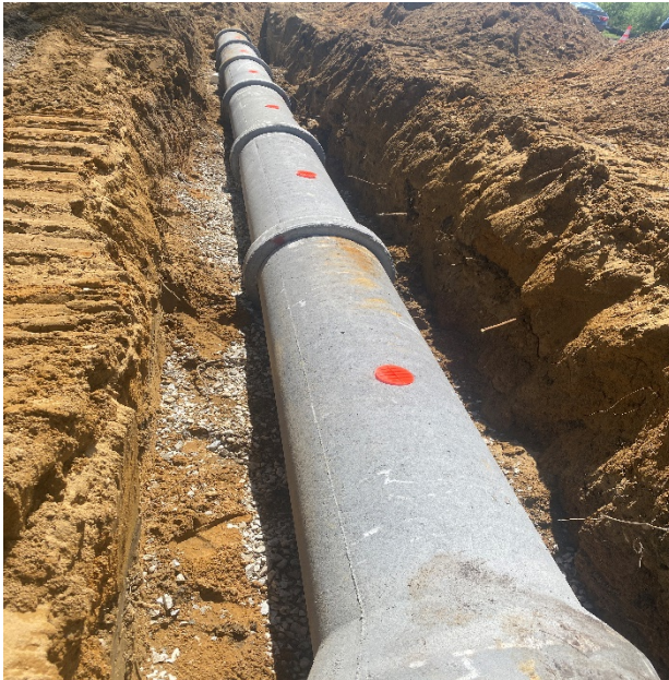
Figure 1: 24" RCP placement