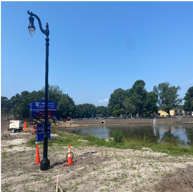
Figure 1: New Street Light at Camden County School