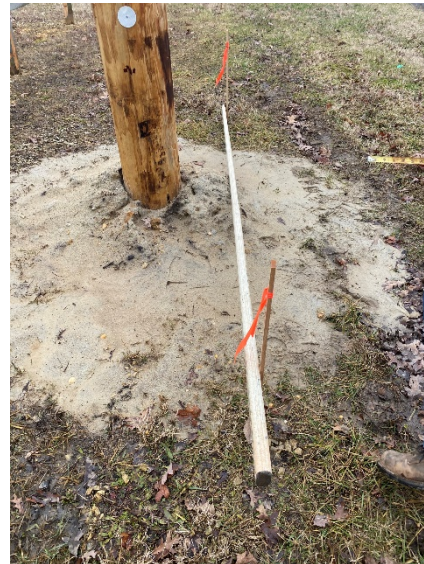
Figure 2: Pole Location from curb

P&A Construction will be mobilizing on site in the next few weeks to start clearing.