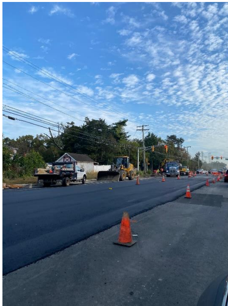
Figure 1: Base Pavement of BXKeys Road

Progress Report # 33 Friday, October 15, 2021