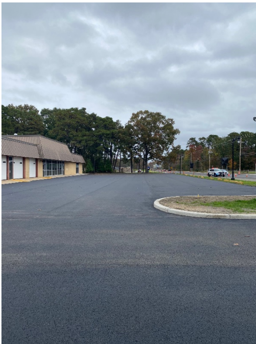
Figure 1: Camden School Driveway HMA Placement