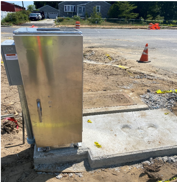
Figure 1: Meter Cabinet, Type T Installation