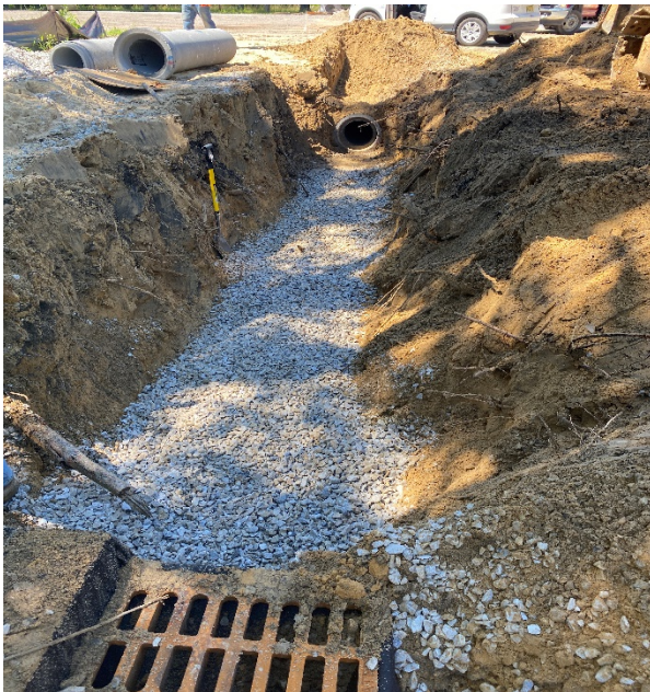
Figure 1: 18" RCP Installation