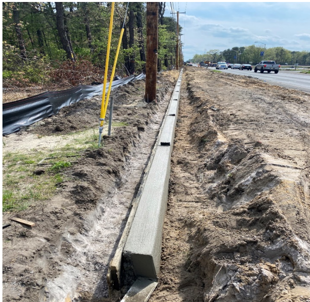
Figure 1: Curb placement across from CCTS