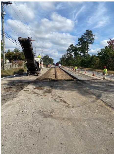
Figure 1: Milling/box out of BXKeys Road

Progress Report # 32 Friday, October 8, 2021