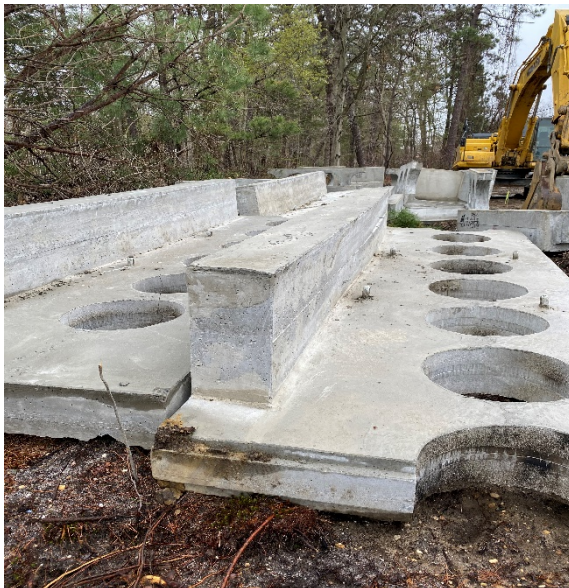
Figure 1: Headwall for pipe crossing near Old Bridge Rd Figure 2: Stripping of topsoil at CCTS pond