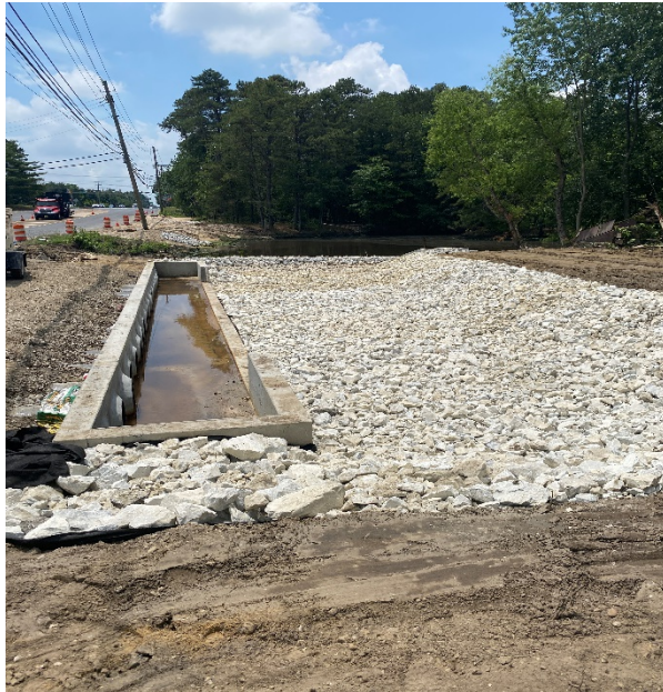
Figure 1: Riprap placement at dropbox (Sta. 10+20, LT) Figure 2: Placement of Dual Vortex Separator and Inlets