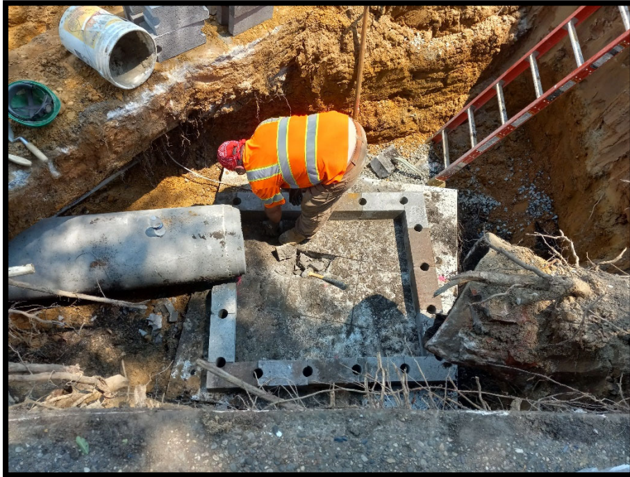
Photograph 4 – Base for Inlet #001 being installed and converted to Type “C” inlet with Leaching Basin.