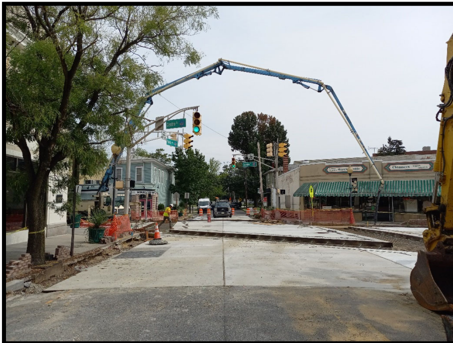
Photograph 3– Concrete pump being used to install Class V concrete for the subbase of the brick crosswalk at the Park Avenue intersection.