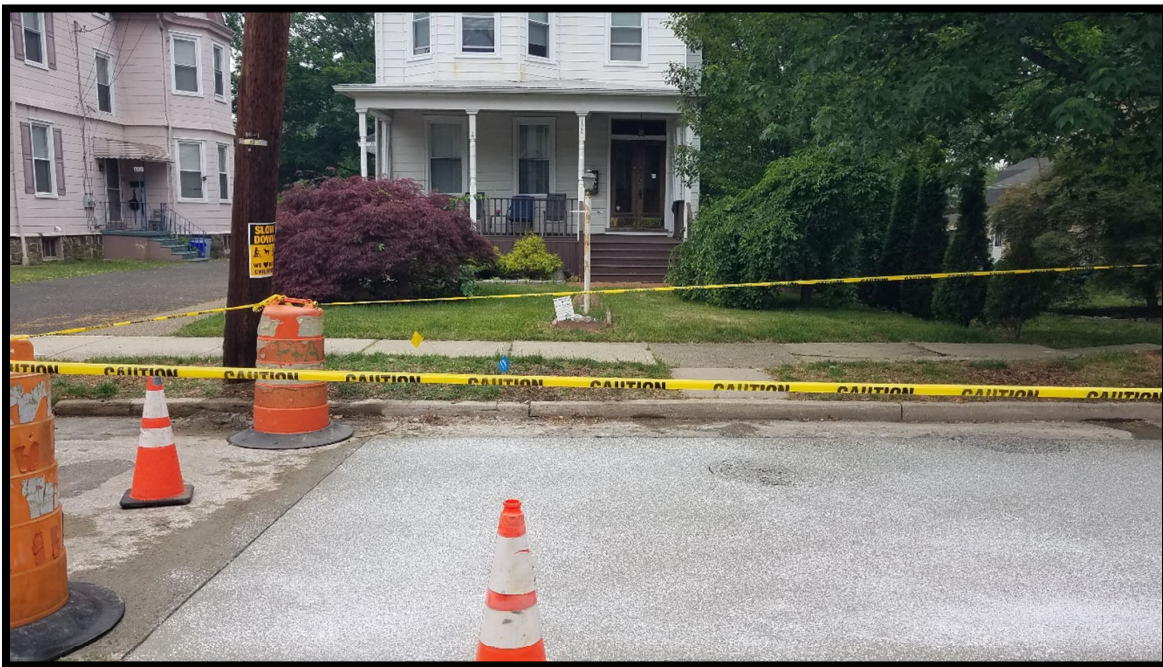
Photograph 9 – Overall photograph of completed replacement slab.