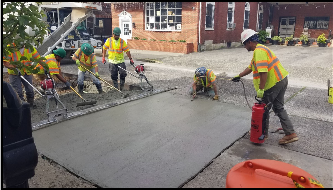
Photograph 8 – Screeding of concrete prior to finishing replacement slab.