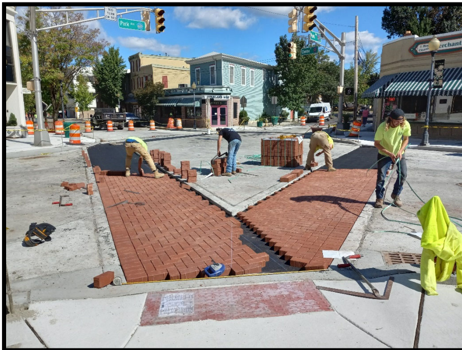
Photograph 7 – Heavy Duty Brick Pavers being installed in the crosswalks at the Centre Street and Park Avenue intersection.