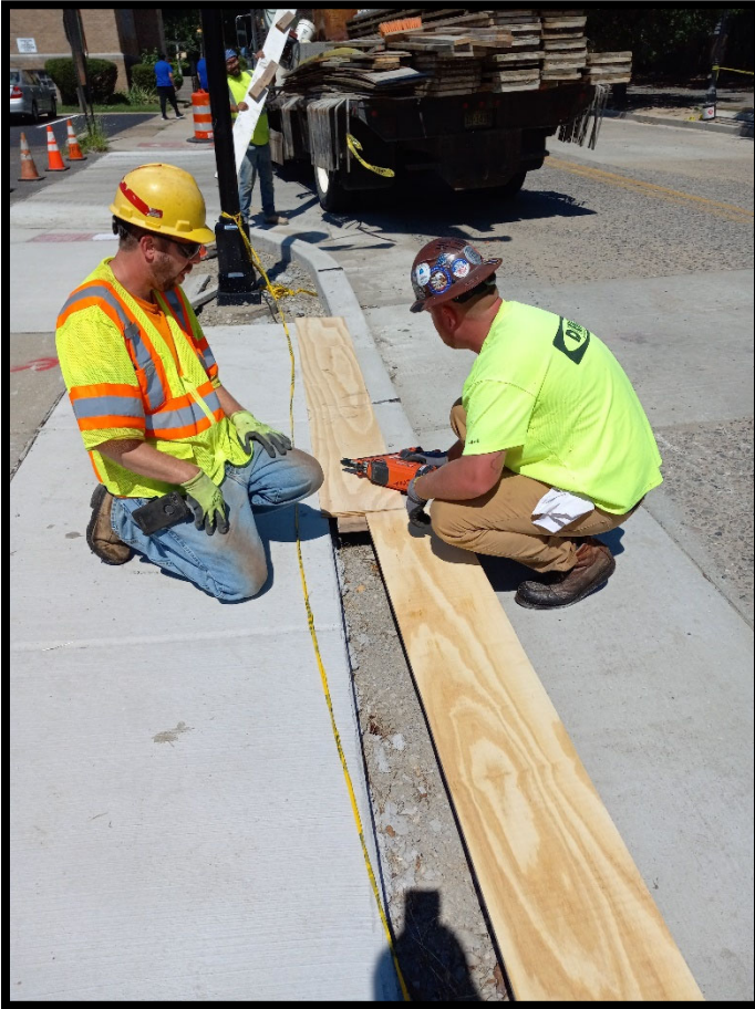
Photograph 6 – Installation of temporary plywood spacer to reduce the potential tripping hazard in the void for the future brick insets between the curb and sidewalk adjacent to the school.