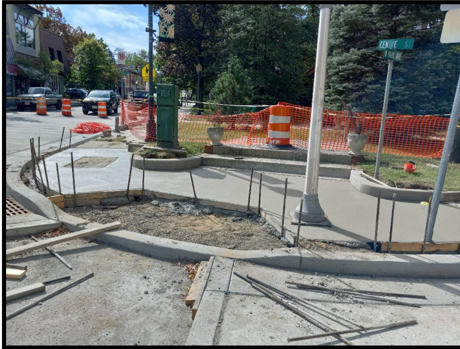
Photograph 8 – Concrete sidewalk poured at the Municipal Building stairway.