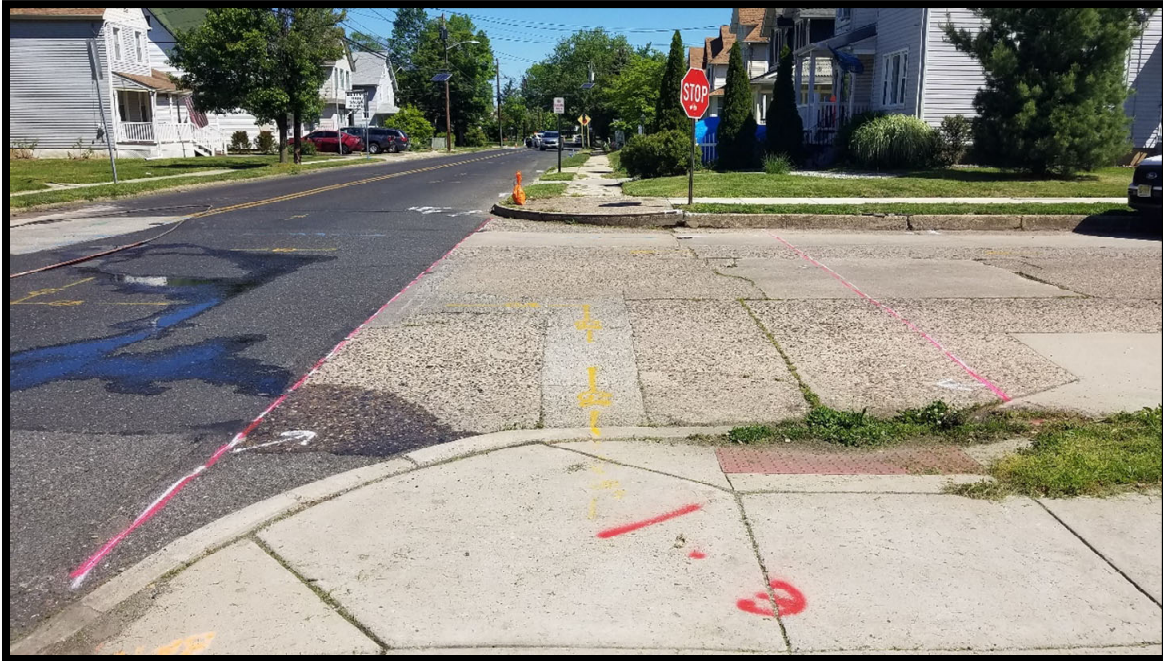
Photograph 2 – Limits of sawcutting established at the Irving Avenue intersection.