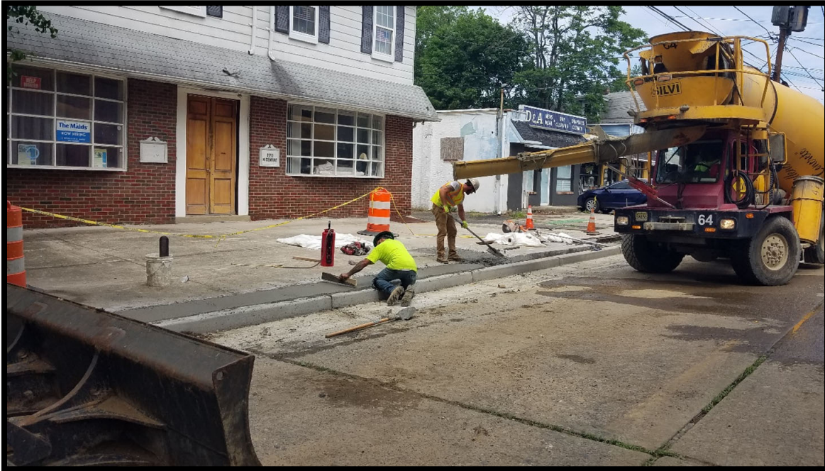
Photograph 4 – Concrete sidewalk being restored between existing sidewalk and new concrete curb and gutter.