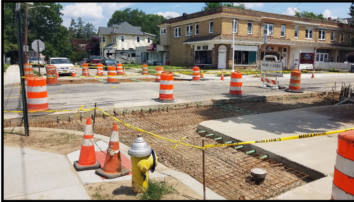
Photograph 2 – Dowels and welded wire fabric installed prior to the slab replacement at the intersection of Centre Street and Irving Avenue.