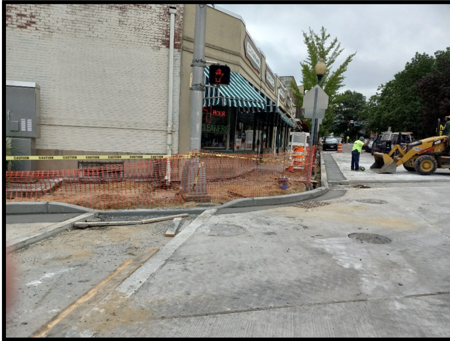
Photograph 6 – New concrete curb and gutter installed at the Centre Street and Park Avenue intersection. Note the depression for the proposed brick crosswalk.