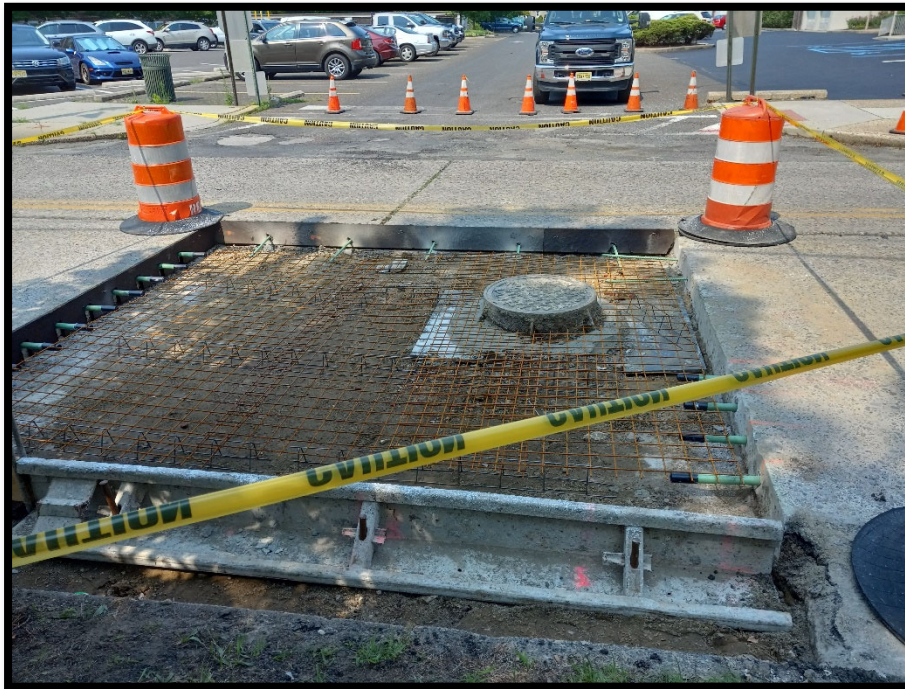
Photograph 1 – Dowels, expansion material and welded wire fabric being installed in preparation of concrete slab replacement along Centre Street between Locust Street and Maple Avenue.