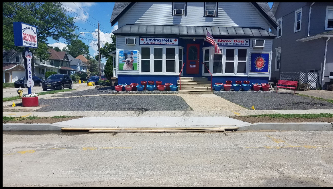
Photograph 2 – Driveway apron replacement continues between Rogers Avenue and Cedar Avenue.