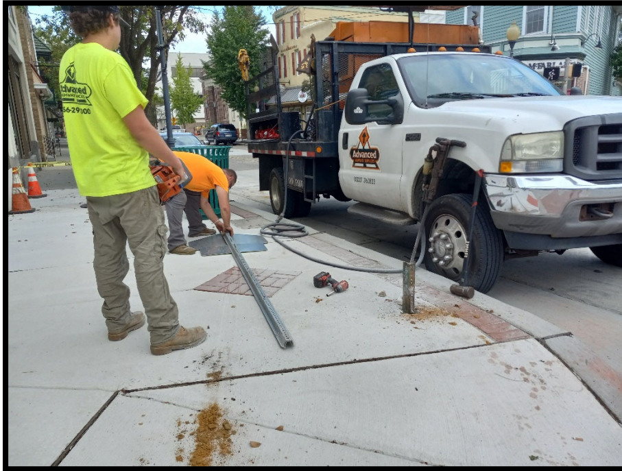
Photograph 4 – Sign subcontractor installing new signs.