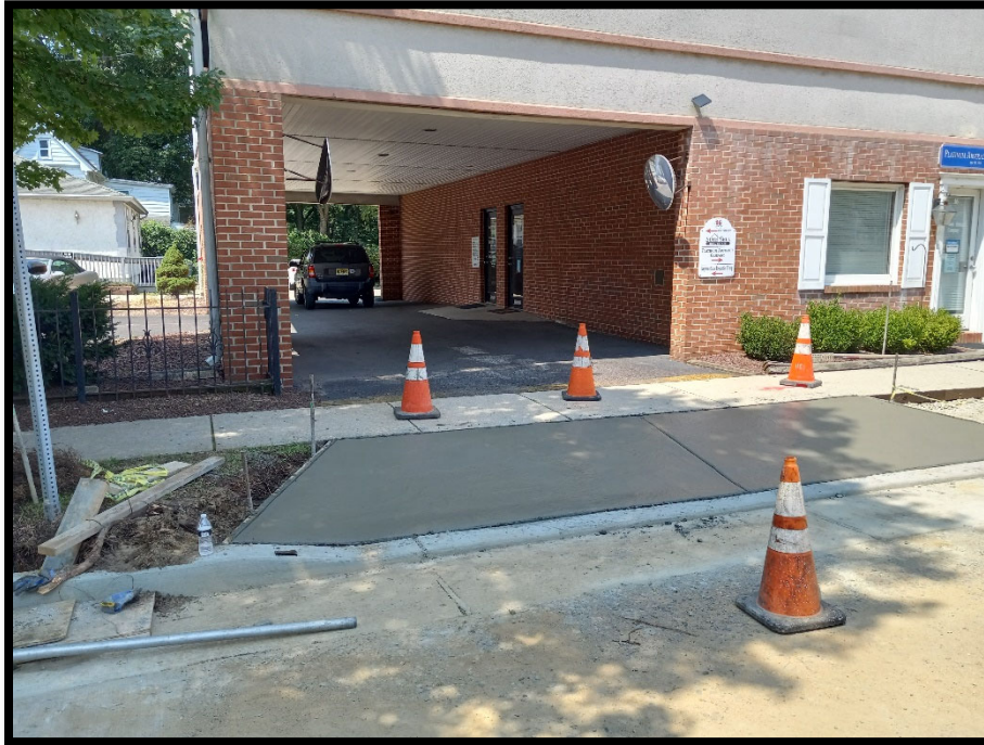
Photograph 4 – Reinforced concrete driveway aprons being installed on Centre Street between Walnut and Chestnut Avenues.

Department of Public Works Charles J. DePalma Complex 2311 Egg Harbor Road Lindenwold, NJ 08021 Phone 856.566.2980 Fax 856.566.2988 highway@camdencounty.com CamdenCounty.com