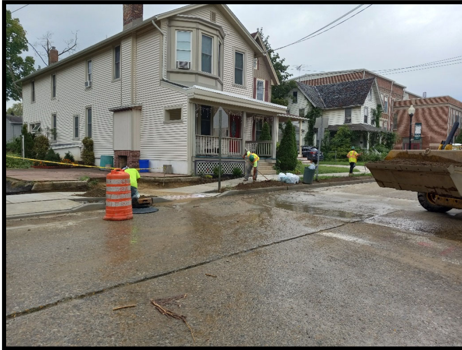
Photograph 8 – Ongoing topsoil restorations at areas disturbed by the new concrete work between Maple Avenue and Locust Street.