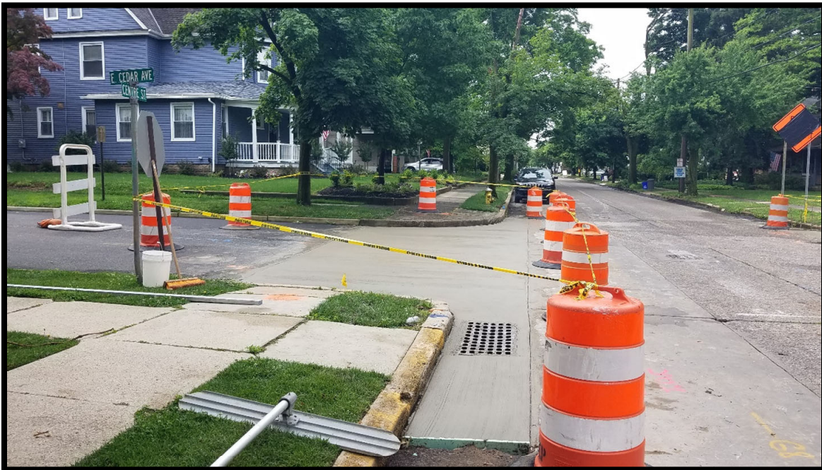
Photograph 5 – Reinforced concrete slab replacement at the Centre Street and E. Cedar Avenue intersection.