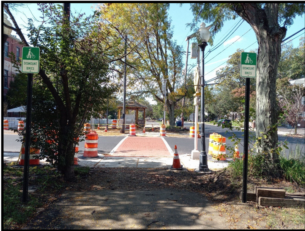
Photograph 1 – PSE&G representatives were on site to relocate three decorative lights onto the new concrete bases.