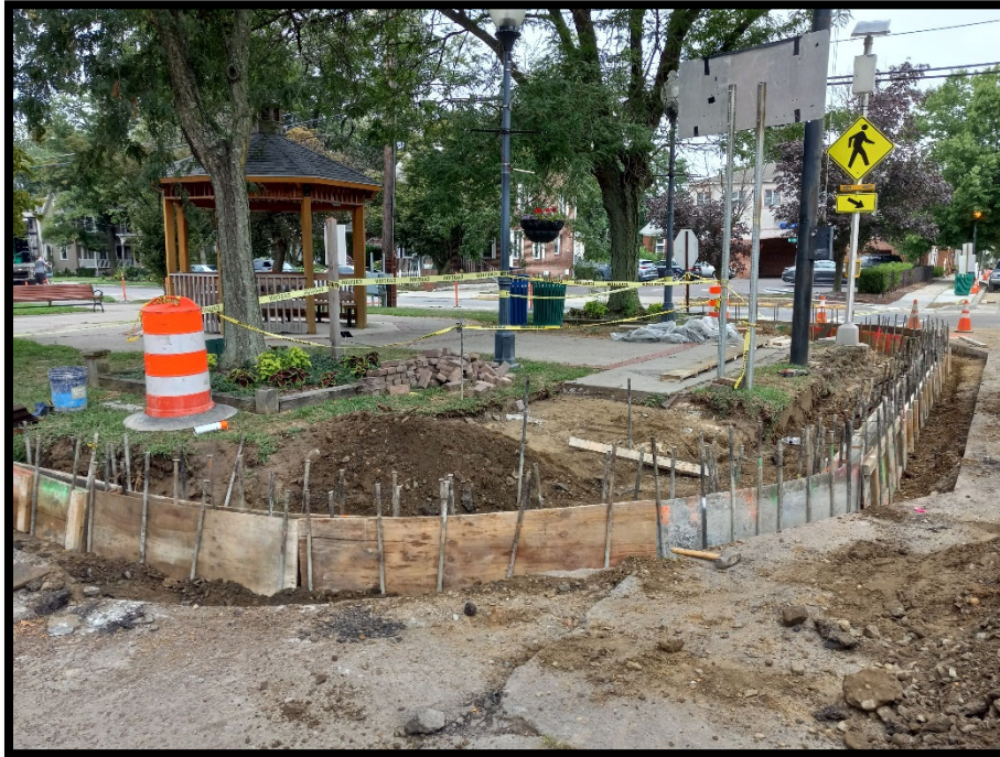
Photograph 6 – Preparing for new concrete curb and handicap ramps at the W. Chestnut Street intersection.