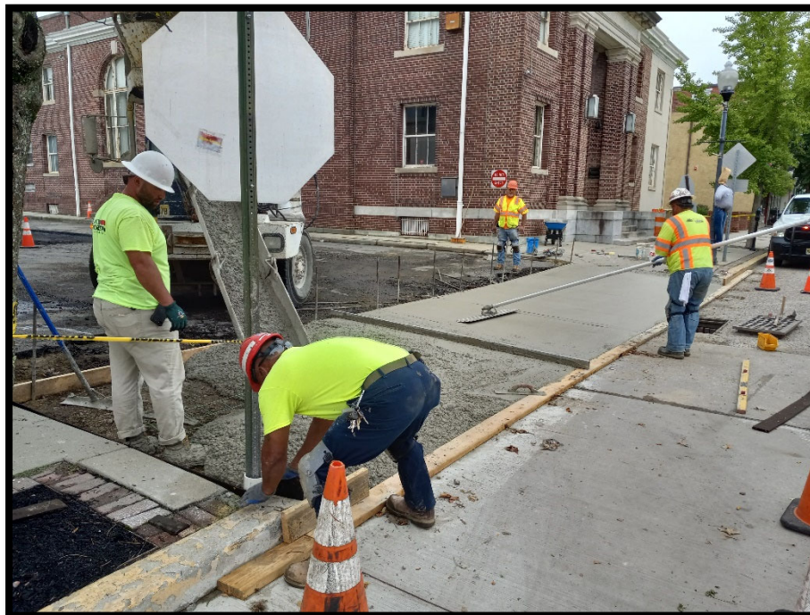
Photograph 1 – Reinforced driveway apron at entrance to laydown yard being replaced.