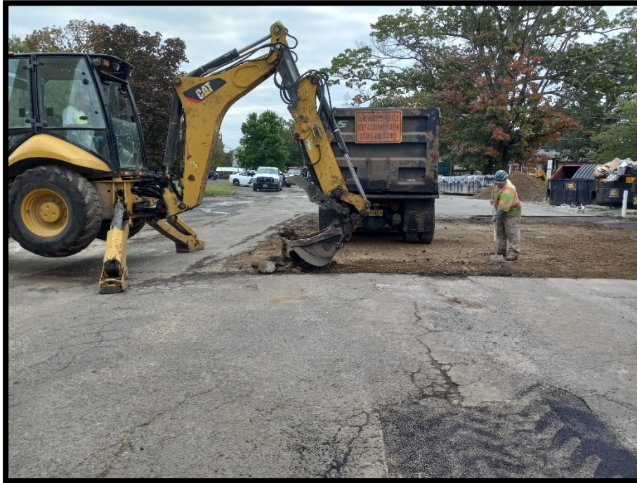
Photograph 2 – Asphalt repairs underway in the laydown yard.