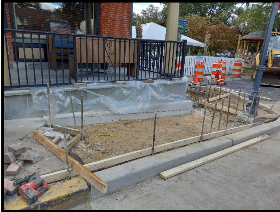
Photograph 2 – Preparing for concrete sidewalk pour adjacent to the Blue Monkey Tavern to accommodate the new ADA accessible handicap ramp at Chestnut Avenue.

Department of Public Works Charles J. DePalma Complex 2311 Egg Harbor Road Lindenwold, NJ 08021 Phone 856.566.2980 Fax 856.566.2988 highway@camdencounty.com CamdenCounty.com