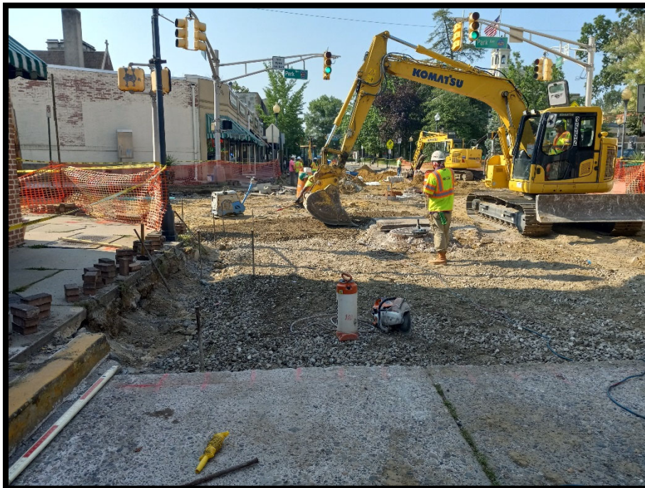
Photograph 7 – Demolition for slab replacements nearly complete at the Centre Street and Park Avenue intersection.