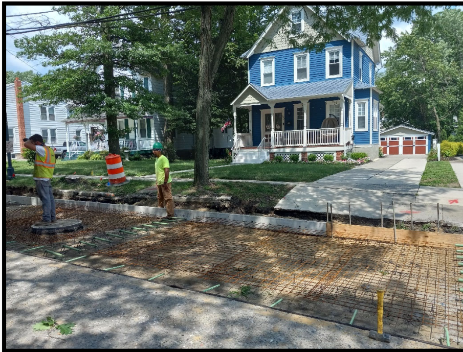
Photograph 1 – Dowels, expansion material and welded wire fabric being installed in preparation of concrete slab replacement along Centre Street between Locust Street and Maple Avenue.