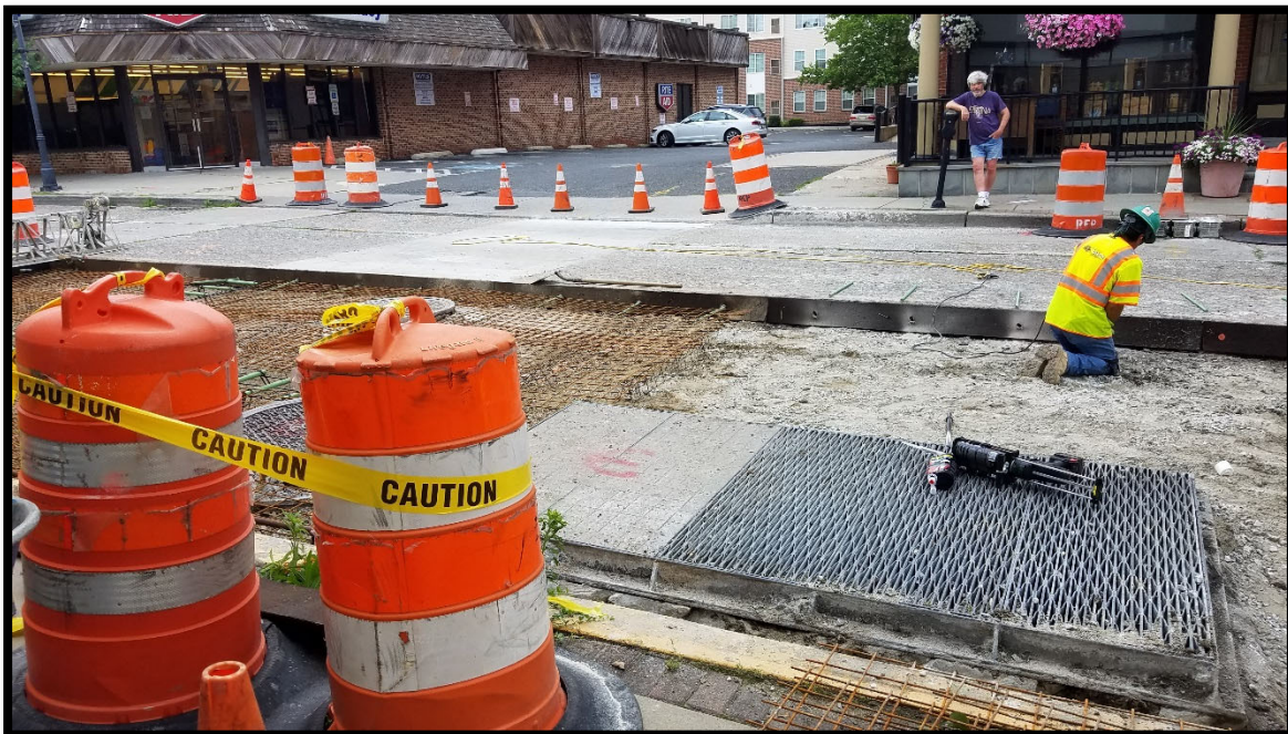
Photograph 1 – Dowels, expansion material and welded wire fabric being installed in preparation of concrete slab replacement on Centre Street near Chestnut Avenue.