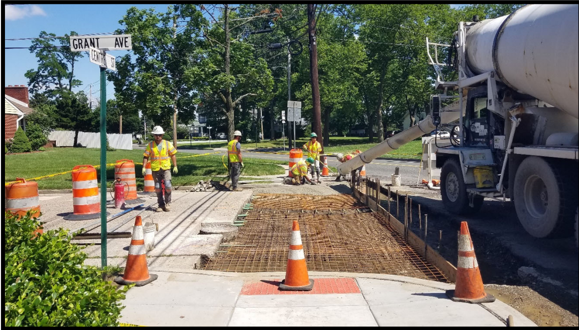
Photograph 4 – Class V concrete pour for the slab replacement at the Grant Avenue and Centre Street intersection.