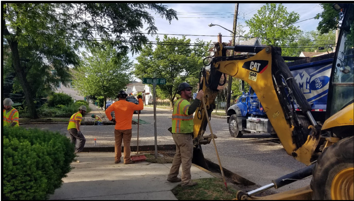
Photograph 1 – Contractor preparing concrete gutter replacement at the intersection of Centre Street and E. Walnut Avenue.