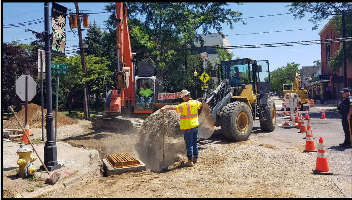
Photograph 5 – Backfilling around new inlet on Chestnut Street.