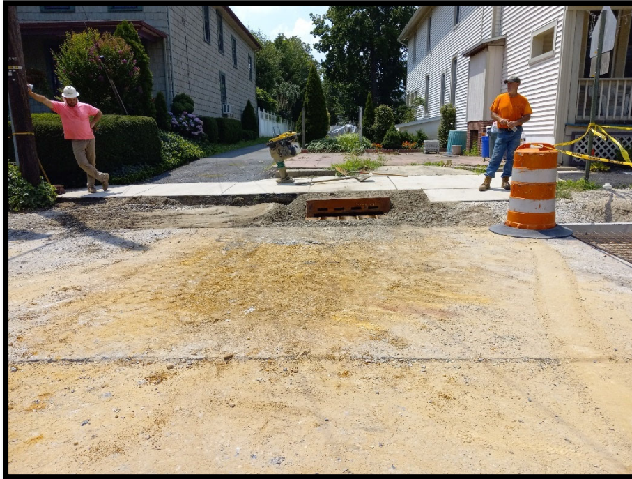
Photograph 8 – Temporary roadway restoration around new “B” inlet near Locust Street located between driveway and proposed handicap ramp location.