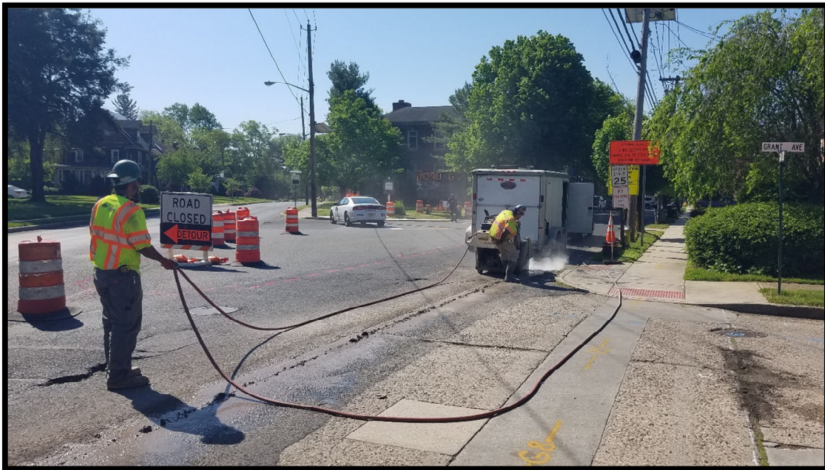
Photograph 1 – Daily Road Closure signs in place and sawcutting of concrete slated for removal being performed.