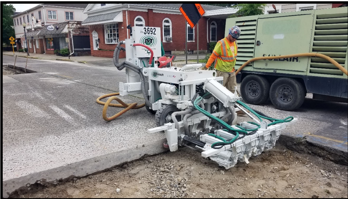
Photograph 5 – Dowel holes being drilled into the existing slab for placement of new reinforced concrete slab.