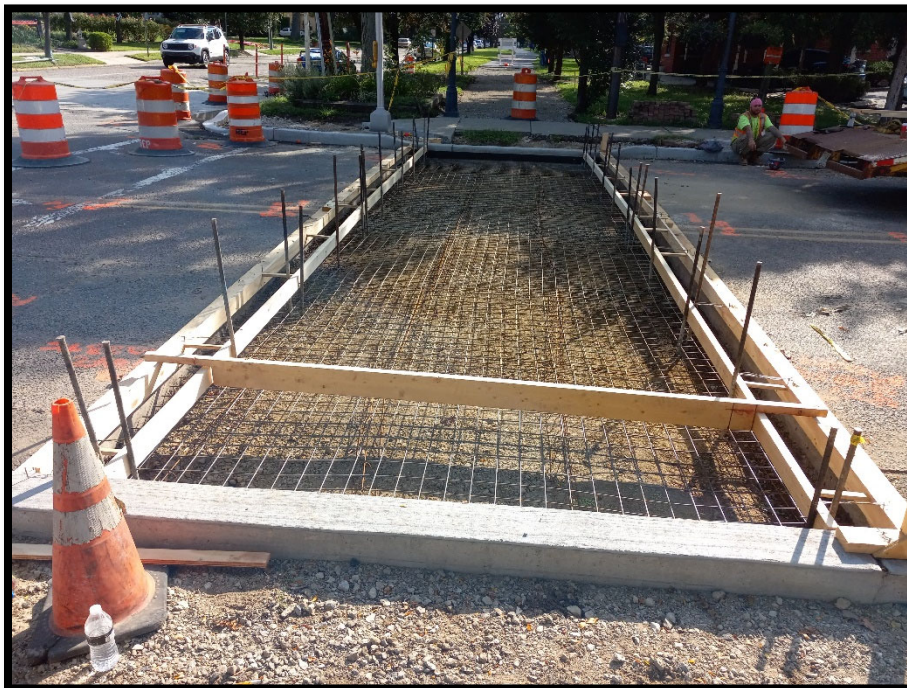
Photograph 3 – Preparing for Class V concrete pour for the subbase and header curb for the brick crosswalk at the Chestnut Avenue intersection.