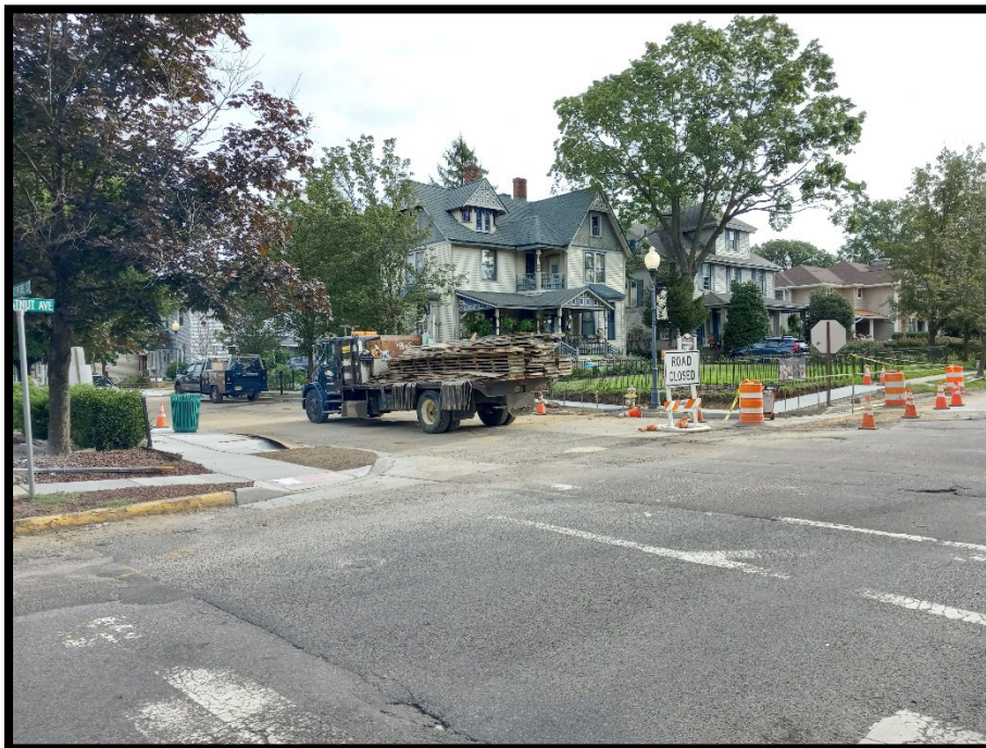
Photograph 3– Handicapped accessible ramps installed at the Chestnut Street and Centre Street Intersection.