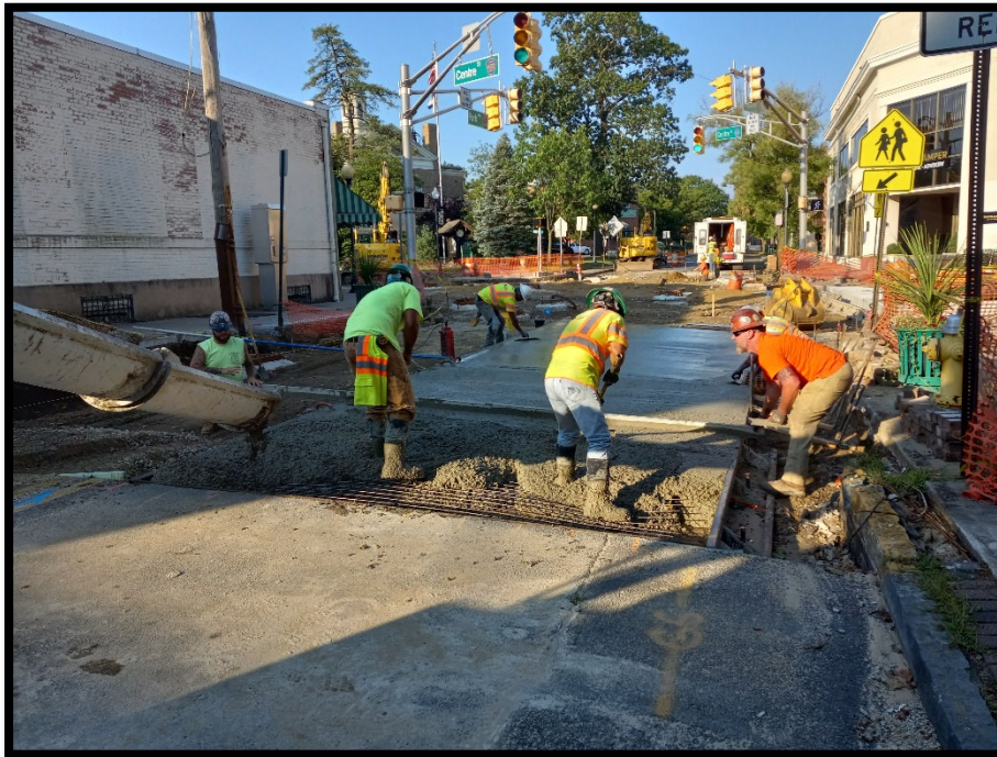
Photograph 1 – Class V concrete slab replacement pour at the Centre Street and Park Avenue intersection.