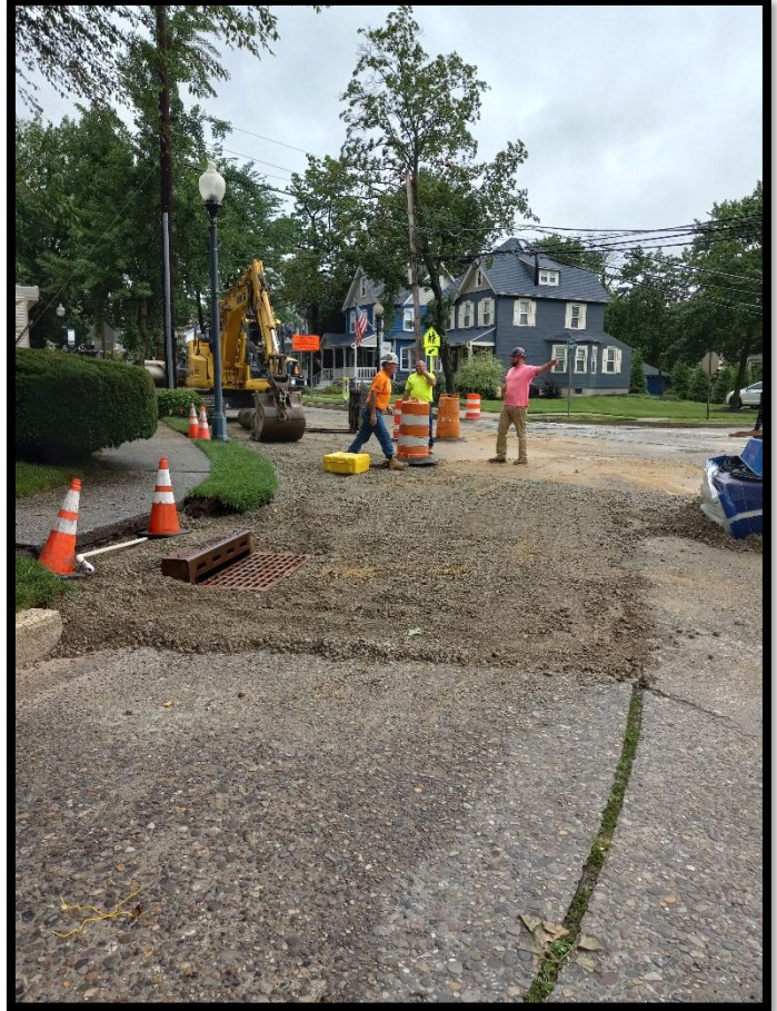
Photograph 7 – Temporary road restoration around and Inlet #001 and Manhole #002.