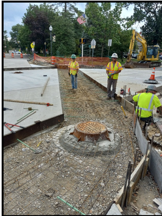
Photograph 1 – Preparing for Class V concrete pour for the subbase of the brick crosswalk at the Centre Street and Park Avenue intersection. Dowels, welded wire fabric and expansion material being placed.