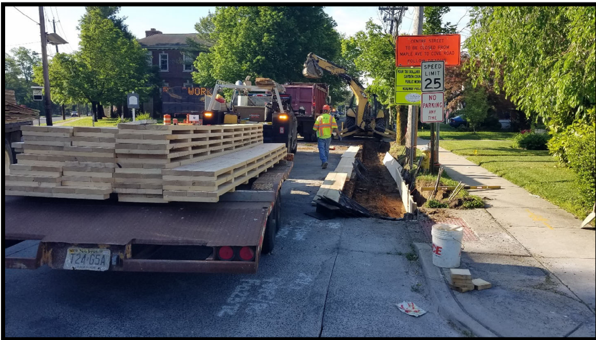
Photograph 3 – Existing curb removed and preparing for concrete pour for new curb near Cove Road.