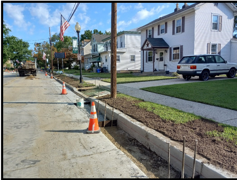
Photograph 1 – Preparing for concrete gutter and driveway apron pour along Centre Street between Maple Avenue and Locust Street.