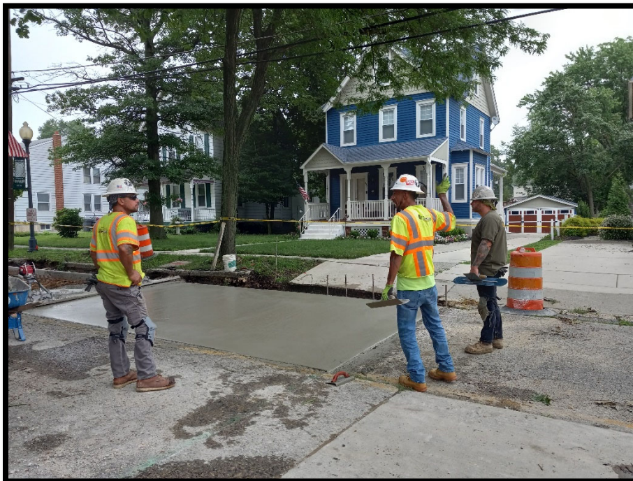
Photograph 3 – Class V concrete installed for slab replacement along Centre Street between Locust Street and Maple Avenue.