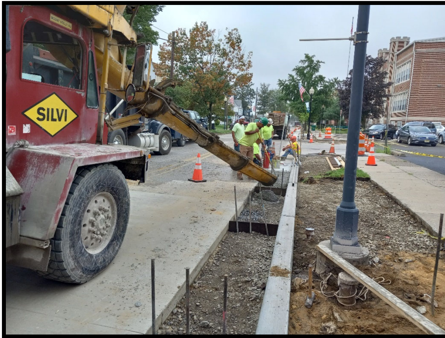
Photograph 2 – Concrete gutter being poured on Centre Street between Maple Avenue and Locust Street.