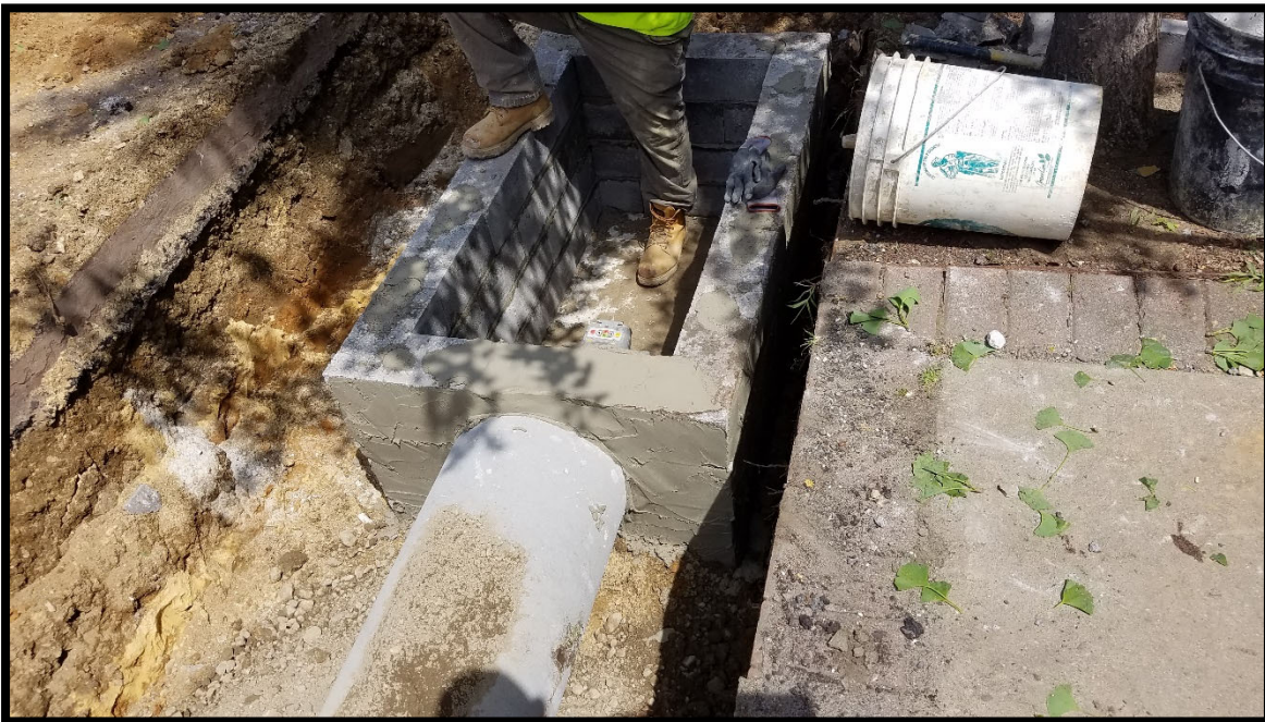
Photograph 3 – NJDOT Type "A" storm inlet #203 and Reinforced Concrete Pipe (RCP) being installed on Centre Street between inlets #202 and #203.