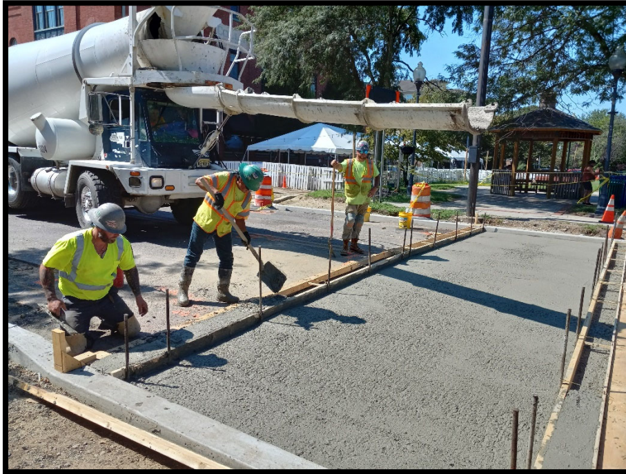
Photograph 4 – Class V concrete pour for the subbase and header curb for the brick crosswalk at the Chestnut Avenue intersection.