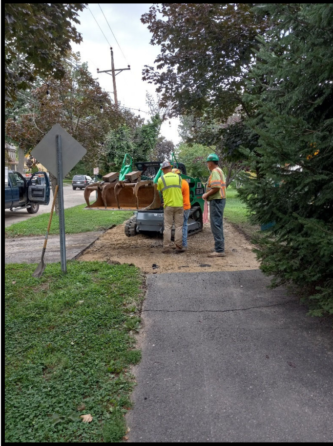
Photograph 4 – Demolition of the existing Chestnut Street multi-use path underway in preparation of widening the path to align with the new raised cross walk on Centre Street.