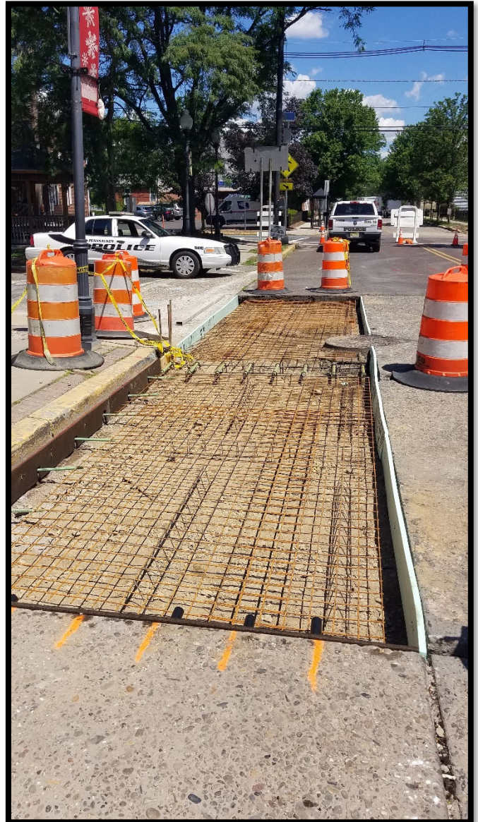
Photograph 7 – Dowels, expansion material and welded wire fabric installed in preparation of concrete slab replacement.