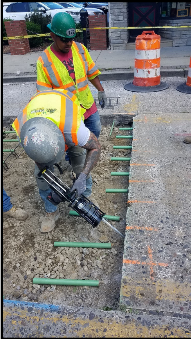
Photograph 6 – Dowels being installed in preparation of concrete slab replacement.