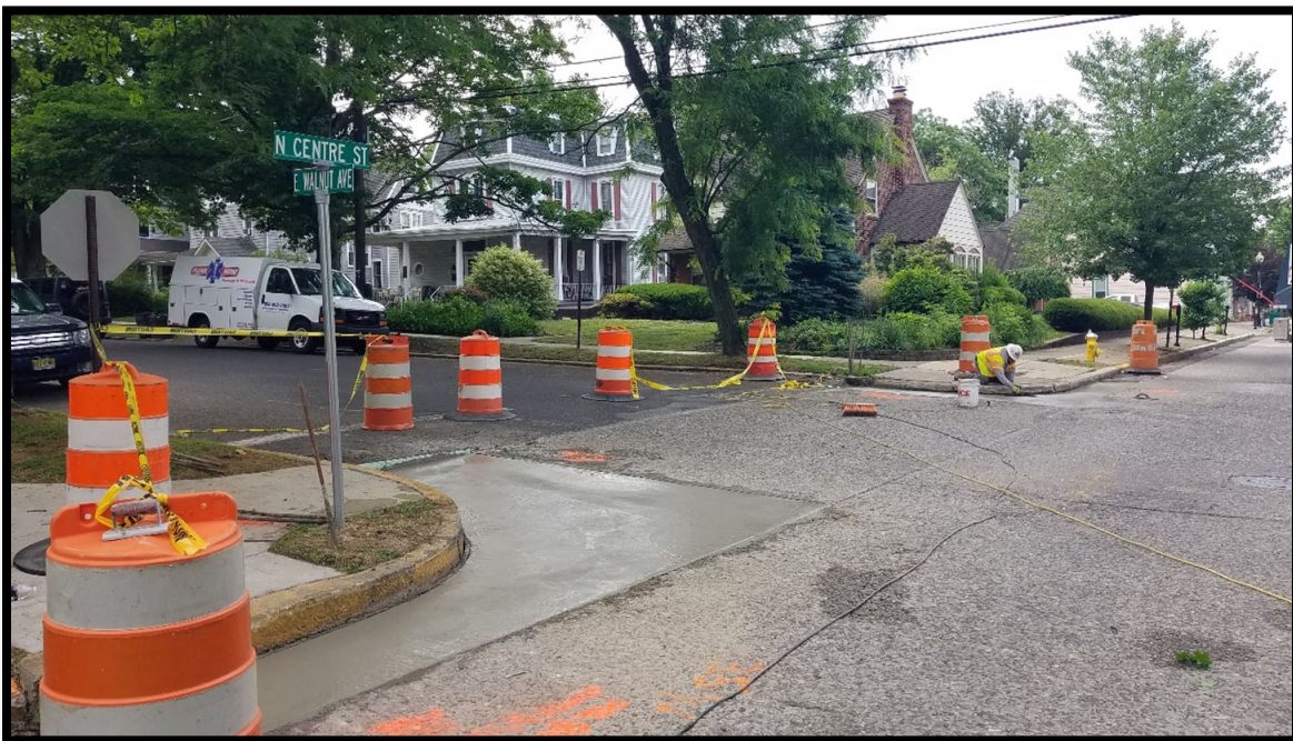
Photograph 3 – Concrete gutter replacement at the intersection of Centre Street and E. Walnut Avenue.