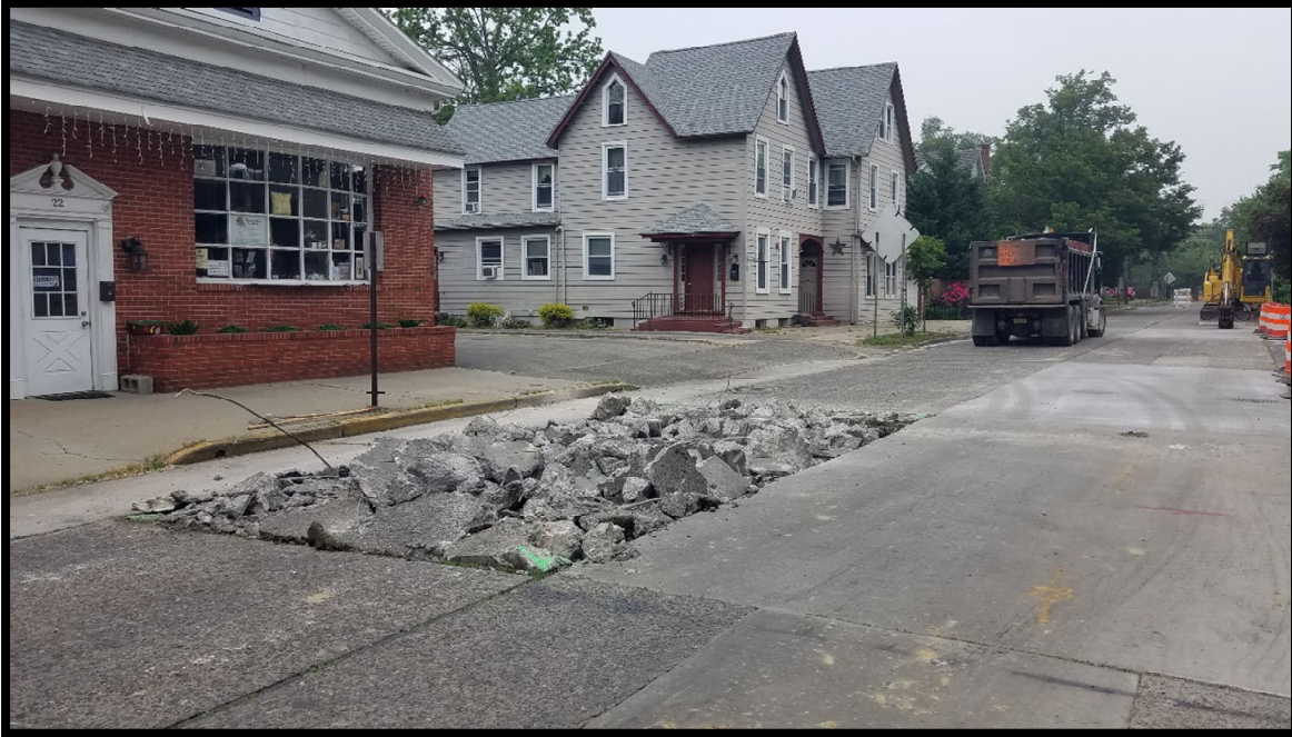
Photograph 4 – Demolition of existing concrete slab slated to be replaced on Centre Street.