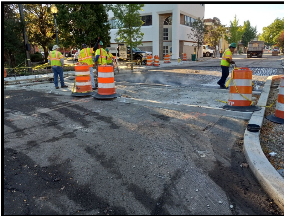
Photograph 5 – Tack Coat being applied on Centre Street near the Chestnut Avenue crosswalk.