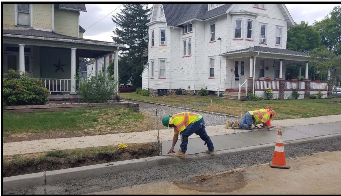
Photograph 7 – Concrete driveway installation on Centre Street between Rogers Avenue and Irving Avenue.