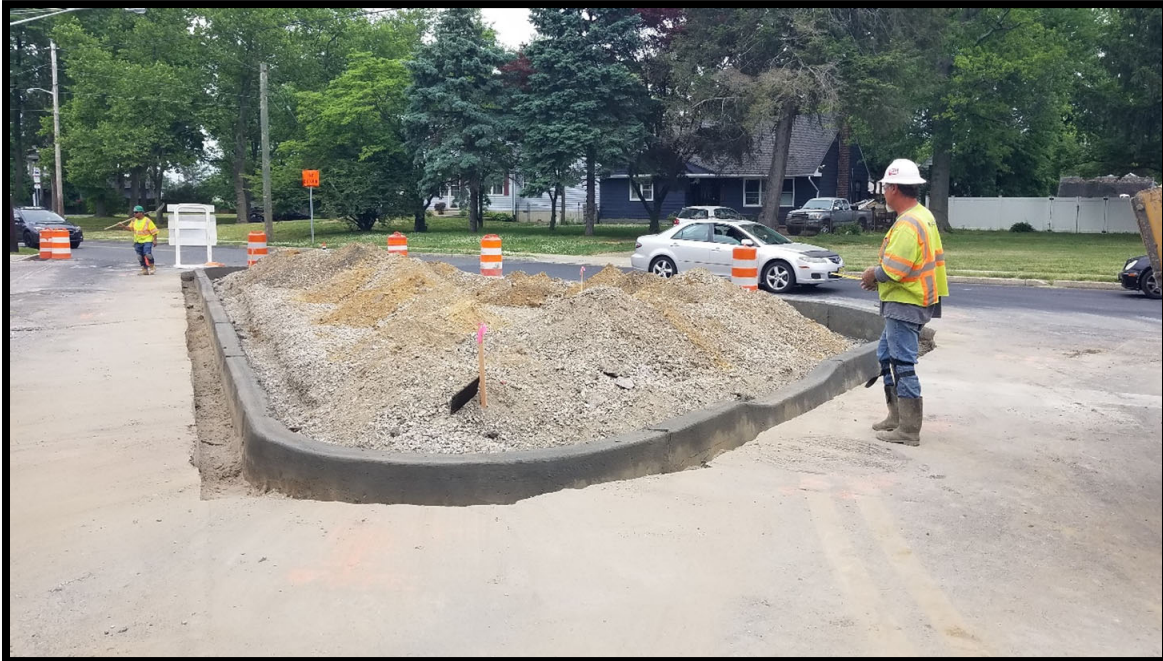
Photograph 2 – New concrete curb installed for the island at the Cove Road intersection.