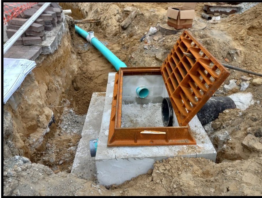
Photograph 6 – PVC header pipe for roof drains tied into Inlet #104.