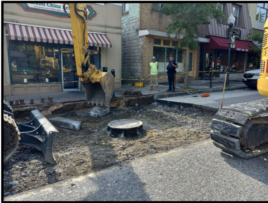
Photograph 1 – Demolition for slab replacements has commenced at the Centre Street and Park Avenue intersection.