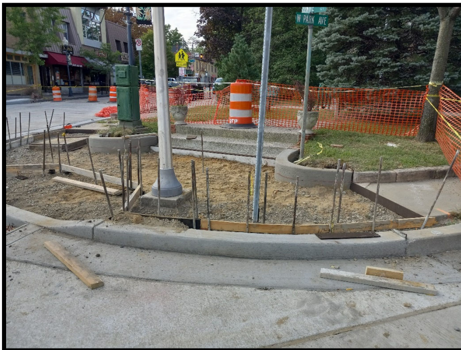
Photograph 7 – Concrete curb returns poured at the Municipal Building stairway and preparation ongoing for the new concrete sidewalk.