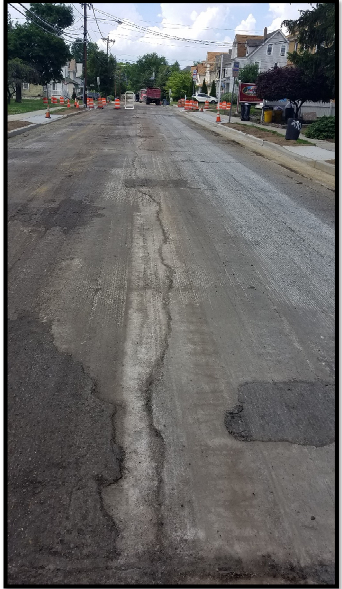
Photograph 7 – Concrete subbase after milling of asphalt overlay. Note absence of longitudinal expansion joint at centerline of roadway and longitudinal cracking of the subbase.