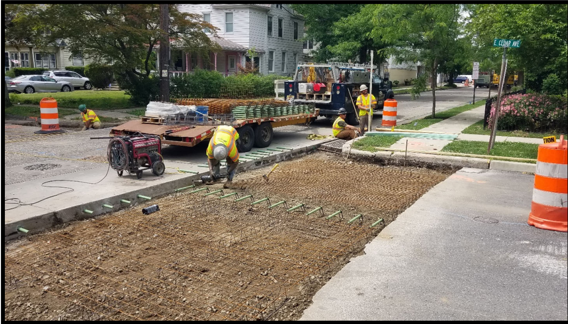
Photograph 4 – Contractor preparing the slab replacement at the Centre Street and E. Cedar Avenue intersection.