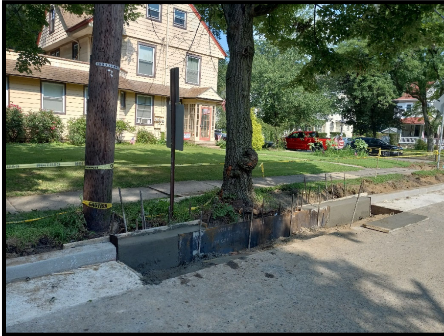
Photograph 6 – Steel Curb Tree Plate being installed prior to pouring concrete gutter.