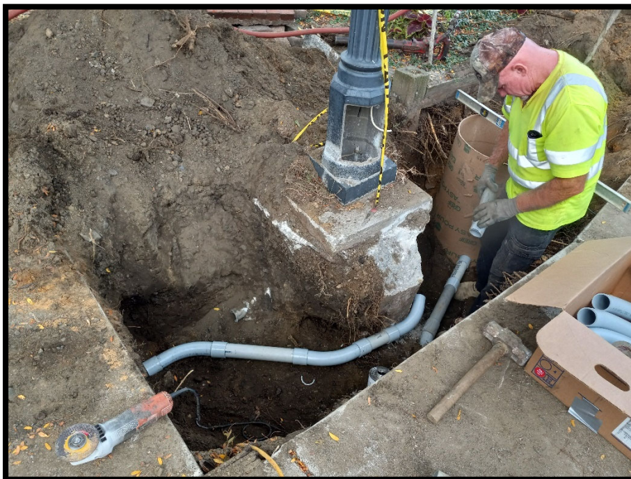
Photograph 3 – Electrical subcontractor installing bases and conduit for the relocated decorative lighting on Centre Street near Chestnut Avenue.