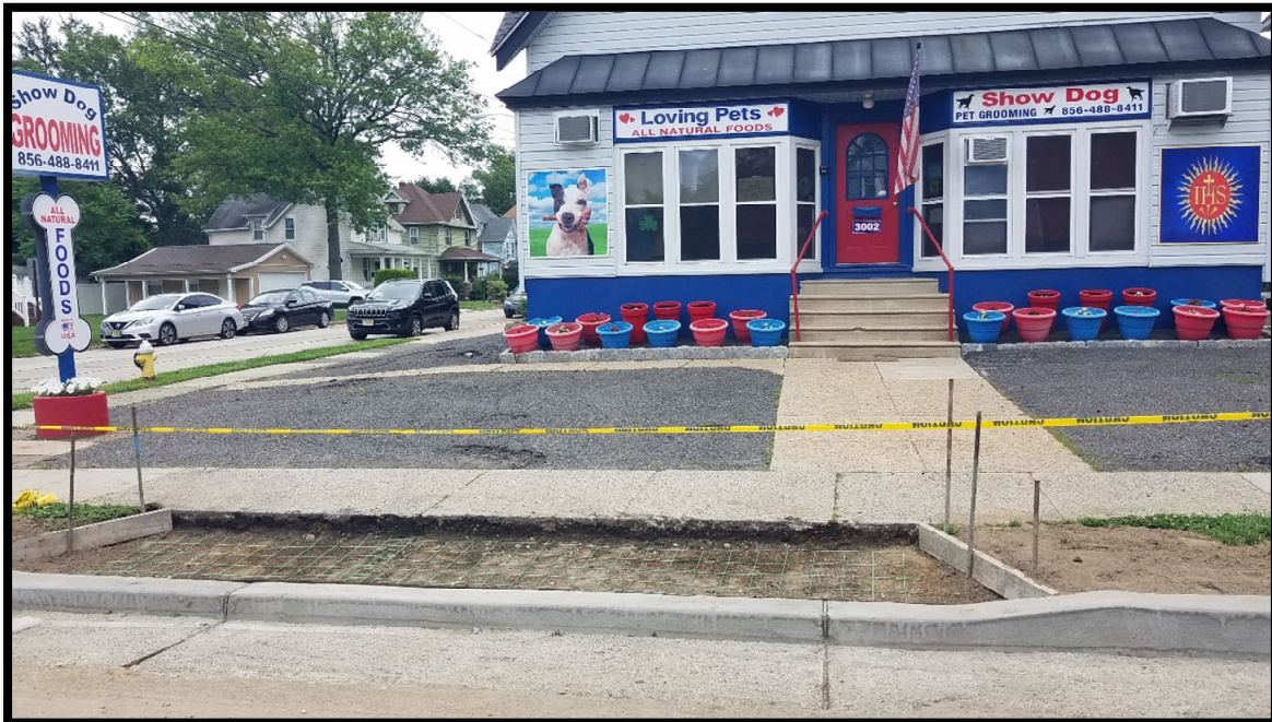
Photograph 1 – Driveway apron replacement on Centre Street continues between Rogers Avenue and Cedar Avenue.