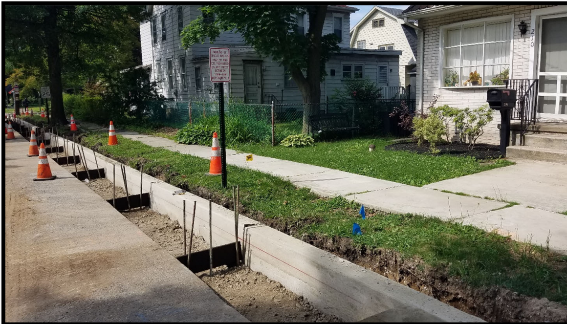
Photograph 3 – Preparing for concrete gutter replacement between Rogers Avenue and Cedar Avenue.