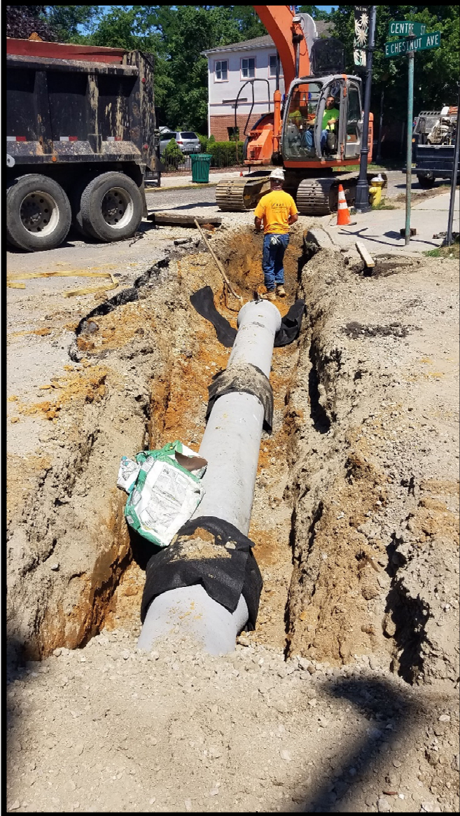
Photograph 8 – Reinforced concrete storm pipe being installed along Chestnut Avenue.