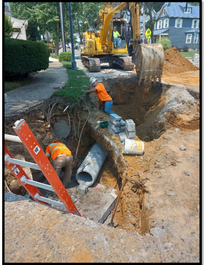
Photograph 3 – Inlet #001 being installed at the Centre Street and Locust Street intersection. Note the existing concrete encased duct bank has forced the Reinforced Concrete Pipe (RCP) to be installed lower than proposed. The inlet is being converted to an NJDOT Type “C” with Leaching Basin to accommodate the change.