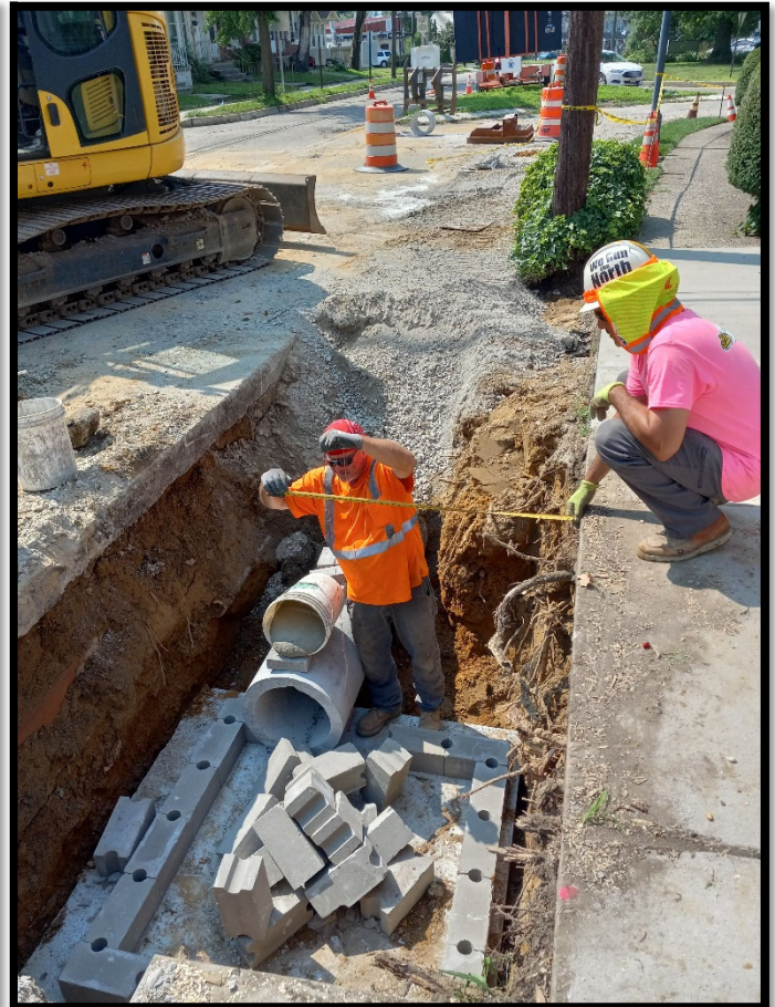
Photograph 7 – "B" Inlet being installed near Locust Street.