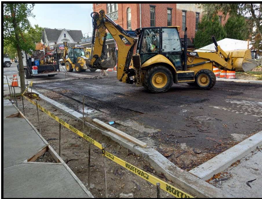
Photograph 3 – Milling and preparation work for the new Hot Mix Asphalt roadway on Centre Street near Chestnut Avenue.