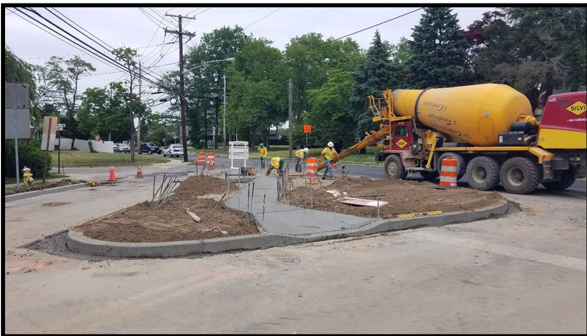
Photograph 3 – New concrete sidewalk and ADA accessible ramps being installed in island at the Cove Road intersection.