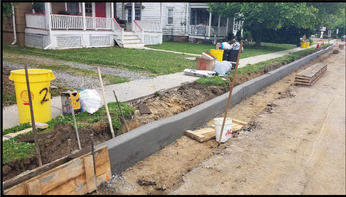
Photograph 6 – Concrete curb installation on Centre Street between Rogers Avenue and Irving Avenue.