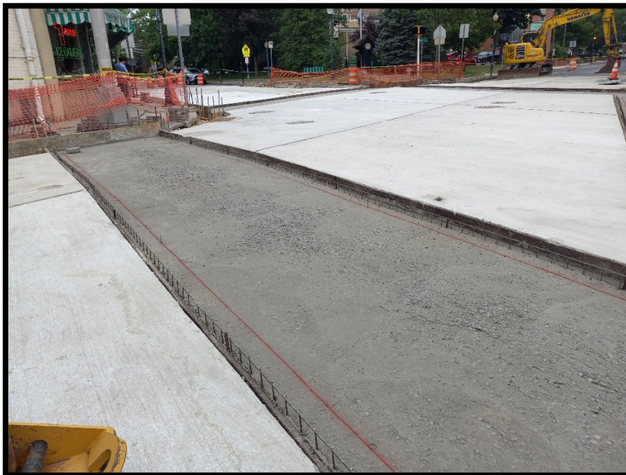
Photograph 5 – Class V concrete installed for the subbase of the brick crosswalk at the Park Avenue intersection. Note the reinforcement steel in place for the concrete restraint curb.