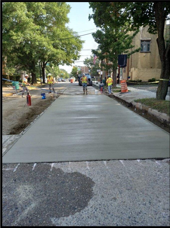
Photograph 2 – Class V concrete installed for slab replacement along Centre Street between Locust Street and Maple Avenue.