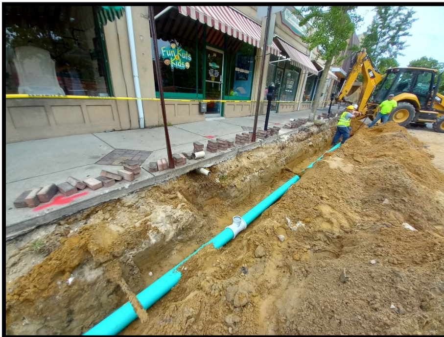
Photograph 5 – PVC header pipe being installed for roof drains.