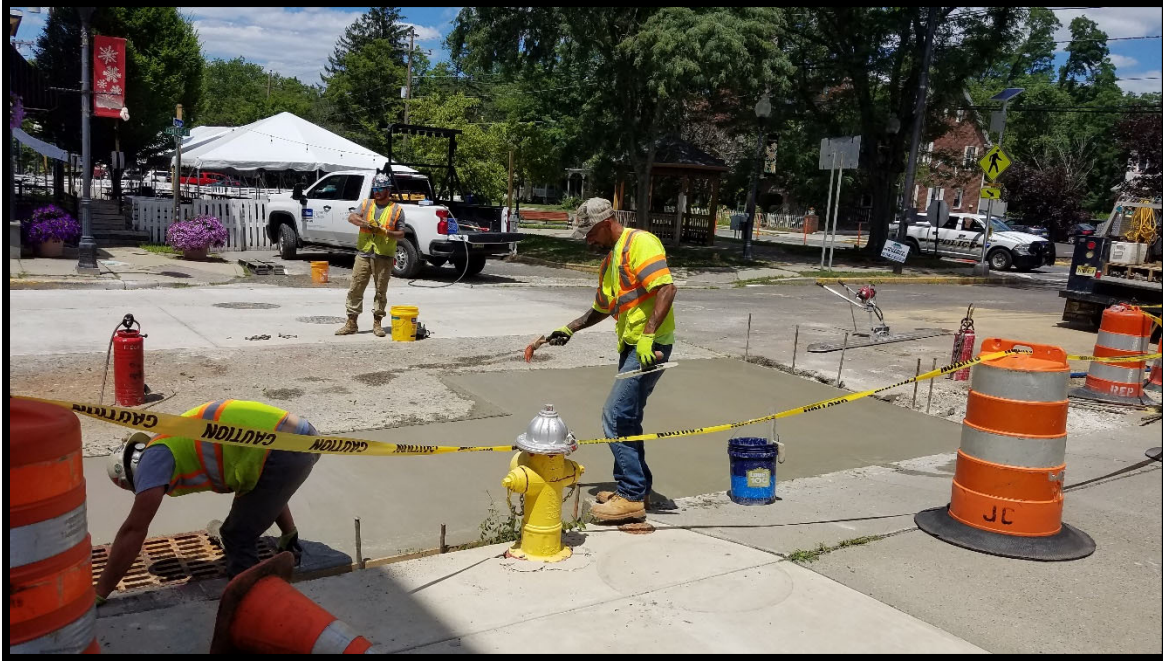
Photograph 6 – Class V concrete slab adjacent to NJDOT Type A inlet #203 being installed.