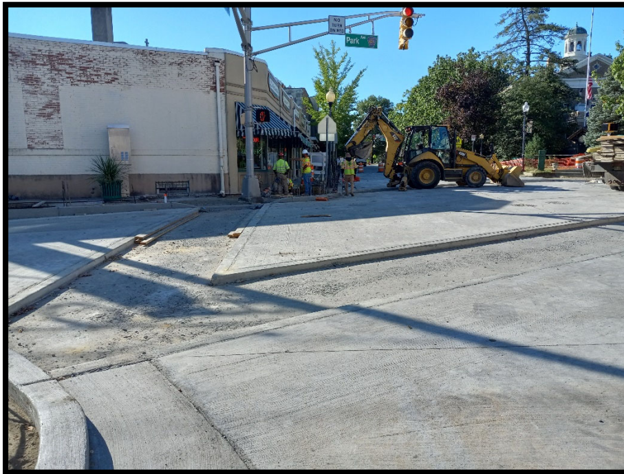
Photograph 1 – Overview of the intersection at Centre Street and Park Avenue. Note the depression in the new concrete roadway for the proposed brick crosswalks.