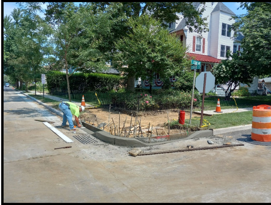
Photograph 4 – Curb depressions being installed at Cedar Avenue for handicap accessible ramps.