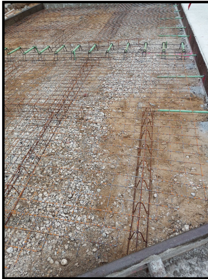
Photograph 1 – Preparing for Class V concrete slab replacement pour at the Centre Street and Park Avenue intersection. Dowels, welded wire fabric and expansion material in place.