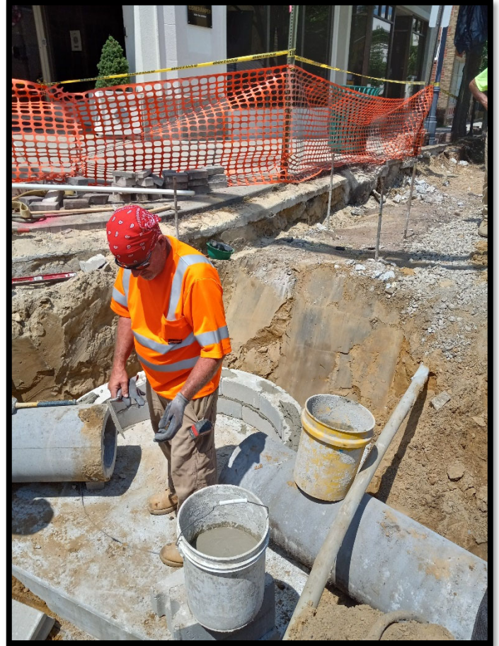
Photograph 3 – Storm improvements being installed in the Centre Street and Park Avenue intersection.