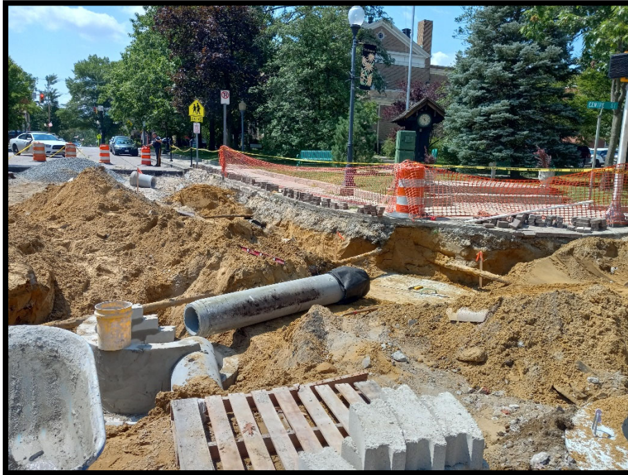
Photograph 8 – Inlets, manholes and storm pipe being installed at the Park Avenue intersection.