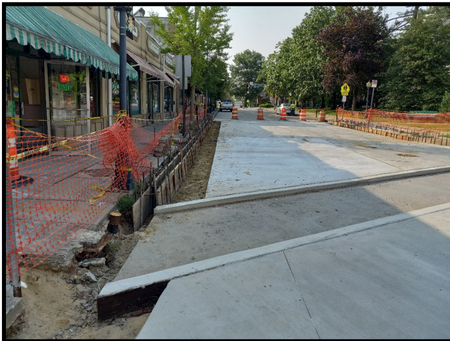
Photograph 3 – Curb forms in place along Centre Street near the Park Avenue intersection in preparation for a concrete pour.