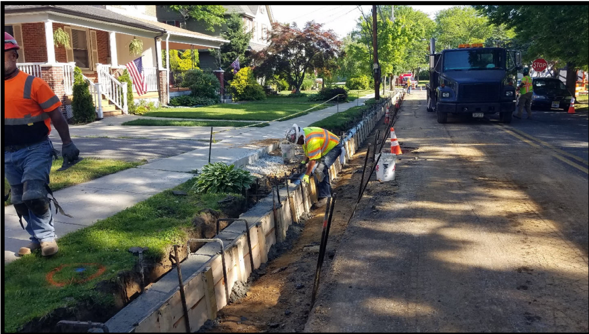
Photograph 5 – Concrete poured for new curb and contractor beginning finishing work.