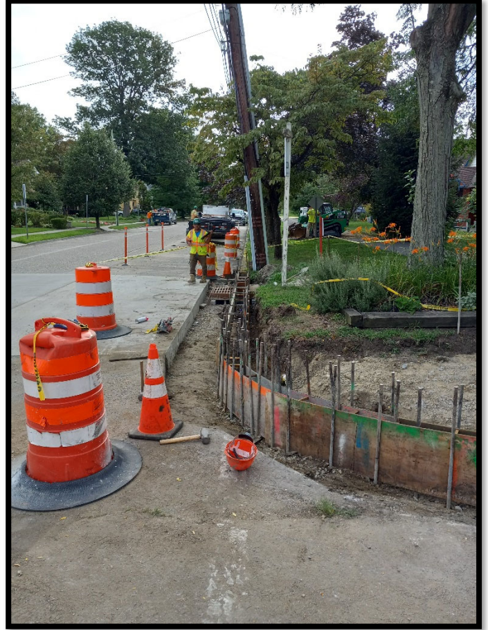
Photograph 5 – Preparing for new concrete curb and handicap ramp at the E. Chestnut Street intersection.