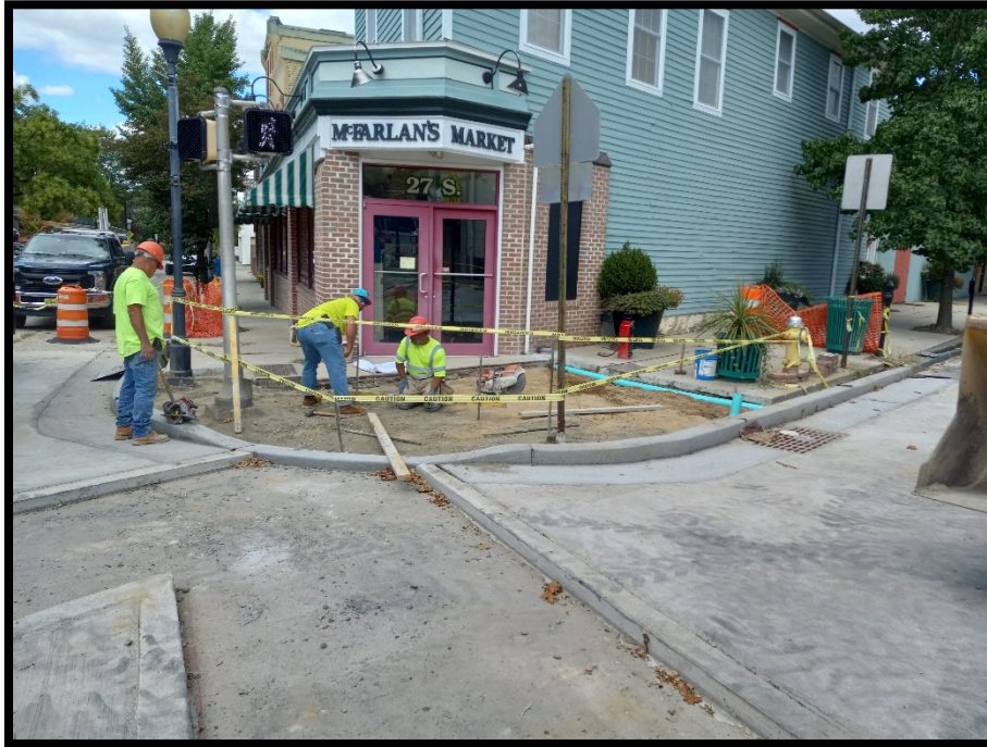
Photograph 4 – Preparing for concrete sidewalk pour at the Centre Street and Park Avenue intersection. Note the roof drain has been replaced with PVC pipe.