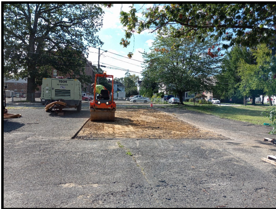
Photograph 5 – Asphalt repairs underway in the parking lot of the laydown yard.