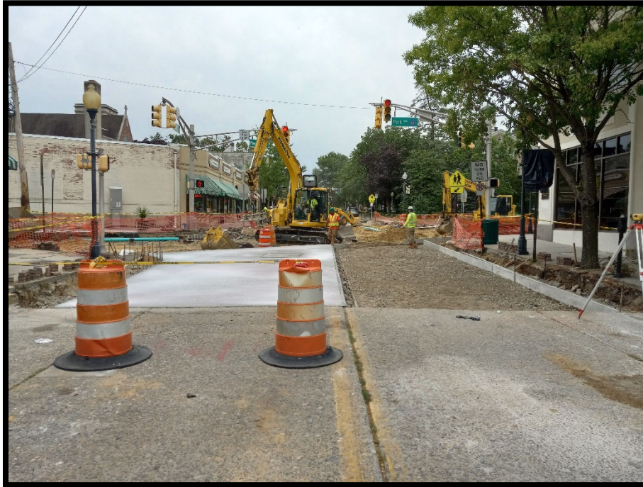
Photograph 8 – Slab replacements continuing at the Centre Street and Park Avenue intersection.