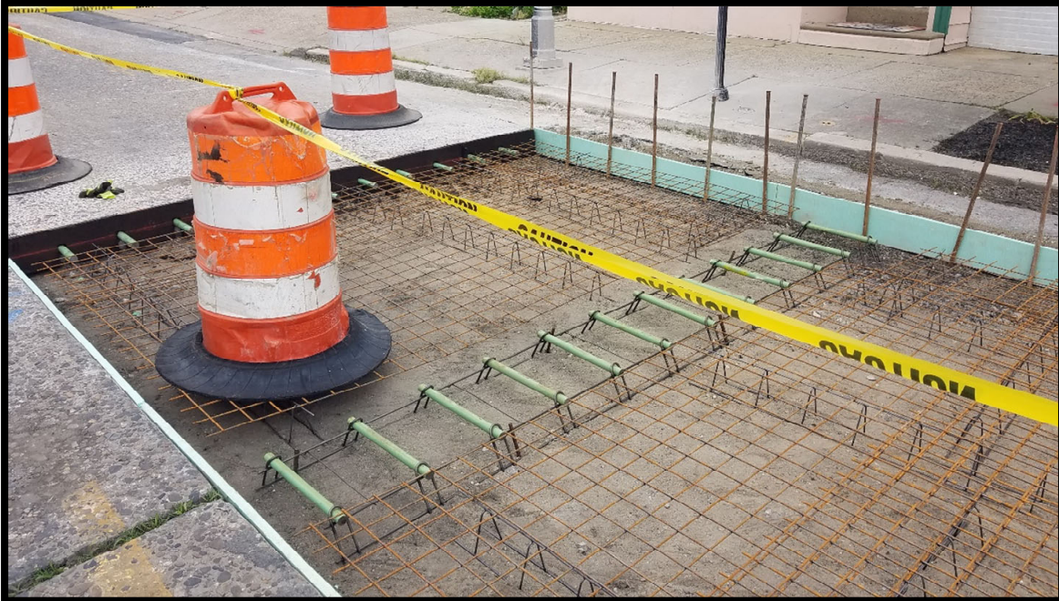
Photograph 6 – Dowels and reinforcement installed prior to installation of replacement slab.

Department of Public Works Charles J. DePalma Complex 2311 Egg Harbor Road Lindenwold, NJ 08021 Phone 856.566.2980 Fax 856.566.2988 highway@camdencounty.com CamdenCounty.com