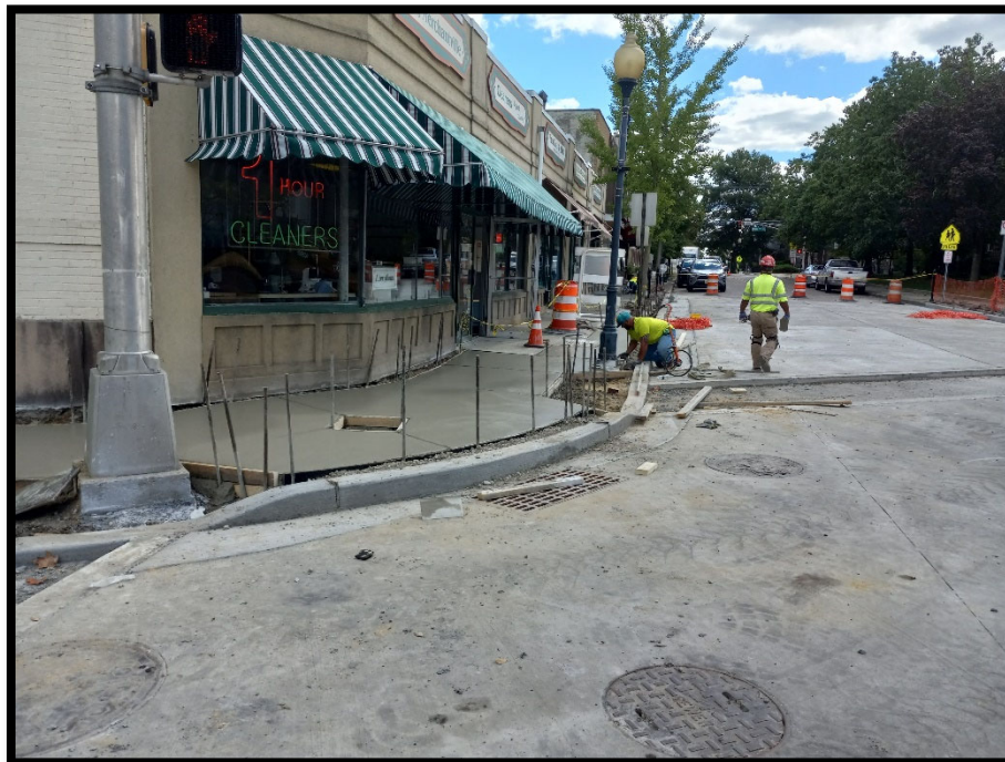
Photograph 3 – Concrete sidewalk pour at the Centre Street and Park Avenue intersection.