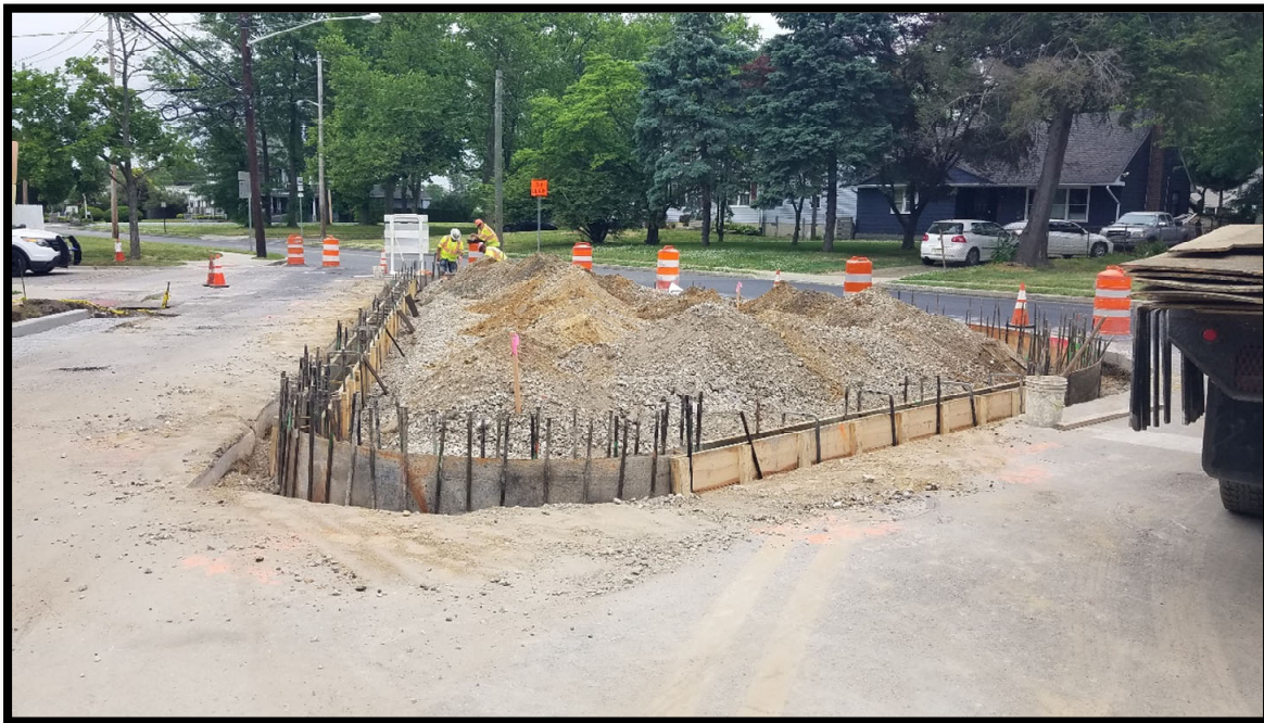
Photograph 1 – Concrete forms in place for the new curb of the island at the Cove Road intersection.