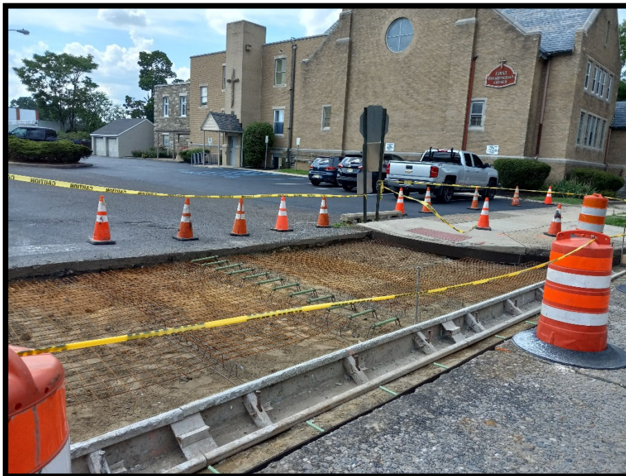
Photograph 5 – Preparing for concrete pour of driveway apron at church parking lot.