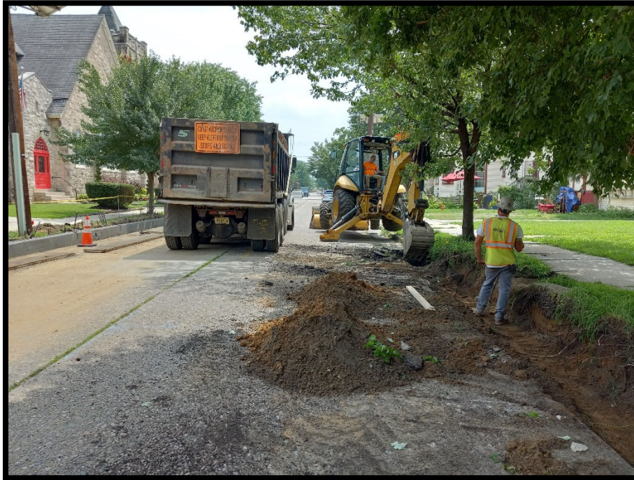
Photograph 2 – Concrete curb and gutter being installed on Centre Street between Cedar and Walnut Avenues.