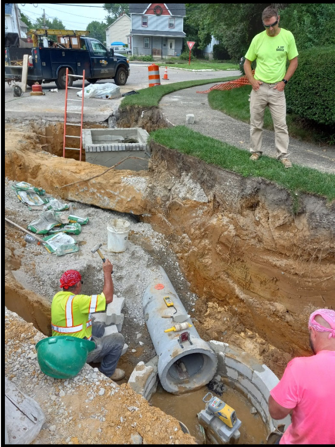
Photograph 6 – Manhole #002 in foreground and Inlet #001 in background with connecting RCP running under concrete encased duct bank.