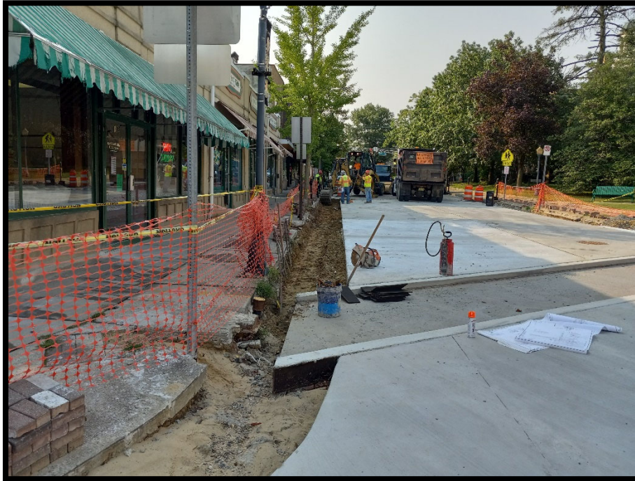
Photograph 2 – Existing curb and gutter removed from Centre Street near the Park Avenue intersection.