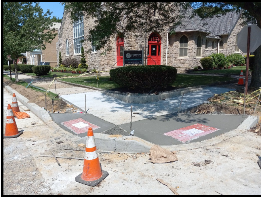
Photograph 6 –Handicap ramps and header curb installed at the Walnut Avenue intersection.