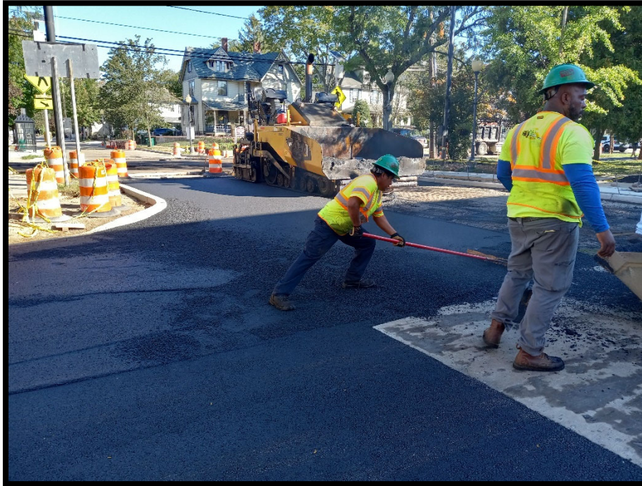
Photograph 6 – Asphalt overlay being installed on Centre Street near the Chestnut Avenue crosswalk.