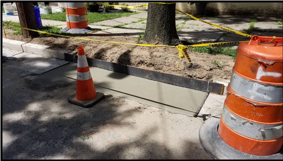
Photograph 9 – Steel Curb Tree Plate and concrete gutter installed per plan.