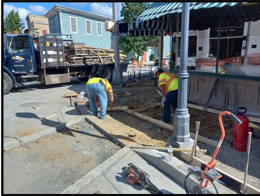
Photograph 2 – Preparing for concrete sidewalk pour at the Centre Street and Park Avenue intersection.