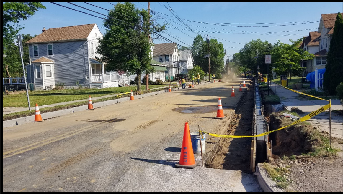
Photograph 6 – General view of new curb.