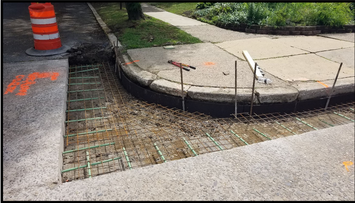
Photograph 2 – Dowels, expansion material and welded wire fabric installed prior to the concrete gutter replacement at the intersection of Centre Street and E. Walnut Avenue.