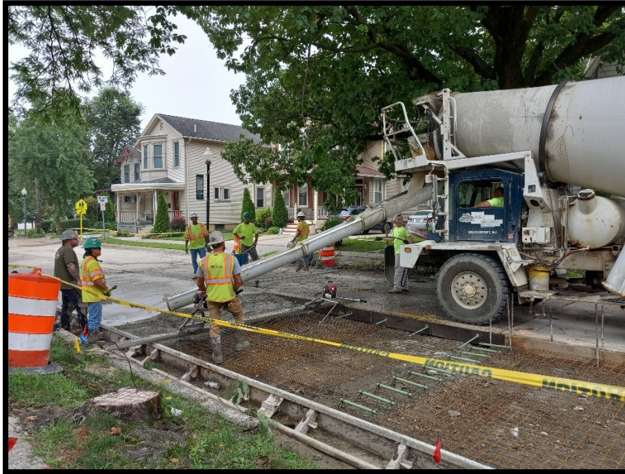
Photograph 2 – Class V concrete being installed for slab replacement along Centre Street between Locust Street and Maple Avenue.