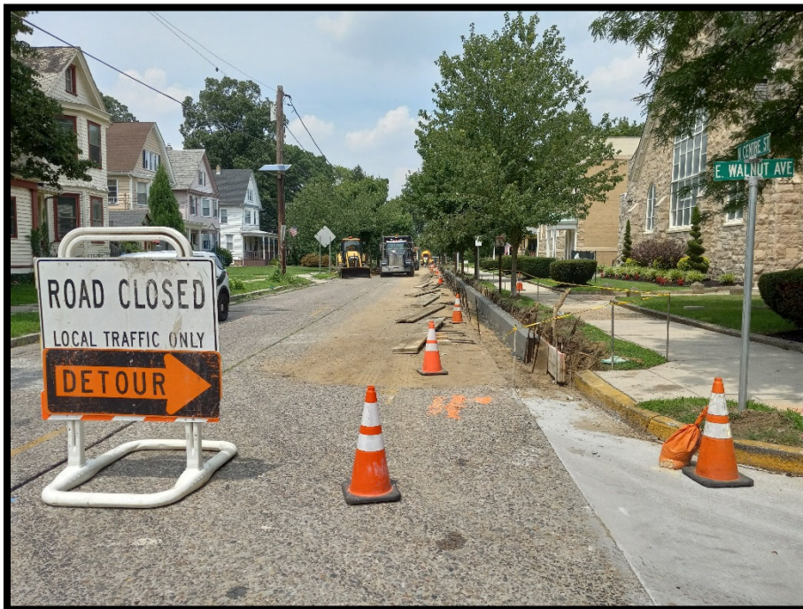
Photograph 3 – Concrete curb and gutter being installed on Centre Street between Cedar and Walnut Avenues.