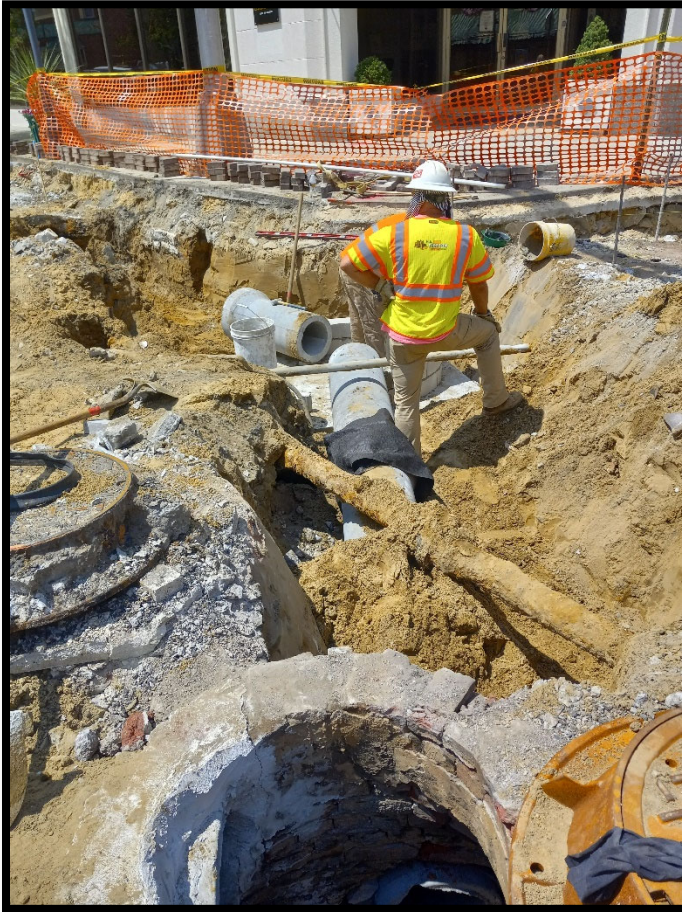
Photograph 2 – Storm improvements being installed in the Centre Street and Park Avenue intersection.

Department of Public Works Charles J. DePalma Complex 2311 Egg Harbor Road Lindenwold, NJ 08021 Phone 856.566.2980 Fax 856.566.2988 highway@camdencounty.com CamdenCounty.com