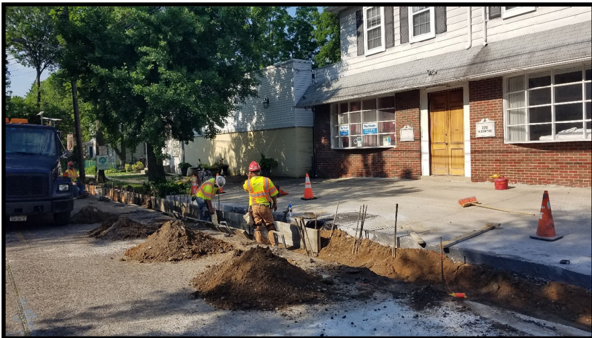
Photograph 1 – Curb installation continues between Rogers Avenue and Cedar Avenue.