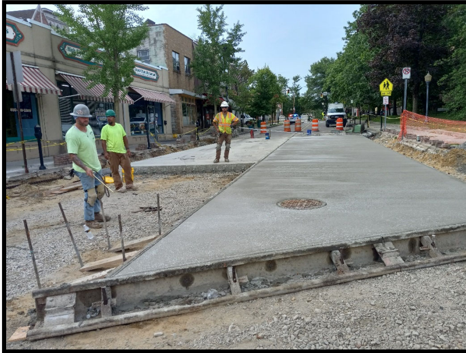
Photograph 2 – Class V concrete installed in the Park Avenue and Centre Street intersection. Preparation for the next concrete pour is underway.

Department of Public Works Charles J. DePalma Complex 2311 Egg Harbor Road Lindenwold, NJ 08021 Phone 856.566.2980 Fax 856.566.2988 highway@camdencounty.com CamdenCounty.com