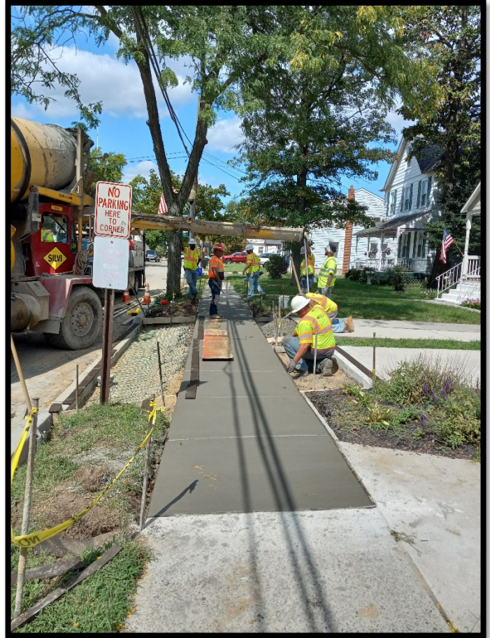
Photograph 7 – Driveway apron and sidewalk replacement ongoing along Centre Street between Maple Avenue and Locust Street.