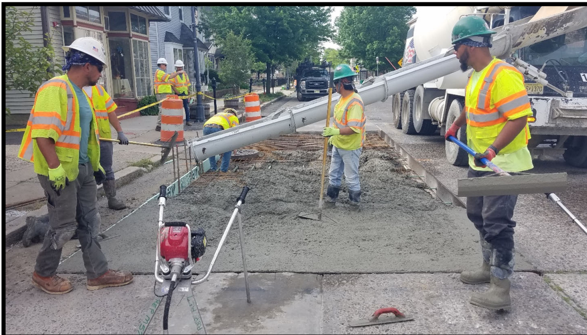
Photograph 7 – Concrete being poured at replacement slab location.