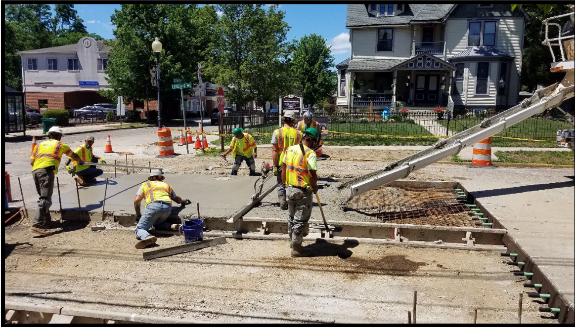
Photograph 8 – Class V concrete being installed for slab replacement on Chestnut Avenue.