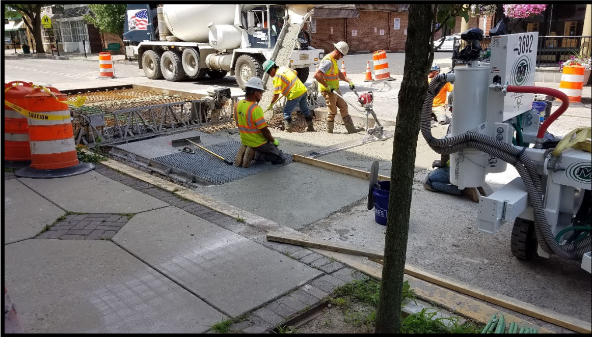
Photograph 2 – Class V concrete being installed for slab replacement on Centre Street near Chestnut Avenue.