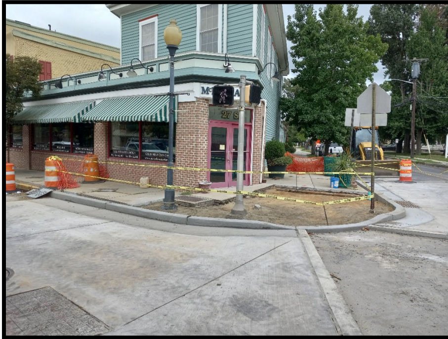
Photograph 8 – Compacted Base Course at the Centre Street and Park Avenue intersection has been completed in preparation of the concrete sidewalk pour.