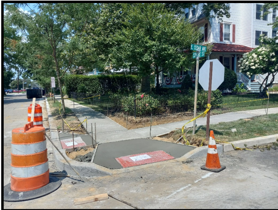
Photograph 7 – Handicap accessible ramps being installed at the Cedar Avenue intersection.