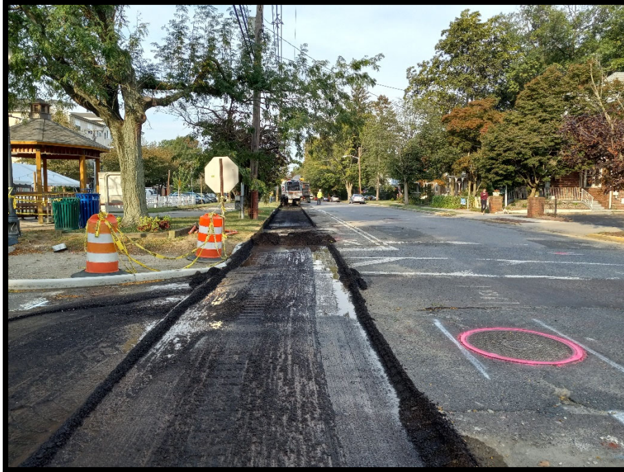
Photograph 4 – Milling of West Chestnut Avenue in preparation for the new Hot Mix Asphalt roadway.