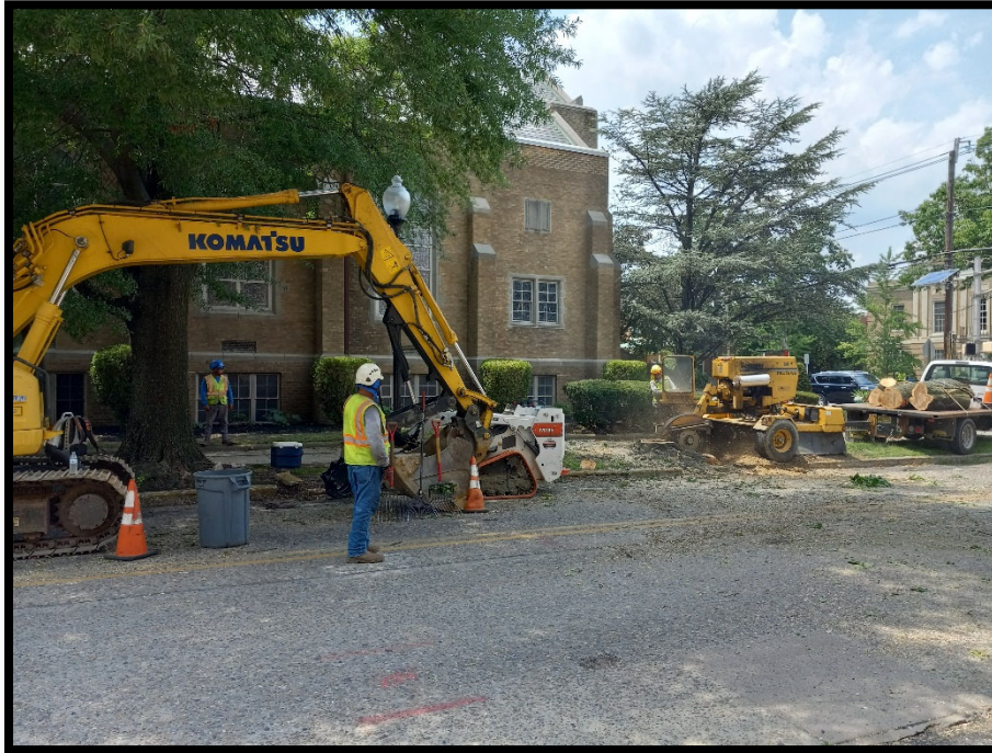
Photograph 4 – Tree removal and stump grinding progressing in accordance with the construction plans.