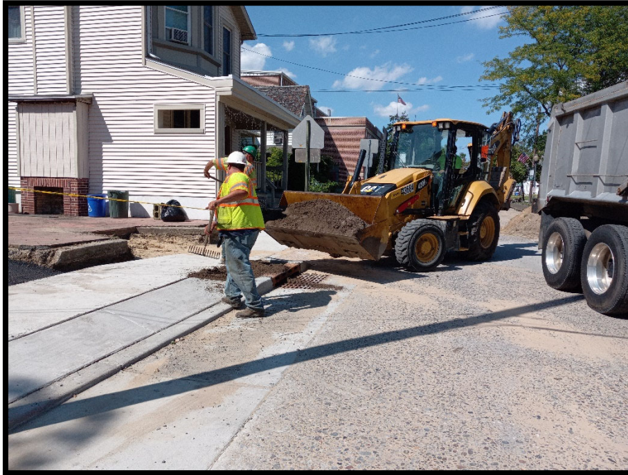
Photograph 8 – Ongoing topsoil restorations at areas disturbed by the new concrete work between Maple Avenue and Locust Street.