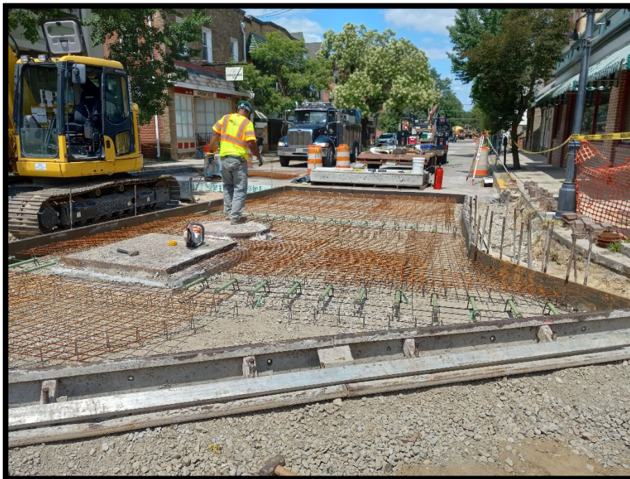
Photograph 1 – Preparing for slab replacement concrete pour at the Centre Street and Park Avenue intersection.