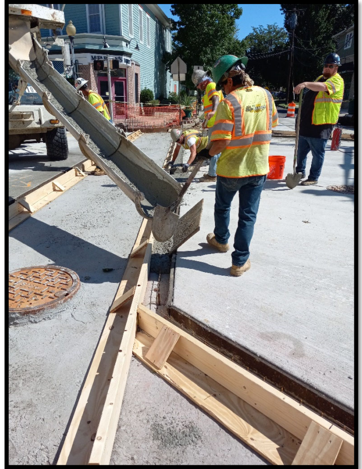
Photograph 7 – Concrete restraint curb being placed for the brick crosswalk at the Park Avenue intersection.