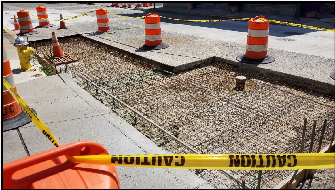
Photograph 5 – Roadway adjacent to NJDOT Type A inlet #203 being prepared for concrete slab replacement.