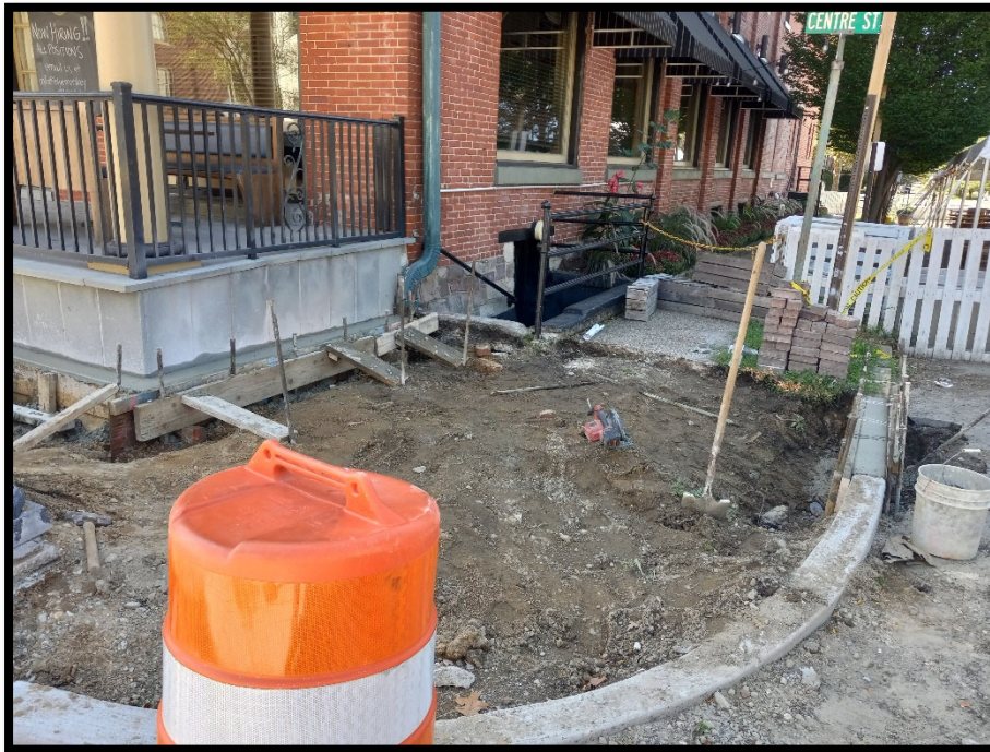
Photograph 1 – Header curb being installed along the Blue Monkey Tavern porch in preparation of the sidewalk pour to accommodate the new ADA accessible handicap ramp at Chestnut Avenue.