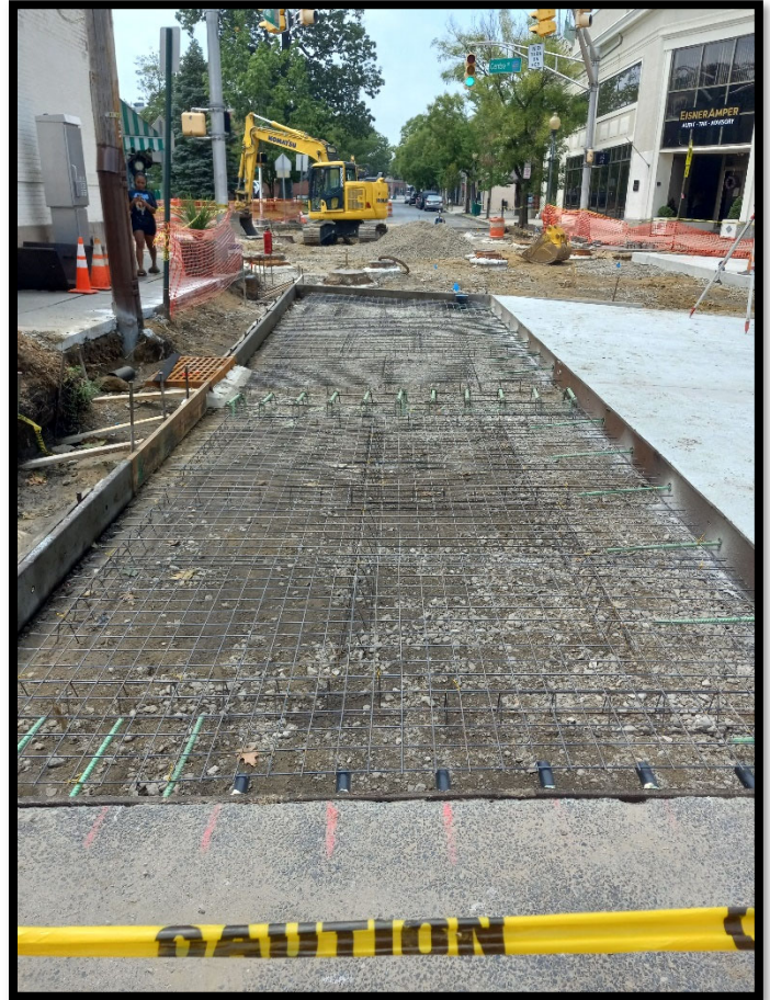
Photograph 3 – Preparing for another Class V concrete pour at the Centre Street and Park Avenue intersection.