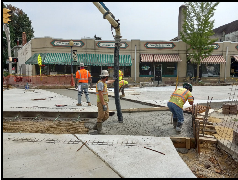
Photograph 4 – Concrete pump being used to install Class V concrete for the subbase of the brick crosswalk at the Park Avenue intersection.