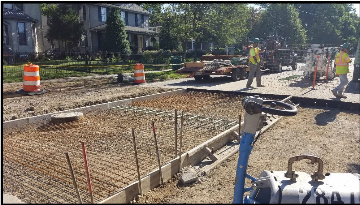
Photograph 7 – Dowels, expansion material and welded wire fabric being installed in preparation of concrete slab replacement on Chestnut Avenue.