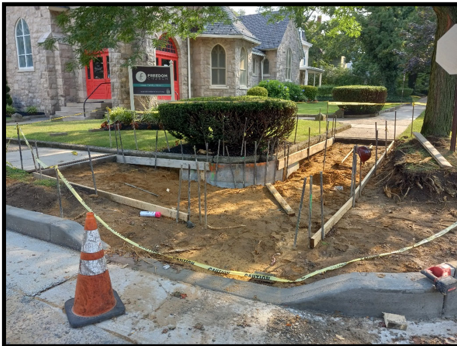
Photograph 5 – Preparing for concrete pour of handicap ramps and header curb at the Walnut Avenue intersection.