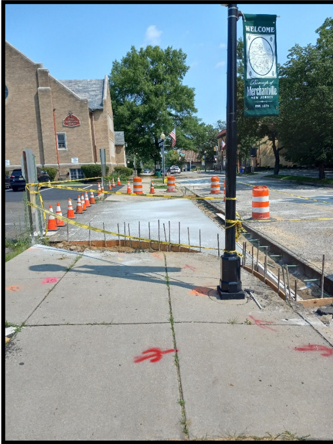
Photograph 6 – Class V concrete installed for driveway apron at church parking lot.