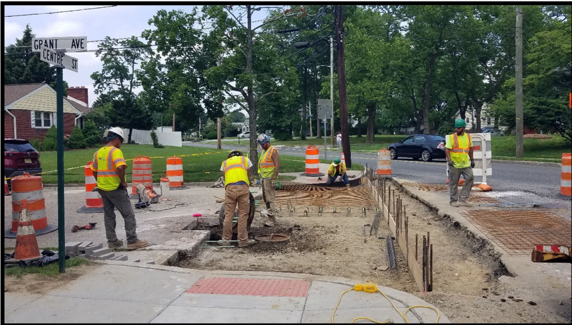
Photograph 3 – Preparing for concrete slab replacement at the Grant Avenue and Centre Street intersection.