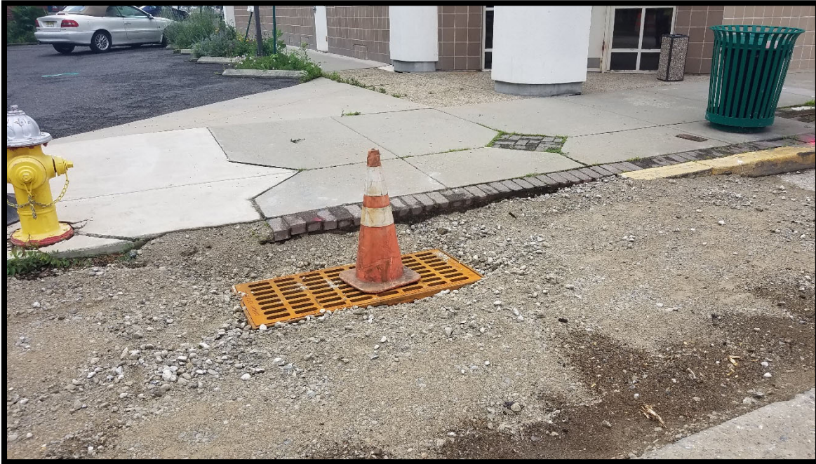
Photograph 4 – Roadway adjacent to NJDOT Type A inlet #203 temporarily restored with Dense Graded Aggregate until concrete slab is replaced.