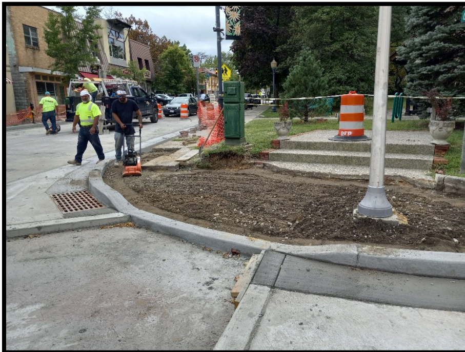
Photograph 7 – Installation and compaction of Dense Graded Aggregate Base Course in preparation of the concrete sidewalk pour at the Centre Street and Park Avenue intersection.