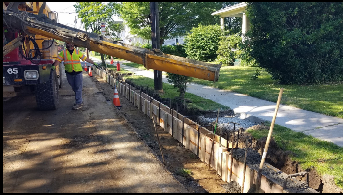
Photograph 4 – Forms in place and concrete being poured for new curb.