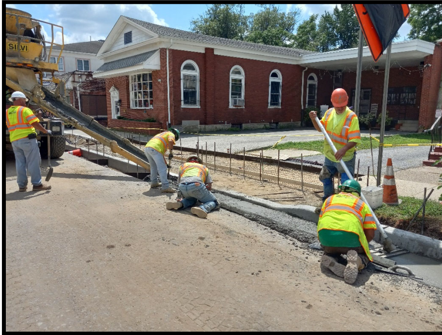
Photograph 4 – Concrete gutter being installed on Centre Street between Walnut and Chestnut Avenues.