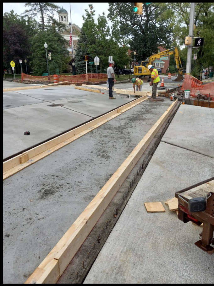
Photograph 6 – Setting concrete restraint curb forms for the brick crosswalk at the Park Avenue intersection.