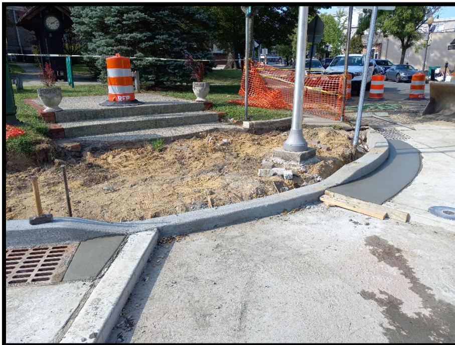
Photograph 5 – New concrete curb and gutter installed at the Centre Street and Park Avenue intersection. Note the depression for the proposed brick crosswalk.