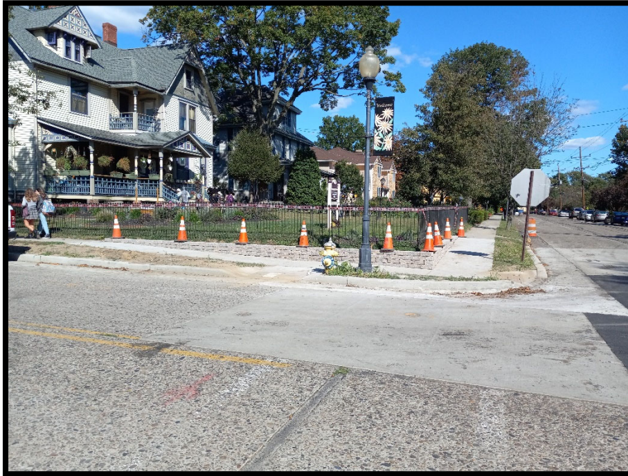
Photograph 8 – EP Henry retaining wall installed to accommodate the grade change for the new handicap ramp along Centre Street.