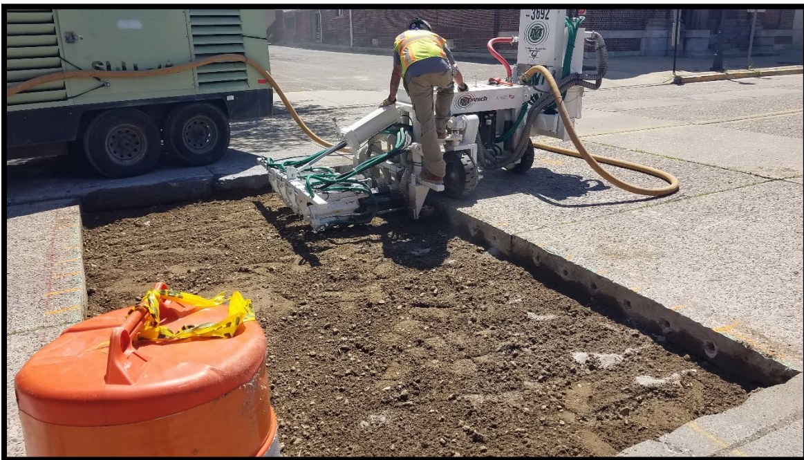
Photograph 5 – Dowel drilling in progress in preparation of slab replacement.