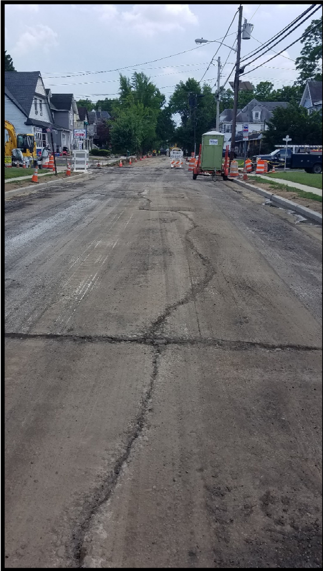
Photograph 6 – Concrete subbase after milling of asphalt overlay. Note absence of longitudinal expansion joint at centerline of roadway and longitudinal cracking of the subbase.