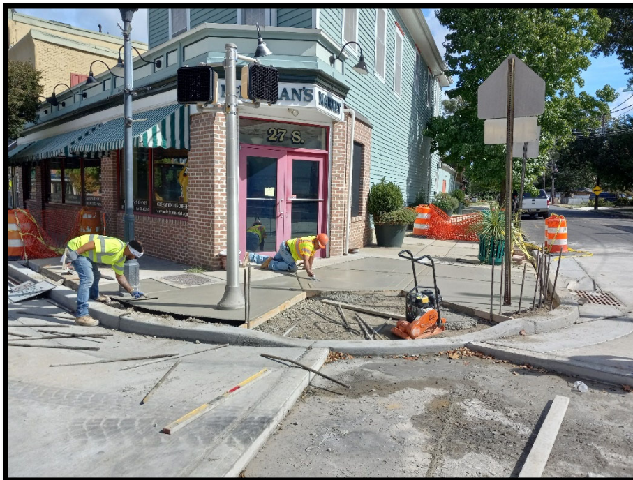
Photograph 5 - Concrete sidewalk pour at the Centre Street and Park Avenue intersection.