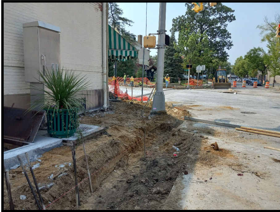
Photograph 4 – Existing sidewalk, curb and gutter removed from Park Avenue near the Centre Street intersection.