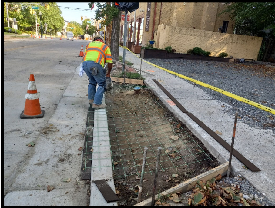
Photograph 2 – Preparing for concrete driveway apron pour along Centre Street between Maple Avenue and Locust Street.