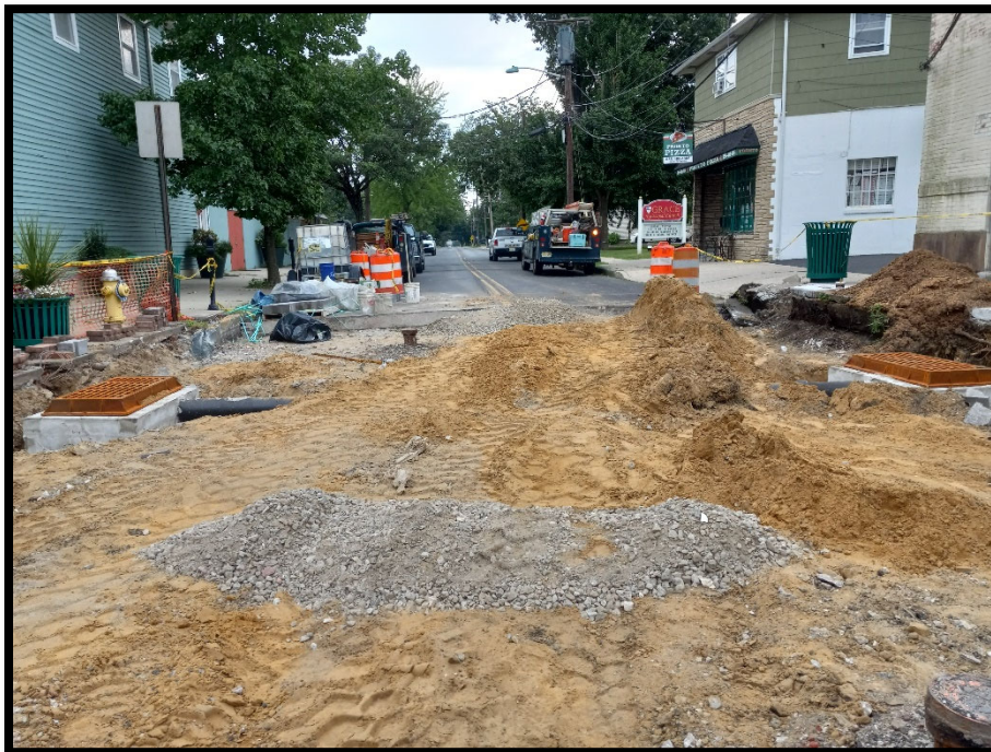
Photograph 5 – Inlets And Ductile Iron Storm Pipe installed on Park Avenue.