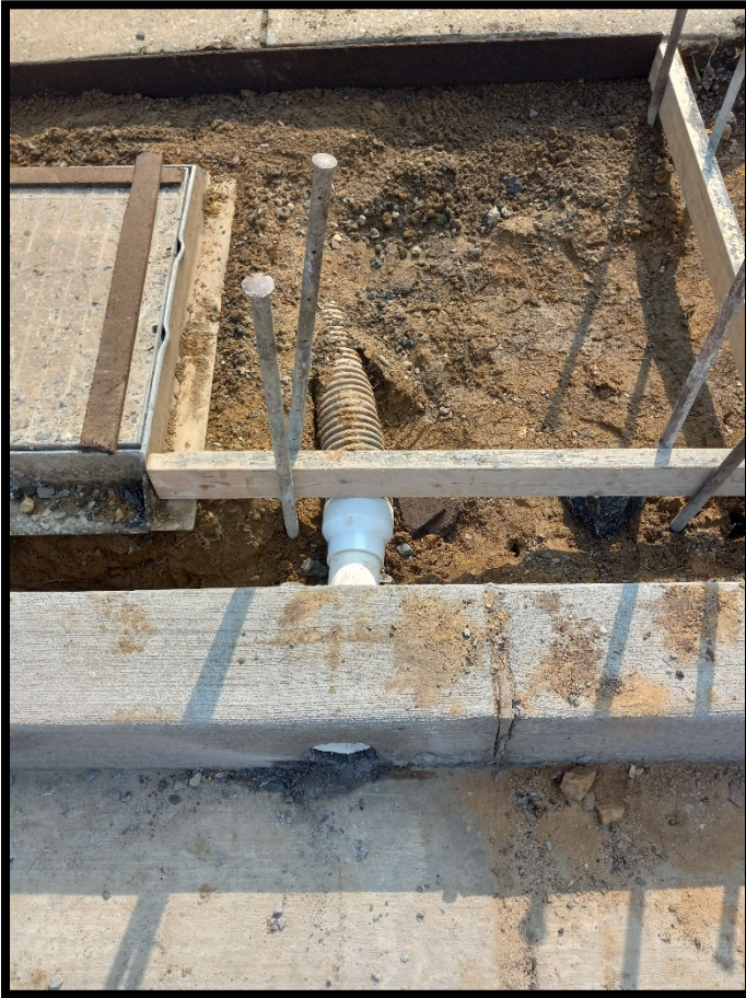
Photograph 2 – Roof drain connection being completed before sidewalk concrete pour.