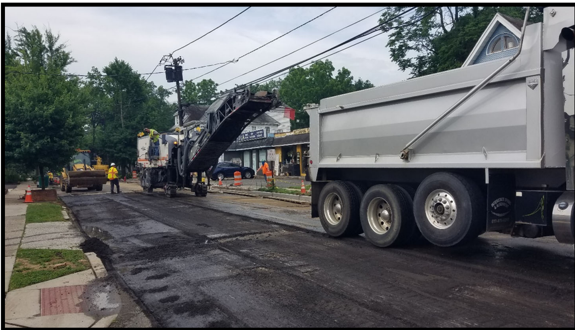
Photograph 5 – Milling of asphalt overlay from the Merchantville/Pennsauken border to Cove Road.