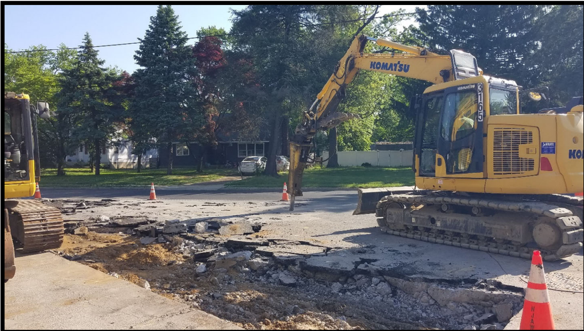
Photograph 7 – Demolition of existing roadway for new island at the Cove Road intersection.