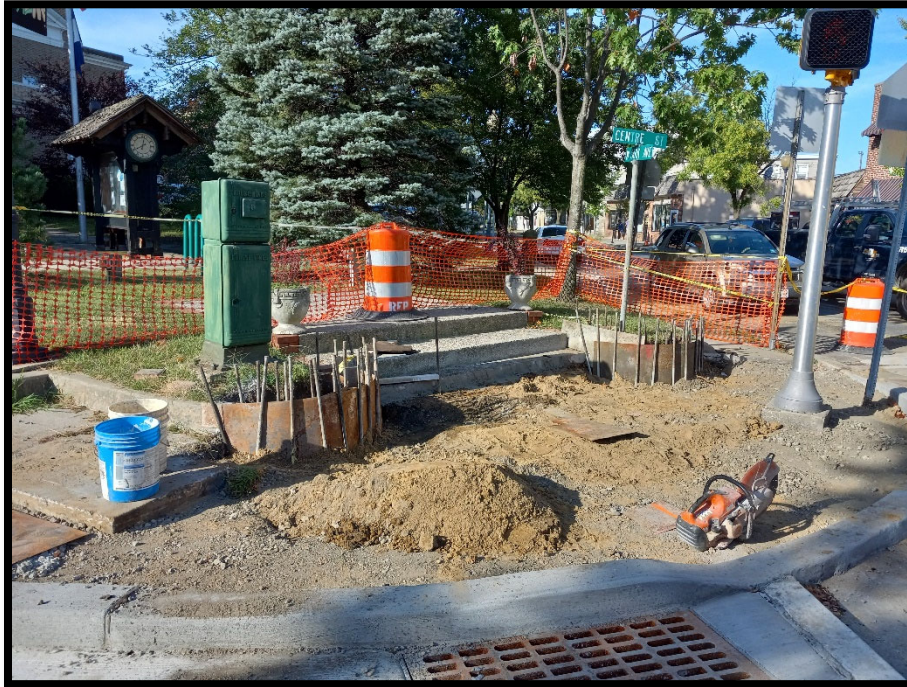
Photograph 6 – Forms set for the concrete curb returns at the Municipal Building stairway.