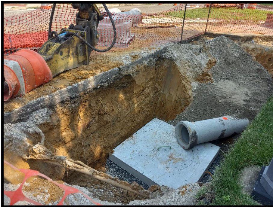
Photograph 5 – Base for Manhole #002 and RCP connecting to Inlet #001 being installed.