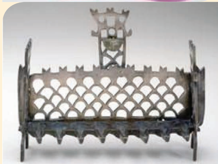
Top: Karim Rashid, American, born in Egypt, 1960, Menorahmorph , 2004, New York. Below: Hanukkah lamp with tower, 19th or 20th century, coastal North Africa.

Two menorahs from the collection were used at the White House at the Chanukah parties of Presidents George W. Bush and Barack Obama. In 2001, President Bush was the first American president to light a menorah at the White House. He chose one made of silver, cast and engraved in Lemberg, Germany, in around 1867, with lions at its base and eagles at its top.