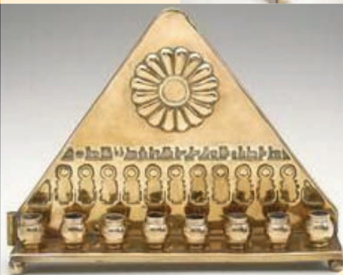
Bottom row, left to right: Hanukkah lamp with palmette, probably 19th century, probably Ottoman Empire.