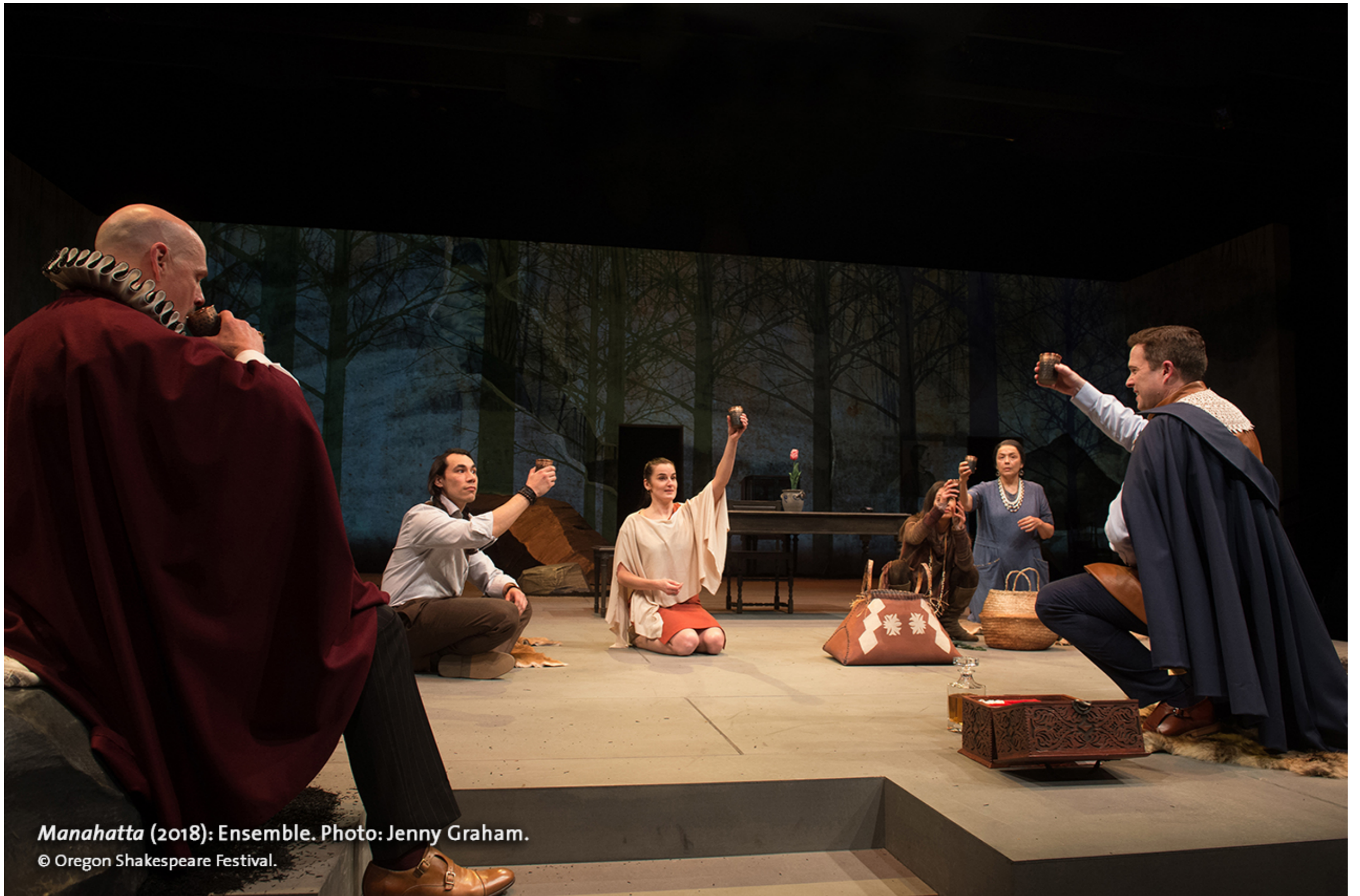
Manhatta (2018): Ensemble.