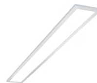
Metalux RBG Recessed Linear