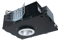
Portfolio LDA Series 2", 3", 4" and 6" Adjustable Downlights