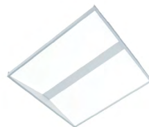
Metalux Encounter Recessed Ambient