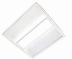
Metalux RLN Recessed Ambient