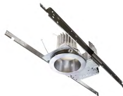
HALO Commercial HC Series 4", 6" and 8" Downlights