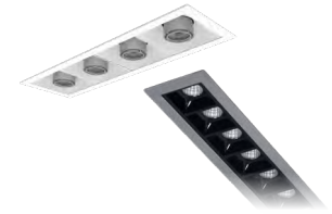
Portfolio LAM / LDM Series - Multiples 1" (1 cell to 15 cells) Downlight or Adjustable 4" (1 head to 4 heads)