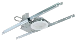
HALO Commercial PR Series 4", 6" and 8" SeleCCTable Downlights