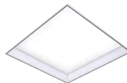
Corelite InDepth Architectural Recessed