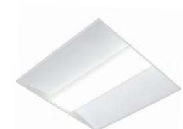
Fail-Safe FCZ Sealed Recessed Ambient

Whether designing a school, commercial office, or healthcare facility, you can create the perfect lighting environment using our WaveLinx-enabled luminaires. Reach out to your customers today and introduce them to the exciting new WaveLinx PRO node solution.