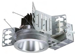
Portfolio LD Series 2", 4", 6" and 8" Downlights

For a complete list of compatible products, see: www.cooperlighting.com