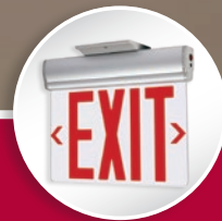
AtLite p. 62-63