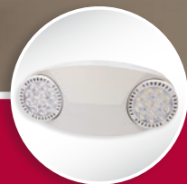
Sure-Lites p. 57-59