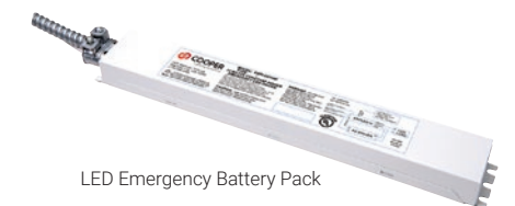
LED Emergency Battery Pack