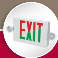
All-Pro p. 60-61