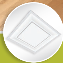
Corelite p. 51