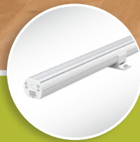
iO p. 51