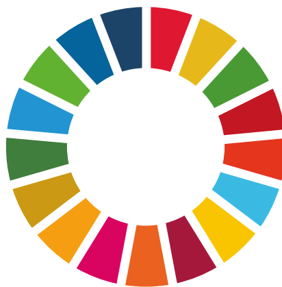
DEME supports the Sustainable Development Goals

We refer to our yearly Sustainability Report for further info.