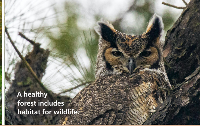
A healthy forest includes habitat for wildlife.