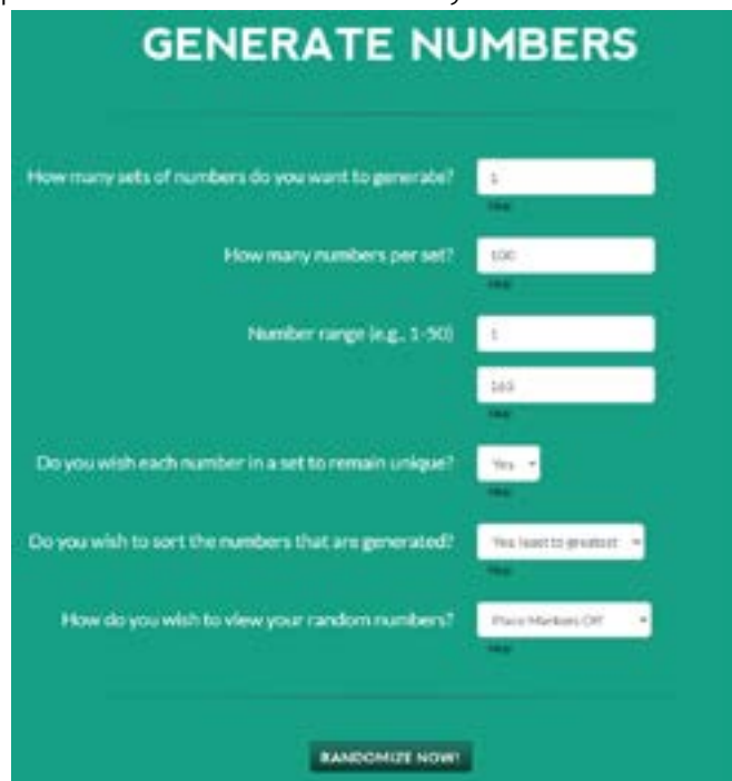
Figure 1: Example of 100 - records randomly selected from enrollment of 165