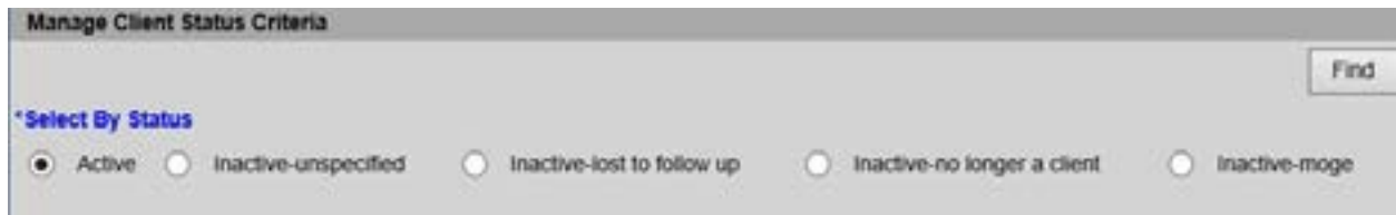
Figure 4 - Select by Status

Description of this filter - The status options below allow you to select clients that have one of the following statuses for your organization: