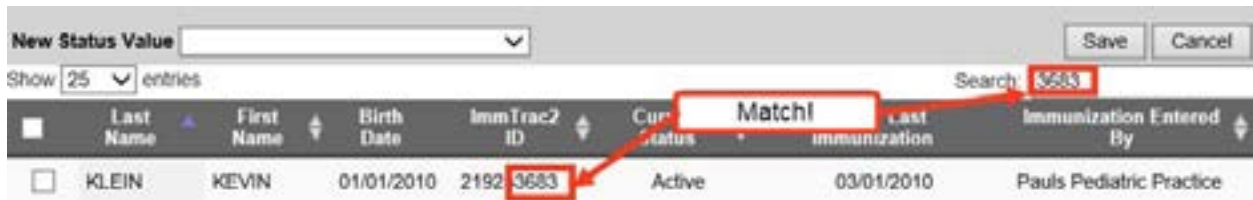
Figure 9 – Real-Time Search Filter Match.

The optional real-time search filter is used in conjunction with the Display/Change table listed below it. This filter acts differently than the other filters in that you don't have to select the "Find" button in the upper right corner of the screen to make a change in clients displayed. Instead, any characters (numbers or letters) that you enter in the search field are used to search through each and every field in the display table to find a match. If a match is found on any row in the table, then the client on that row is included in the display table; otherwise the client is no longer displayed. See Figure 9 – Real-Time Search Filter Match.