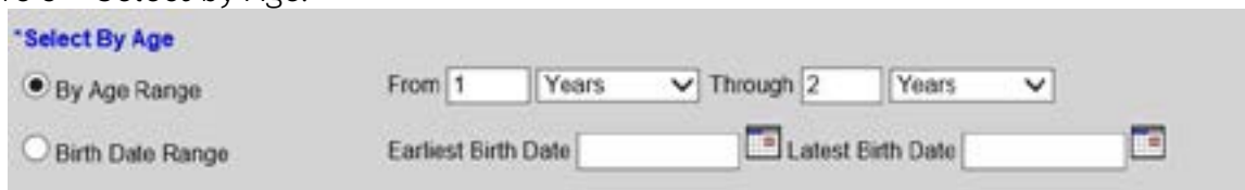
Figure 5 - Select by Age