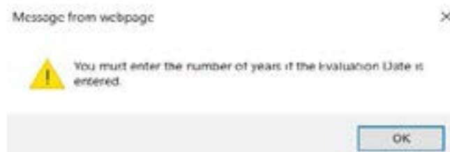
Figure 7 – Error Message for Evaluation Date but No Years