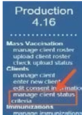
Figure 1 - Link to Manage Client Status Criteria

To use the Manage Client Status feature, select the “manage client status criteria” link in the menu bar on the left side of the screen (see Figure 1 – Link to Manage Client Status Criteria).