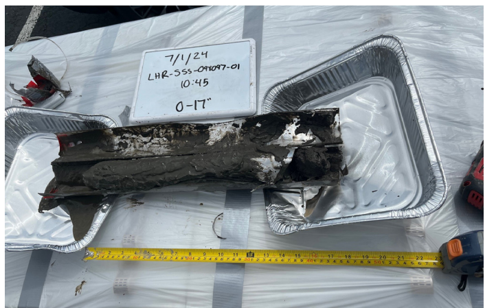
(Top and Bottom) Sediment Sampling