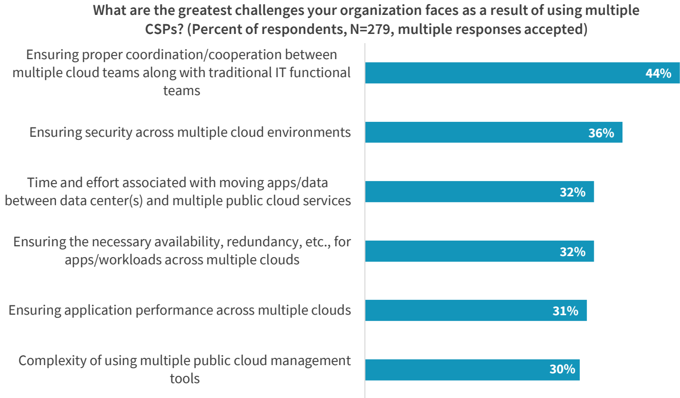
Figure 2. Top Six Challenges Using Multiple Public Clouds