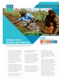
Gender, Food Security and Nutrition (2011)