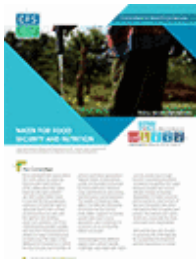
Water for Food Security and Nutrition (2015)