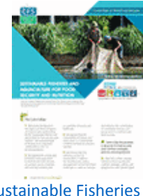
Sustainable Fisheries and Aquaculture for Food Security and Nutrition (2014)