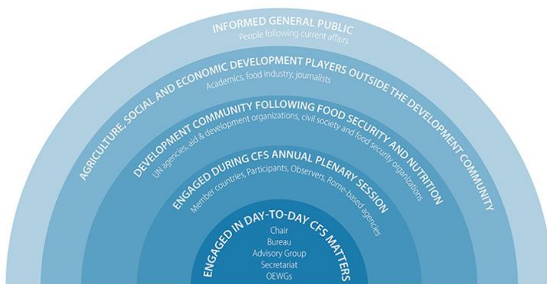
Table 1: CFS Target Audiences

As noted above and in the Evaluation Implementation Report, CFS should follow the principle that communication about CFS is the responsibility of all CFS Members and other stakeholders. Likewise the Evaluation Implementation Report included actions that could be taken by Members including participating in outreach. The Rome-based Agencies (RBAs), with their global networks, also play a key role in outreach as well as the other members of the Advisory Group. All CFS stakeholders are encouraged to reach out to their constituencies, networks and regions to raise awareness of CFS and its policy guidance and recommendations, and to hear feedback from them on their use. In this way the responsibility of communicating and profiling CFS especially at the regional and national levels is shared. The role of the CFS Secretariat is to support the communication efforts of all CFS stakeholders, subject to available resources.