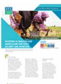
Investing in Smallholder Agriculture for Food Security and Nutrition (2013)