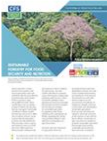
Sustainable forestry for food security and nutrition (2017)