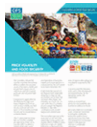
Price Volatility and Food Security (2011)