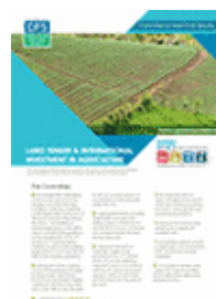
Land tenure and international investments in agriculture (2011)