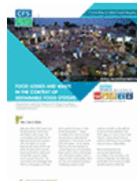
Food Losses and Waste in the Context of Sustainable Food Systems (2014)