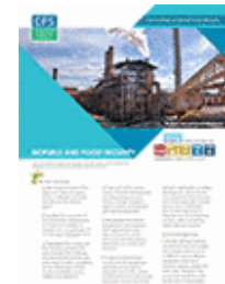
Biofuels and Food Security (2013)