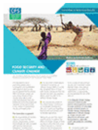
Food Security and Climate Change (2012)