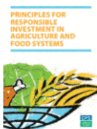
Principles for Responsible Investment in Agriculture and Food Systems (CFS-RAI) (2014)