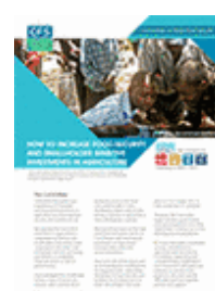
How to Increase Food Security and Smallholder Sensitive Investments in Agriculture (2011)