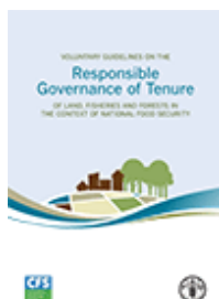
Voluntary Guidelines on the Responsible Governance of Tenure of Land, Fisheries and Forests in the Context of National Food Security (VGGT) (2012)