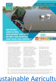
Sustainable Agricultural Development for Food Security and Nutrition: What Roles for Livestock? (2016)