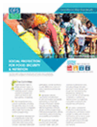
Social Protection for Food Security and Nutrition (2012)