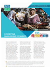
Connecting Smallholders to Markets (2016)