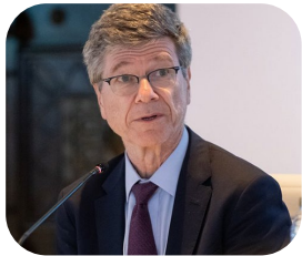
Prof Jeffrey D. Sachs, Columbia University