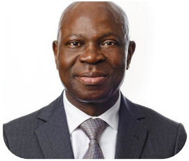
Mr Gilbert Houngbo, IFAD President