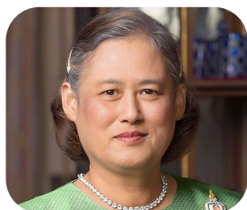
H.R.H. Princess Maha Chakri Sirindhorn of Thailand