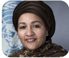
Ms Amina Mohammed, UN Deputy Secretary-General