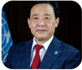
Dr QU Dongyu, FAO Director-General