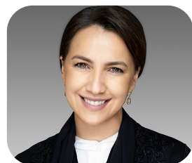
H.E. Mariam Al Mehairi, Minister for Climate Change & Environment, UAE