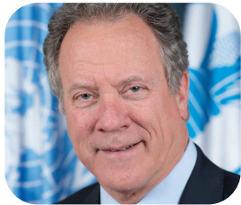
Mr David Beasley, WFP Executive Director