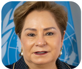
Patricia Espinosa, Executive Secretary, UNFCCC