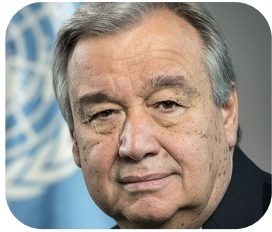
Mr António Guterres, United Nations Secretary-General