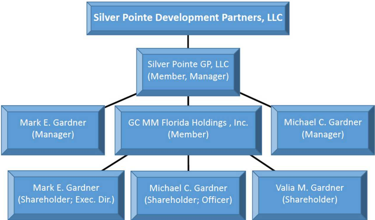
EXHIBIT B - Current Developer Principal Structure