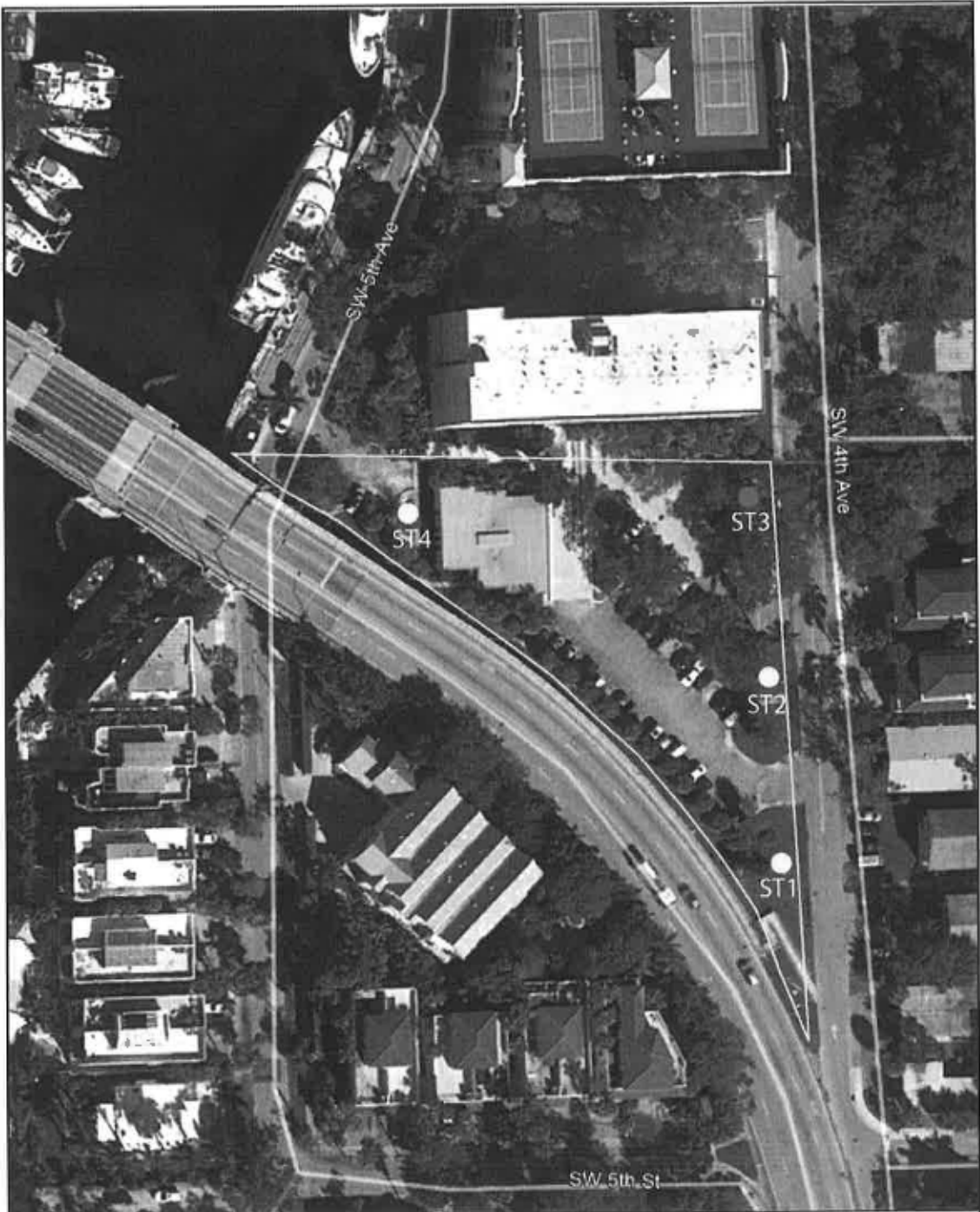
2017 color aerial orthophotograph of the Sailboat Bend South parcel showing shovel test locations.