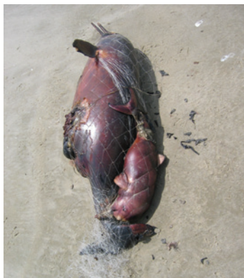
Fig. 5. Female and calf Franciscanas caught up in fishing nets in Rio Grande, RS.