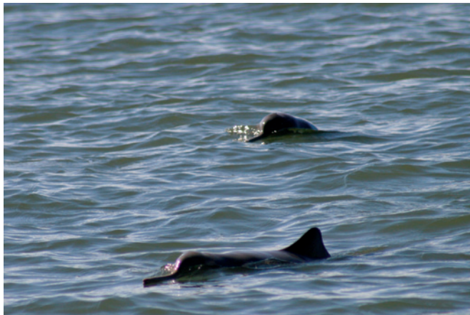
Franciscanas, Pontoporia blainvillei, photographed in the Babitonga Bay, SC FMA II (Franciscana Management Area II).