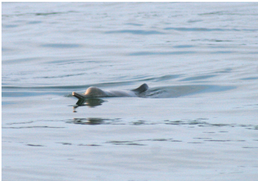
Fig.2. Franciscana photographed in the Bay of Babitonga, SC – FMA II.

GENUS AND SPECIES: Pontoporia blainvillei