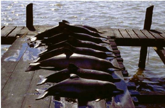
Fig. 4. Franciscanas accidentally captured in fishing nets in Rio Grande, in the South of do Rio Grande do Sul.

The main threat to the conservation of the Franciscana is death due to accidental capture in fishing nets, especially seine nets. Swallowing plastic objects has also been a cause of general concern since analysis of the stomach contents of the Franciscana has shown that the species is also vulnerable through swallowing various types of detritus including pieces of net and fishing line. Added to these factors is the reduction of fish stocks, which causes seasonal variations in the diet of the species, as does the ingestion of residues related to chemical pollution.