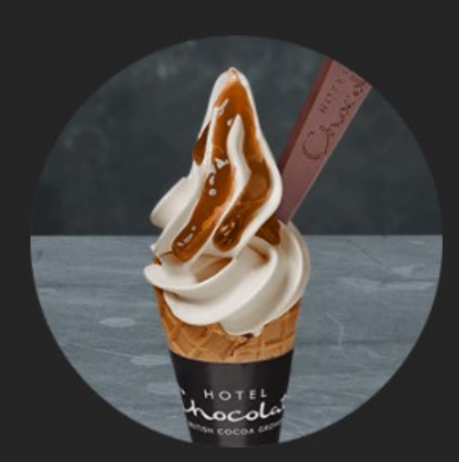
Ice Cream Cone

Ice Cream of the Gods, rich and creamy, made with milk from Jersey cows, infused with cacao nibs for 48 hours.