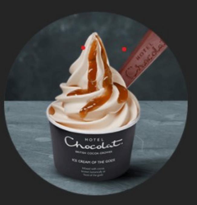
Ice Cream Tub