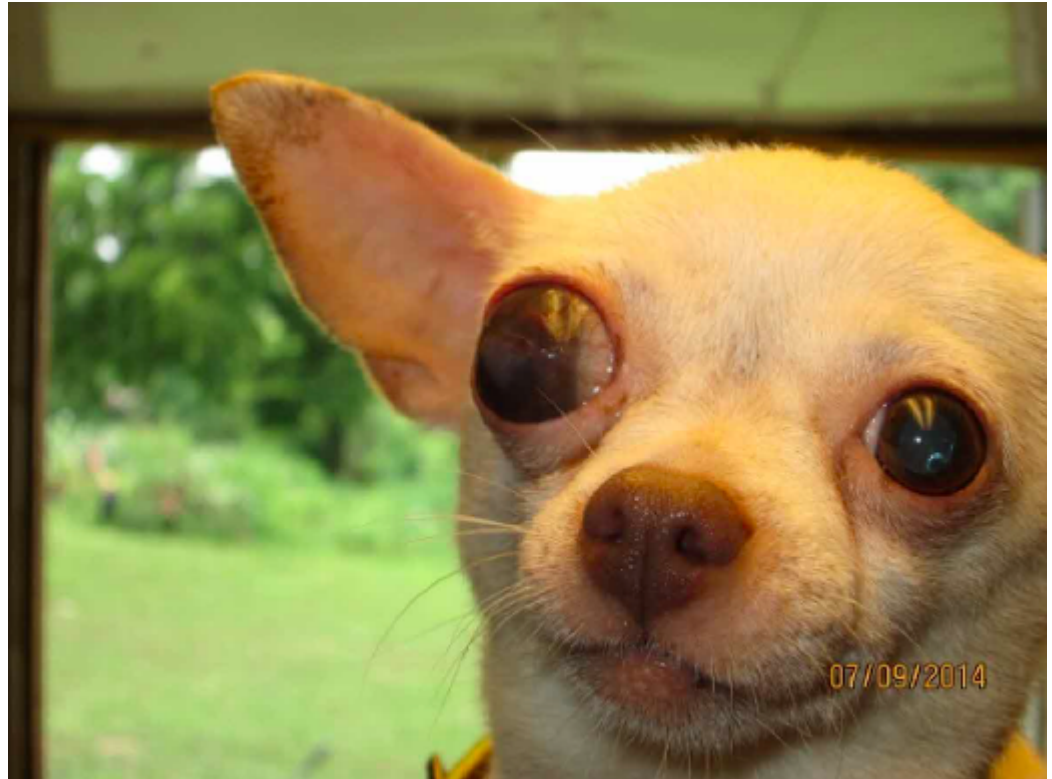
A Chihuahua was found with a grotesquely enlarged eye at the facility of Earl Light, Newburg, MO.

the licensee instead obtained euthanasia drugs