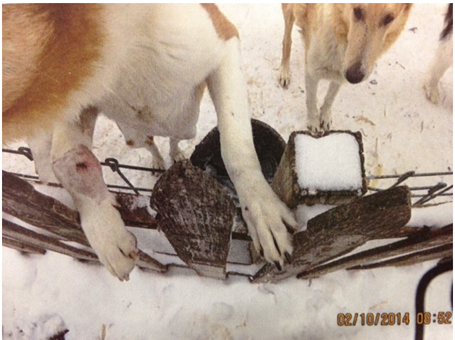
State inspectors found underweight dogs and a dog with an injured leg outside in the snow at the facility of Alisa Pesek, an AKC Breeder of Merit.

March 2014 and again in November 2014, Alisa Pesek, an AKC “Breeder of Merit,” and her co-licensee, Mitch Pesek, received official warnings from the state of Nebraska for severe animal care issues. The November warning alone outlined five different issues, including failure to provide “enough nutritious food to maintain body weight,” failure to have enough employees to properly care for dogs and failure to maintain a current veterinary plan. According to the warning, “at least 15% of the adult dogs were reported to be very thin and underweight,” and “dogs were reported to have serious and severe levels of