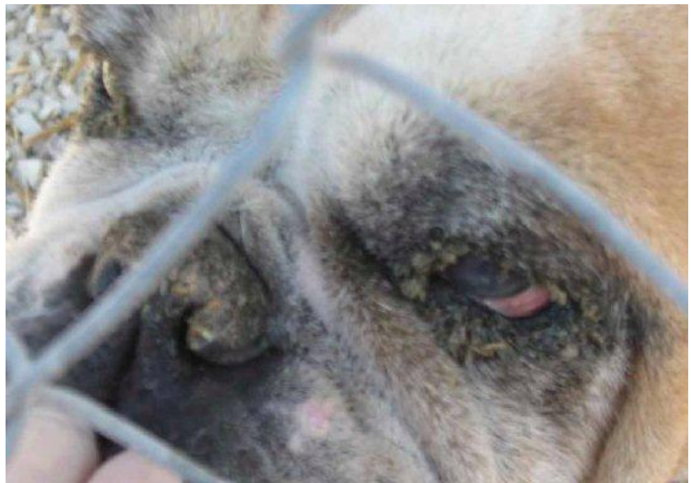
Sick and injured dogs have been found year after year at Jinson Kennel in Stella, MO.

from the vulva. His diagnosis was pyometra and he