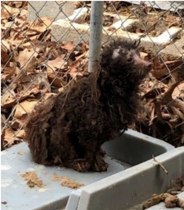
A poodle at Carol's Kennel in Urbana, Missouri, was matted and appeared to have patches of hair loss. Only the matted fur was mentioned in the inspection report.