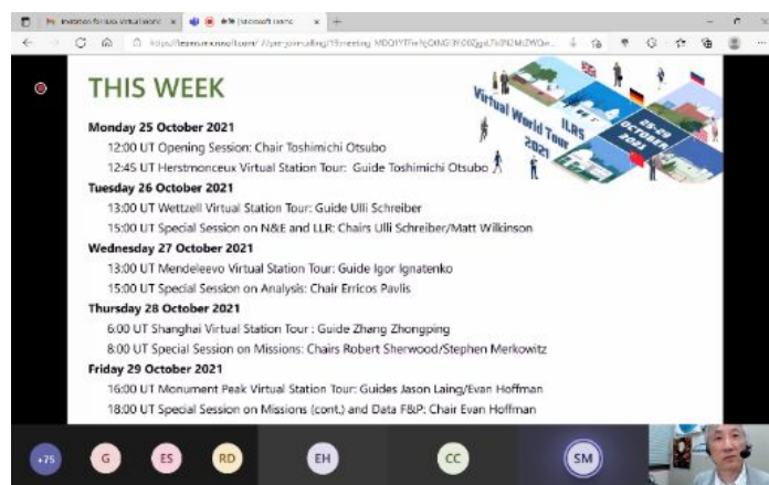
Screenshot 1: The plan of the week.