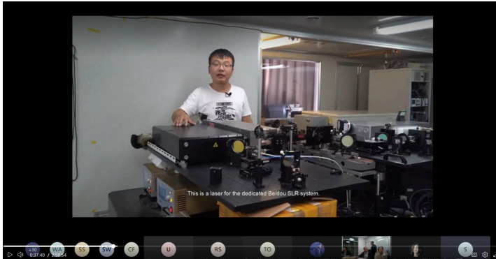
Screenshot 4: Tour of Shanghai. Visiting the Laser room.