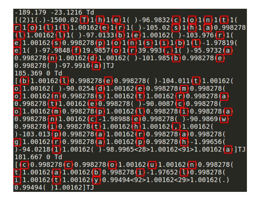
Fig. 2. Sniffing a PDF file (containing the GDPR) as printed from Linux

and penetration testing session over a range of twenty commercial printers, comparing and contrasting a number of attacks on each of them. Their work is the first to note that raw 9100 port printing may be risky.