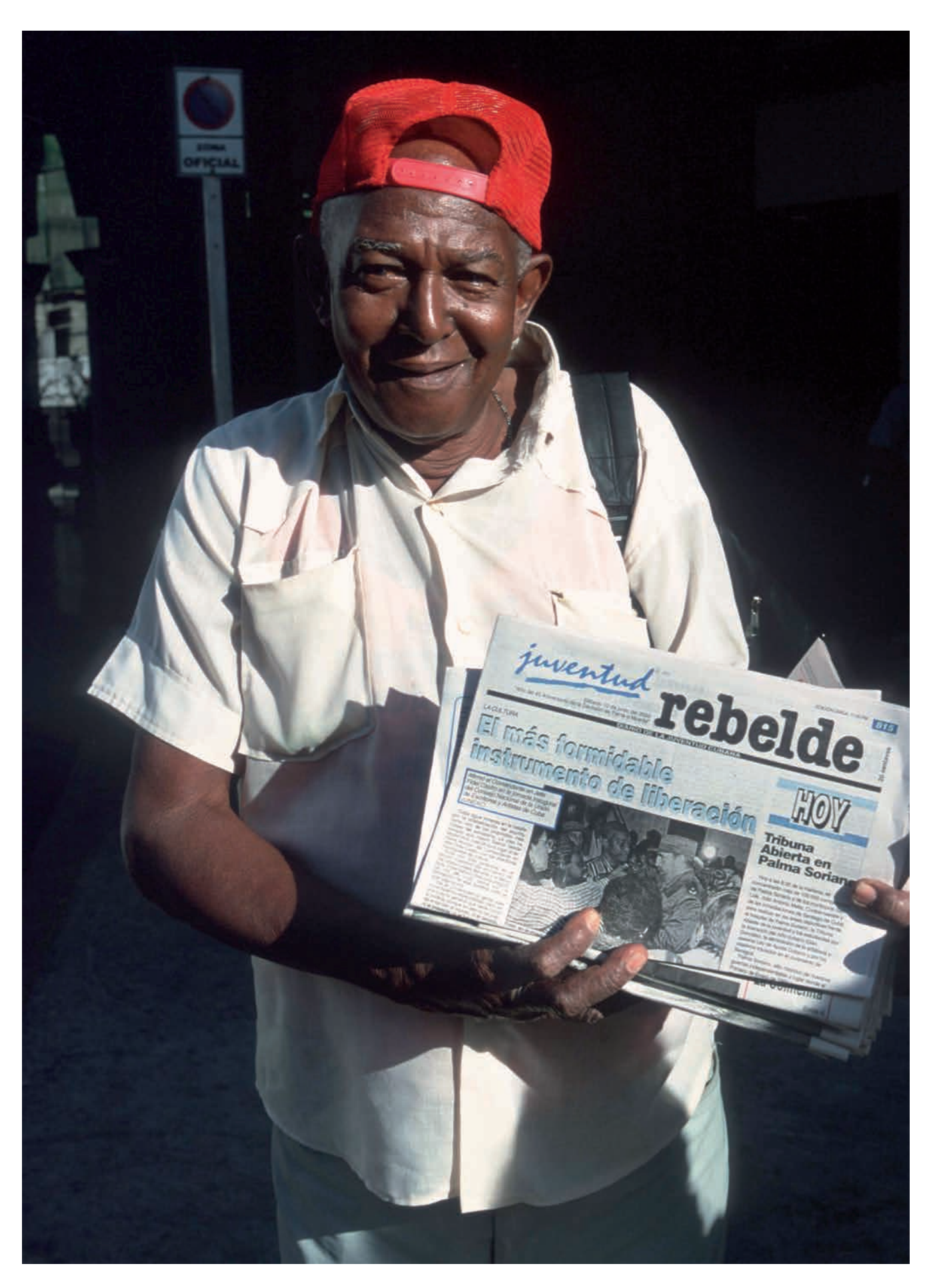
Newspaper seller, Havana, Cuba.