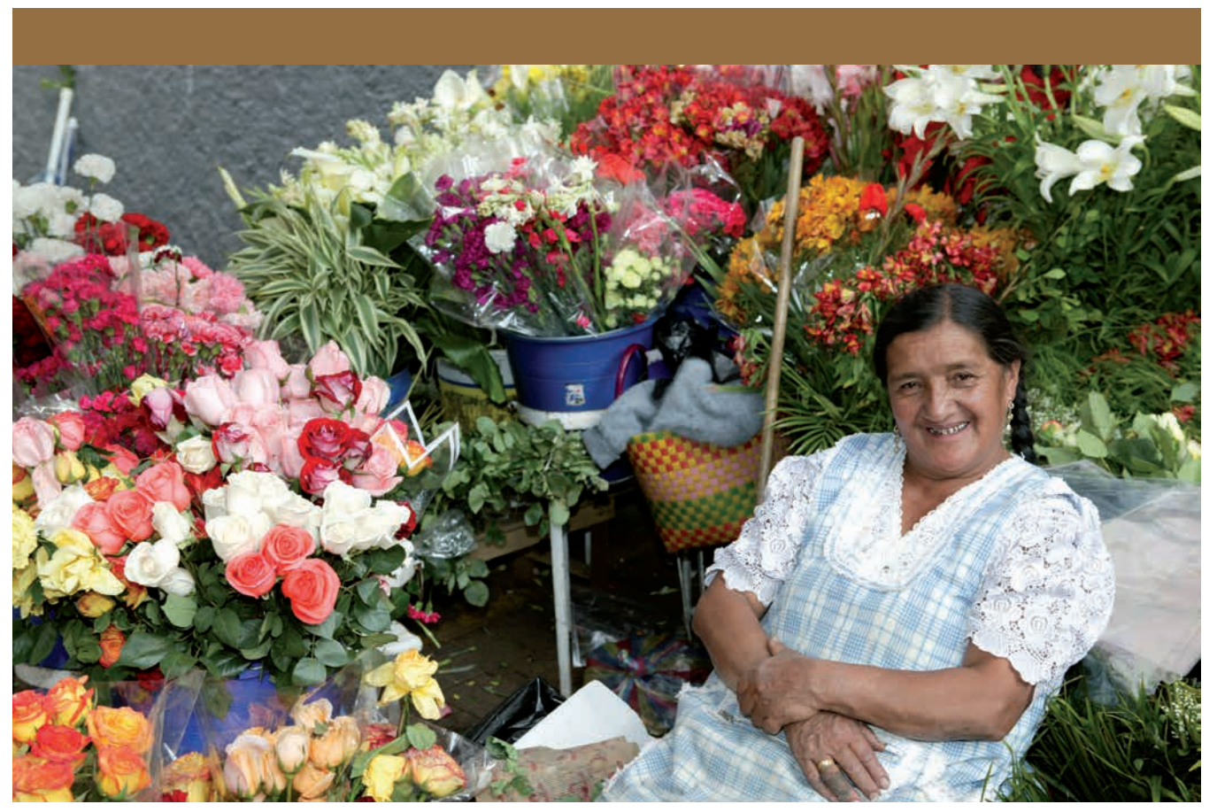
Flower vendor in the street. Ecuador.