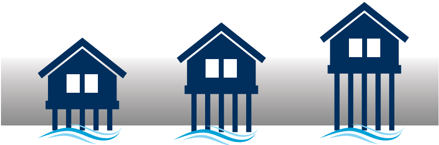
2050 Storm Surge Derived Average Annual Damage

This study clearly shows that even present-day building codes reduce future AAD. Additionally, there may be opportunities for new builds to consider enhanced adaptation measures that account for increasing storm surge risks. In this case, superseding present-day building BFE requirements results in a significant reduction in storm surge AAD by the mid-century to just 20% of a property built to the current BFE elevation. This type of analysis enables homeowners and planners to directly weigh the value of advanced adaptation measures in terms of the reductions in expected future damage estimates that could be incurred towards the end of a 30-year mortgage term.