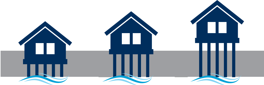
Present Day Storm Surge Derived Average Annual Damage