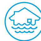
Rising Sea Levels