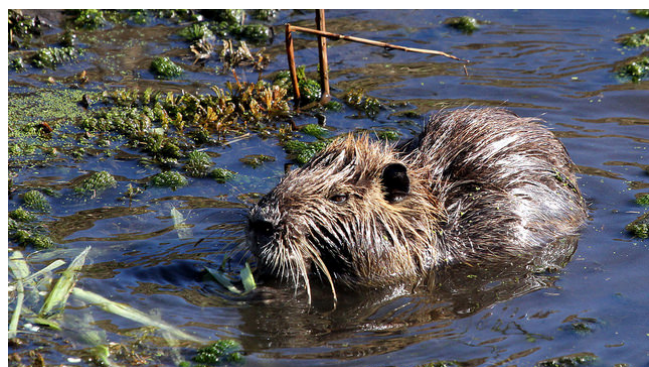
By converting marshland into open water, the invasive Coypu ( Myocastor coypus ) can undermine the ability of coastal wetlands to control floods. The effective control and eradication of the species therefore increases the resilience of wetlands to climate change.

Biological invasions are among the top drivers of biodiversity loss and species extinctions across the world. A 2016 study published in the journal Biological Letters , showed that IAS are the second most common threat associated with species that have gone completely extinct since 1500.