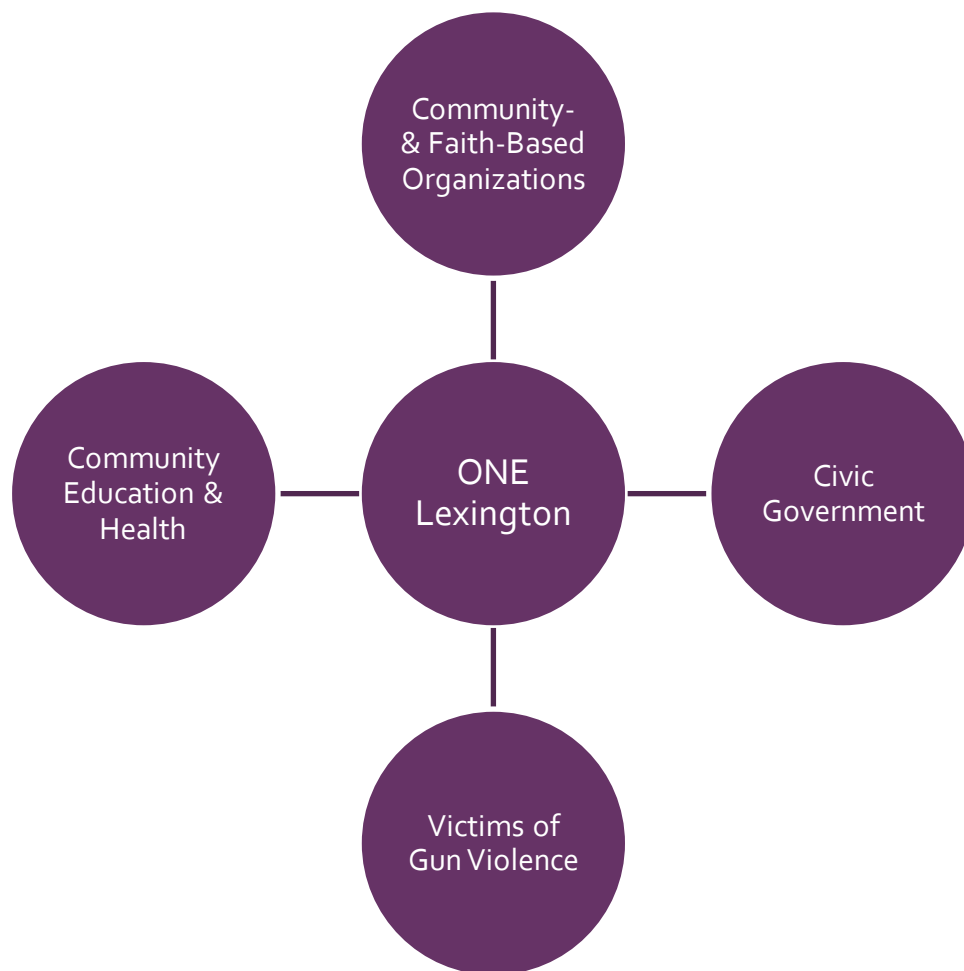
ONE Lexington's Collaborative Partners

To effectively address youth and young adult gun violence within Lexington, ONE Lexington leadership, in collaboration with the Community Innovation Lab at the University of Kentucky, Cities United and community partners, established a four-year strategic plan. While ONE Lexington provides city-wide leadership to reduce youth and young adult gun violence, its leadership fully understands that to effectively reduce gun violence in Lexington there needs to be strong collaboration among community partners.