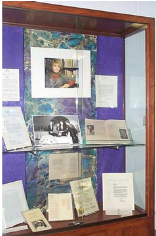
Part of the Lee Smith exhibit at the D. H. Hill Library.

O n October 19, 2000, the NCSU Libraries celebrated the career and writings of Lee Smith, award-winning North Carolina author and retired NC State professor, at a special reception and exhibit opening held in her honor. The exhibit, mounted by the library's Special Collections Department and entitled "A Diamond from Coal Country: The Career of Lee Smith," features many items from Lee's personal and professional papers, including unpublished short stories. Items on display include the yellow, legal-sized sheets of Lee's first story, handwritten as a young girl in 1956. The story, featuring Adlai Stevenson and Jane Russell, has the main characters heading west in a covered wagon to become Mormons. The exhibit is open to the public until January 31, 2001. An online version featuring selected highlights from the exhibit can be found at http://www.lib.ncsu.edu/archives/exhibits/leesmith/ .