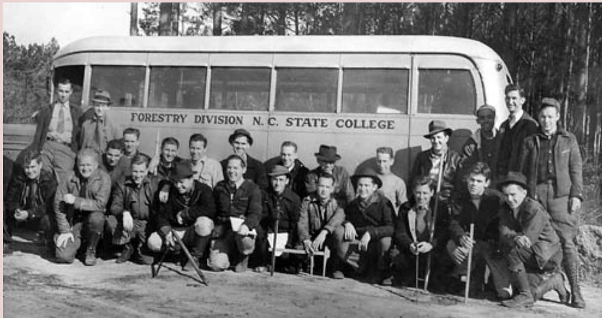
Classes of the Forest School at North Carolina State College often spent the spring term of their junior year at the Hofmann Forest. In this photograph, the class of 1941 poses in front of its bus.

The project, by providing access to resources from four significant collections and to interpretative Web pages, will increase research opportunities in exploring forest history. The resources provided through this collaboration will expand the visual and textual information available on the Web on southeastern forests, forest management, and forestry education. These materials are currently used primarily by researchers who either travel to North Carolina to view them firsthand or by researchers outside the state who ask archivists at the four institutions for help in examining the materials. The institution then usually sends photocopies of small portions of