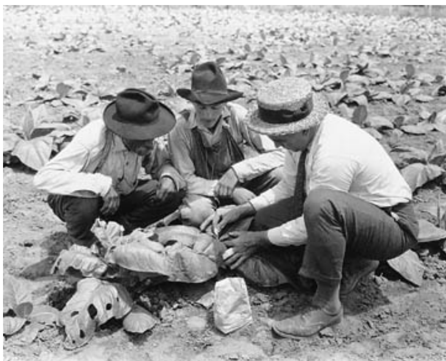
An agricultural extension agent and two tobacco farmers inspect a tobacco crop circa 1940.

as covering "agricultural economics and rural sociology, agricultural engineering, soil science, food science and human nutrition, animal science, forestry, crop improvement and protection, and human ecology." Microfilming southern agriculture literature from North Carolina will provide an excellent source for research into American cultural values and environmental conditions during a time when living and working in farming communities remained a dominant American experience. Currently, seventeen states—including New York, Alabama, Pennsylvania, Texas, and Iowa—and the National Agricultural Library are working with Cornell University, USAIN, and the NEH in this important preservation program. Eventually, program coordinators hope to involve all fifty states in the project. ❖