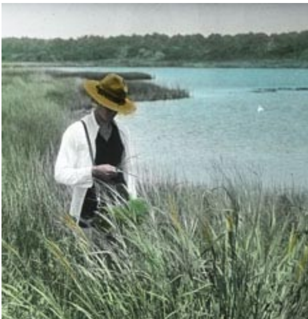
Panicum virgatum L. var. virgatum Switchgrass. Common Name: Tall panic grass.