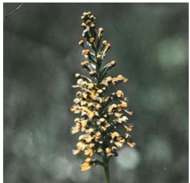
[Bottom right] Platanthera ciliaris (L.) Lindl. Wells Common Name: Yellow-fringed orchids [Wells Collection, SCRC].