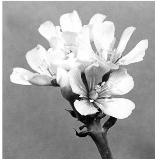
Venus' Fly-trap flowers. Botanical Name: Dionaea muscipula Ellis. [Wells Collection, SCRC]

The exhibition will contain a variety of artifacts including publications written by Wells regarding the ecology of North Carolina, manuscript materials documenting the tremendous impact he had at NC State, the camera he used to capture the lantern slide images, personal effects, and paintings Wells created in retirement. The Libraries will produce an accompanying catalog, beautifully illustrated with color images; essays on Wells; as well as the story of the discovery, loss, and preservation of the Savannah landscape. A Web site and database of digital and digitized images of the complete collection of photographs will be maintained to provide access to scholars, students, and others interested in North Carolina ecology. ❖