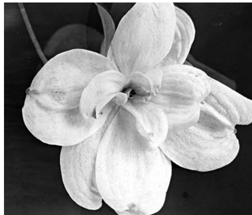
A close up of a double-flowering dogwood. Botanical Name: Cornus florida L.