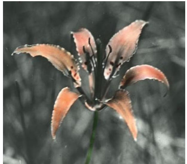
[Above right] Lilium catesbaei. Savannah lily.