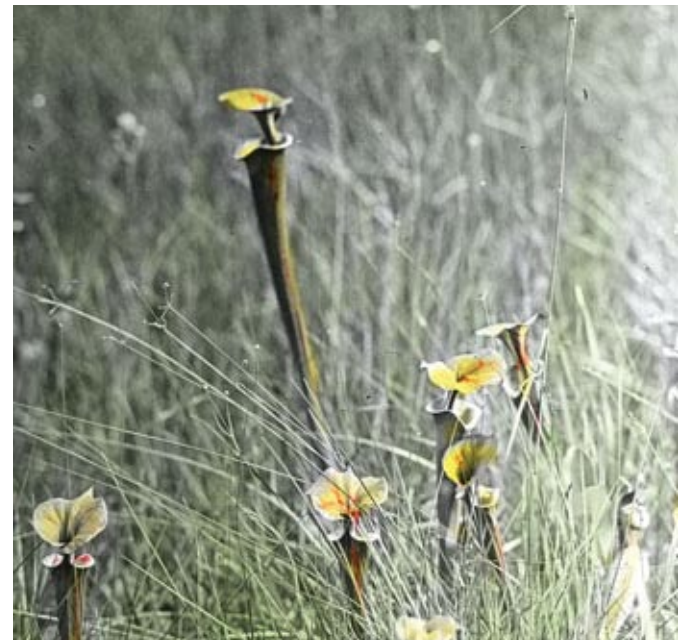
Sarracenia flava L. Insect-catching yellow trumpets.