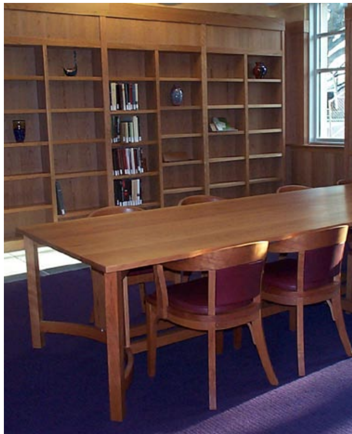
Special Collections Reading Room table and chairs, many of which are still available as naming opportunities.