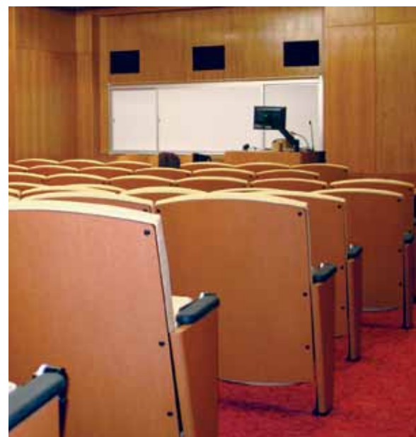
Entrance to the auditorium before the makeover (left) and a view from inside the doorway showing the new state-of-the-art space (right).