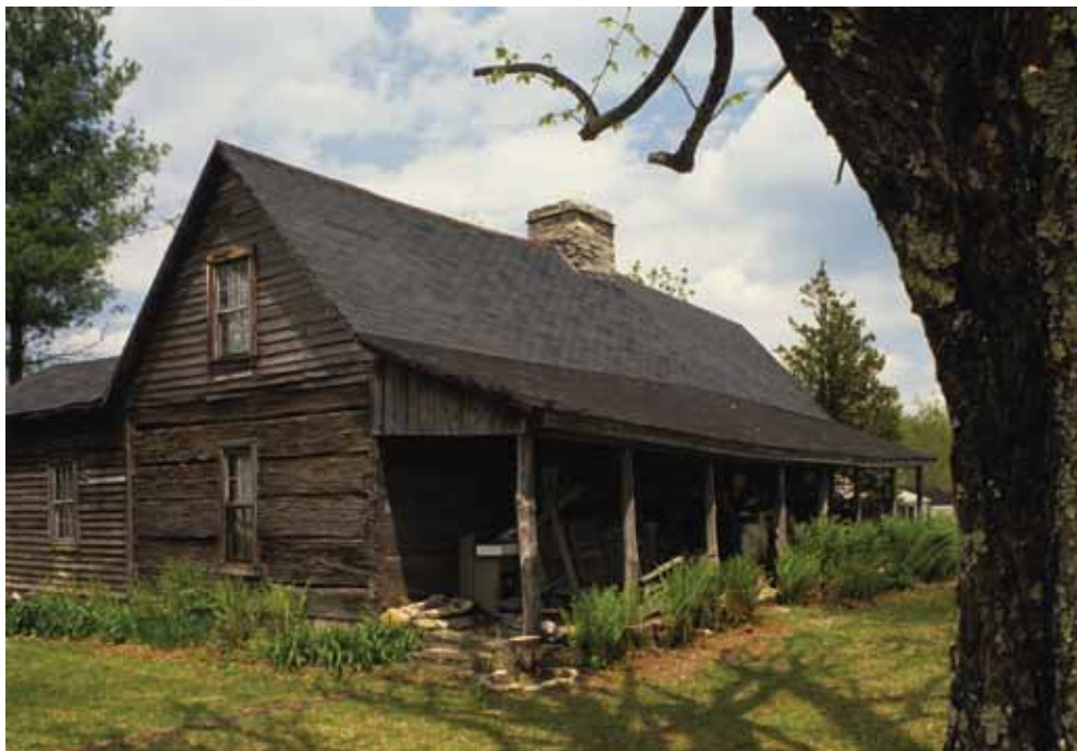
Gragg House, Watauga County, North Carolina. The house was constructed in the mid-nineteenth century and provides one of the state's finest examples of dovetailed plank construction. It is listed on the National Register of Historic Places. Reproduction and use of this material requires permission from Preservation North Carolina.

The Built Heritage of North Carolina is made possible through a Library Services and Technology Act grant administered by the State Library of North Carolina's NC ECHO program. The project will be completed in 2009.