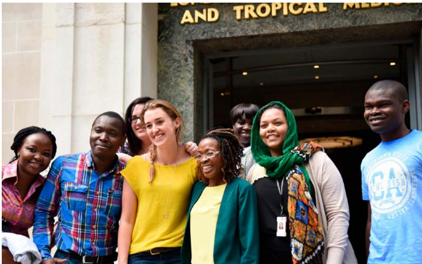
MSc students on campus in London.