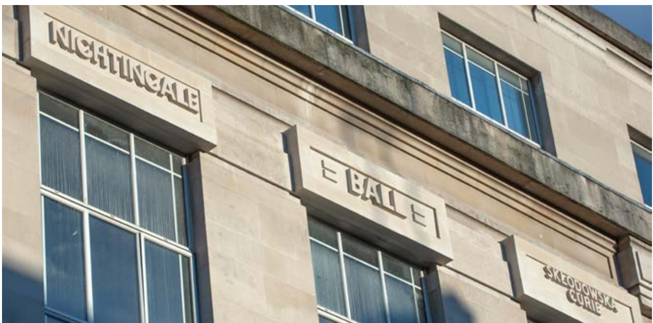
Women health pioneers were honoured on LSHTM's iconic Keppel Street building for the first time in 2019, with the addition of Marie Skłodowska-Curie, Florence Nightingale and Alice Ball to our historic frieze

While these are broad statements, detailed actions underpinning these have been included within the EDI action plan.