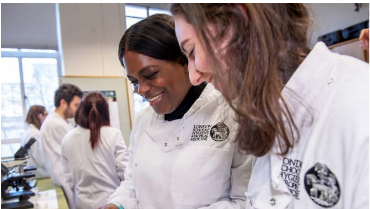
LSHTM open day 2020

We have also drawn on external reports and drivers, such as the EHRC report into racial harassment in higher education (October 2019), UK report 'Black, Asian and Minority Ethnic Student Attainment at UK Universities: #Closing the gap' (2019), OfS consultation on preventing and addressing harassment and sexual misconduct (2020), UK guidance on tackling racial harassment (2020) as well as the HR Excellence in Research and the Concordat to Support the Career Development of Researchers.