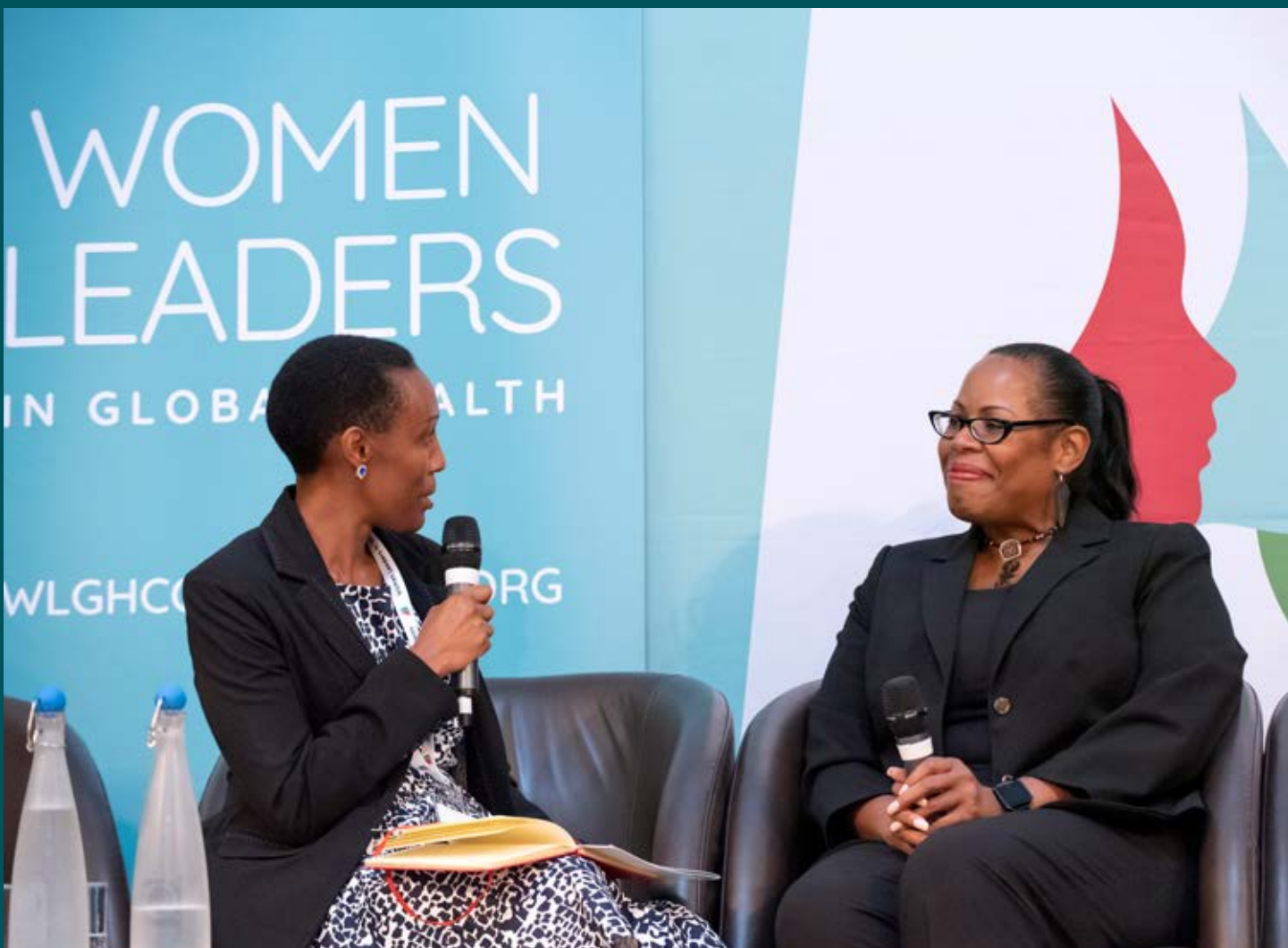
LSHTM hosted the Women Leaders in Global Health Conference in 2018, highlighting emerging and established women leaders in global health, providing training and mentorship, and building opportunities for women to progress in all forms of leadership

The plan is an overarching plan which refers to other current strategies and work such as the Staff Survey Framework for Action and the Concordat to Support the Career Development of Researchers.