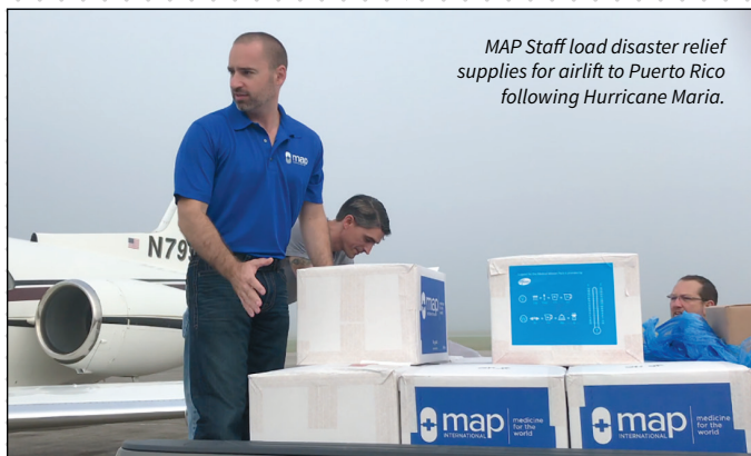
MAP Staff load disaster relief supplies for airlift to Puerto Rico following Hurricane Maria.