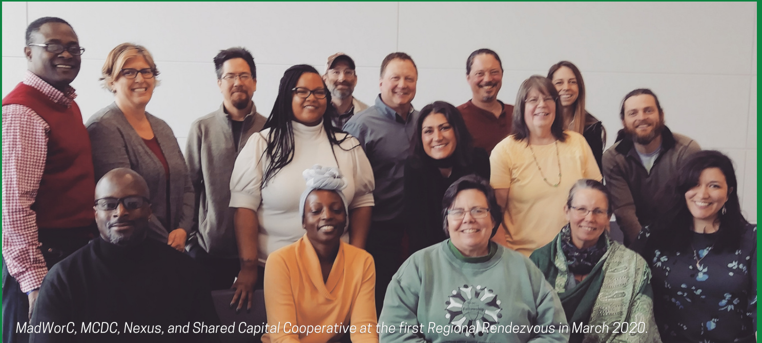
MadWorC, MCDC, Nexus, and Shared Capital Cooperative at the first Regional Rendezvous in March 2020.