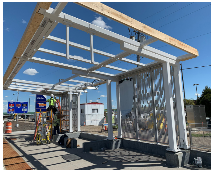
Orange Line station construction

10 a.m. to noon Washington County Historic Courthouse 101 Pine St. W. Stillwater