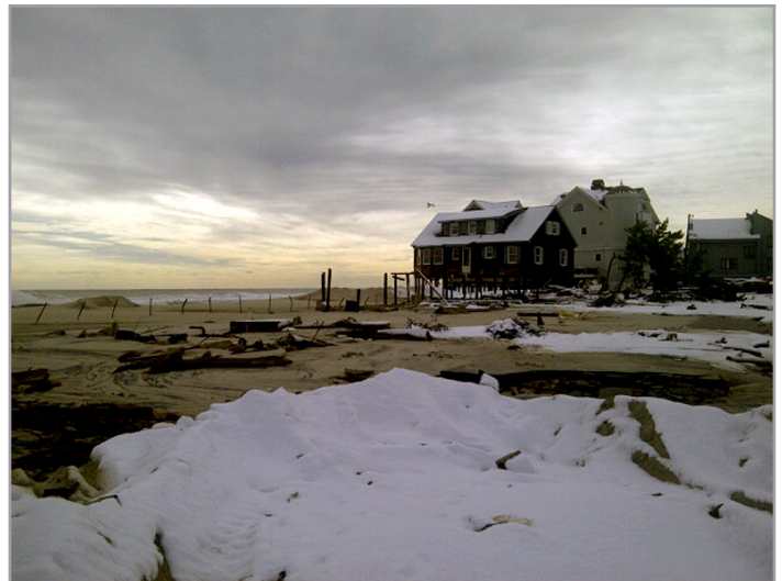
A view of the Atlantic Ocean from Mantoloking Island in New Jersey. Debris from the storm is scattered over the beach.