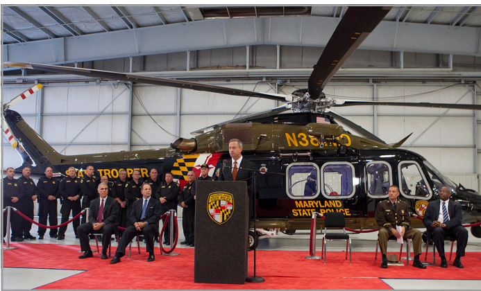
Governor Martin O'Malley speaks at the unveiling of the new Maryland State Police helicopters on October 5, 2012. The first of 10 new helicopters, seen in the background, will be deployed in 2013.