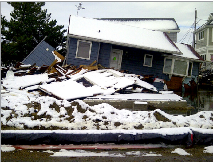
This home on Mantoloking Island in New Jersey was destroyed by the superstorm. To make matters worse, snow fell in the region.