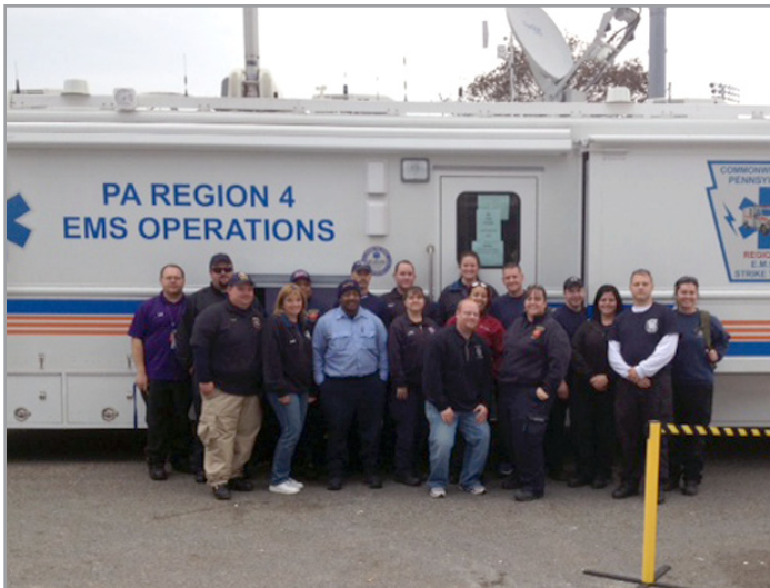
The Victor 6 Team, one of the ambulance strike teams from Maryland, gathers in front of an EMS vehicle used for recovery efforts in New Jersey.