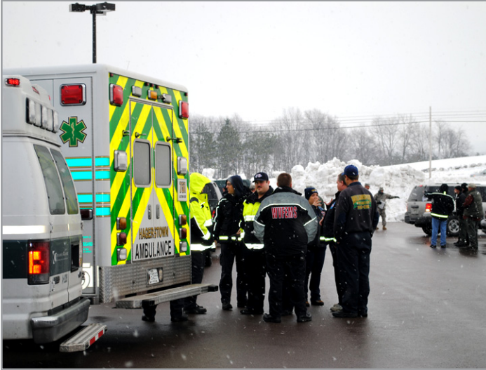
An emergency response group consisting of commercial and jurisdictional EMS providers was deployed to Garrett County, Maryland, to help deal with the massive snowfall on November 1 and 2. Used with permission.