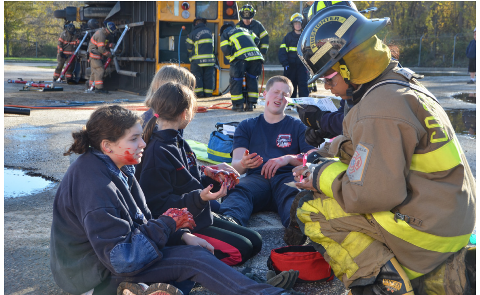
Junior Firefighters from Arcadia were moulaged for life-like injuries and triaged during a mass casualty incident drill in Baltimore County. Firefighters determine the severity of the injuries and what treatment would be necessary had this been a real incident.

Responders were faced with a motor vehicle crash involving a bus on its side with multiple "patients," role-played by Junior Firefighters from Arcadia. Mock injuries in children trapped in the bus ranged from minor cuts and bruises to critical, and even one DOA. Crews worked to stabilize the school bus and assess the situation, requesting additional suppression and EMS resources. The training also focused on simulated triage using triage tags, the logistics of transporting patients to area hospitals, and dispatch communications. In total, eight patients were triaged: two Priority 1 (critically injured victims), four Priority 2 (serious), one Priority 3 (minor), and one Priority 4 (deceased).