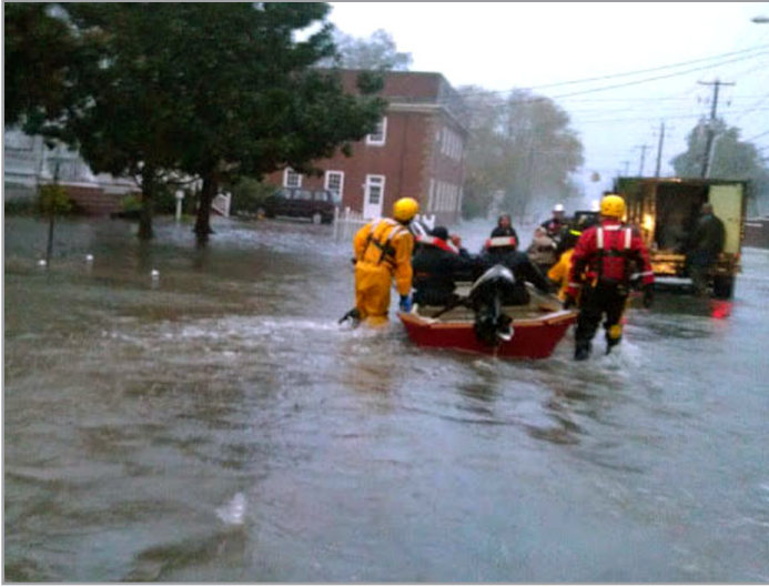
An EMS team conducts a water rescue in Crisfield, Maryland, as heavy flooding impacted residents with specific medical needs. Used with permission.