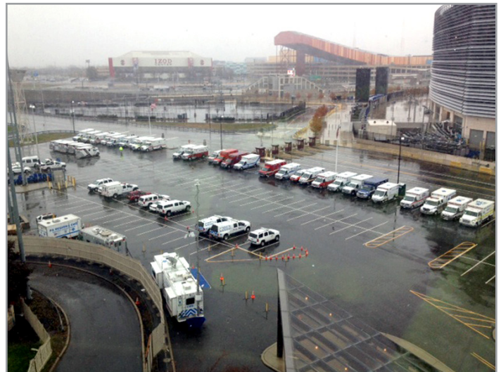
Ambulances responding to recovery efforts were staged at the Meadowlands Racetrack in East Rutherford, New Jersey.