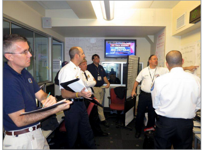
Maryland EMS joins members of the New Jersey Task Force at the New Jersey Multi-Agency Coordination Center (MACC) on November 5, 2012, to assist with the coordination of EMS resources.