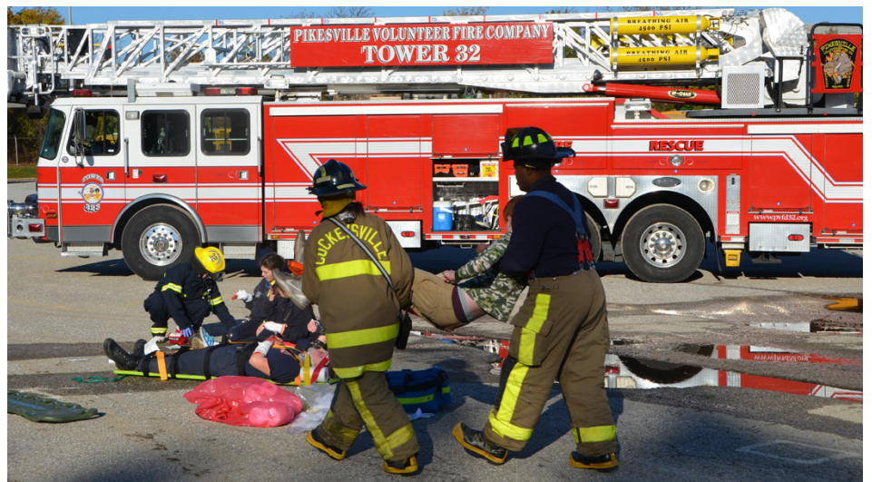
Firefighters quickly move "victims" away from the overturned school bus and get them ready for transport.

Please contact the MIEMSS Office of Licensure and Certification at 410-706-3666 with any questions.