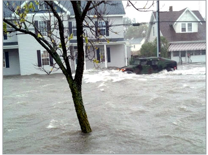
A Humvee attempts to travel through flooded streets in Crisfield, Maryland. EMS was on hand to assist the town's residents when the flood occurred just days before Halloween. Used with permission.