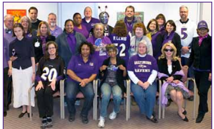
MIEMSS staff celebrated "Purple Friday" on January 11, 2013, in honor of the Baltimore Ravens' playoff game against the Denver Broncos. Go Ravens!