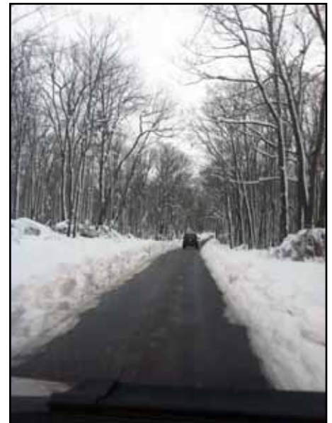
Wintery conditions made for slow and careful driving through Garrett County after the Hurricane.

Garrett County does not ask for help often; but when they do, they are in desperate need. Most comforting about this ordeal is that the residents of Garrett County now know that when help is needed, it is only a call away.