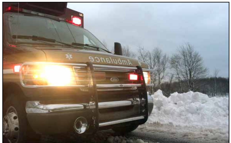
An ambulance makes its way down a snow-covered street in Garrett County following Hurricane Sandy. The region received three feet of snow in a short period, paralyzing the region.