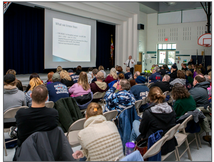
Attendees of Winterfest 2014 pack the gym to hear an update on high-performance CPR (HPCPR) and implementing a Code Resource Management approach to HPCPR.