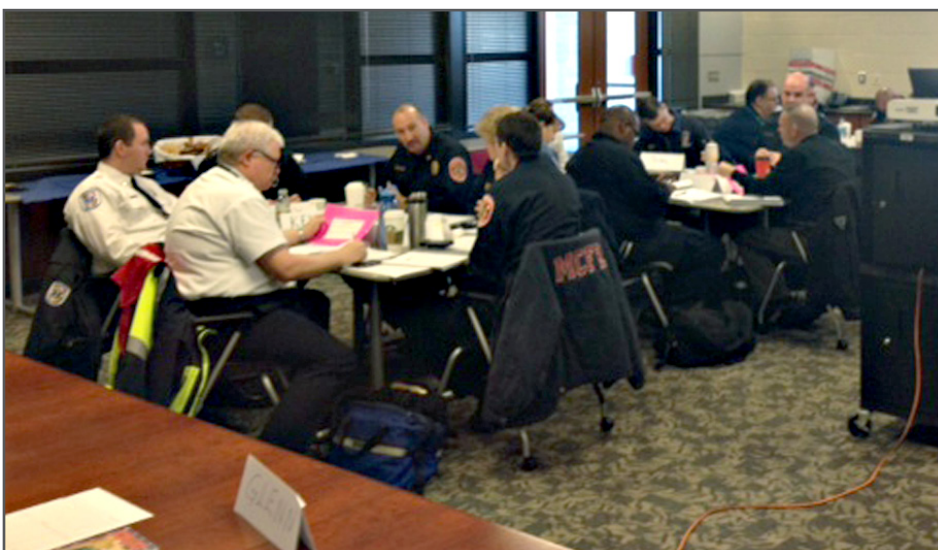
On January 28 and 29, 2014, thirty-six Maryland EMS providers participated in an ambulance strike team leader course instructed by Texas A&M Engineering Extension Service (TEEX). Funding for the course was provided by Montgomery Fire and Rescue's Emergency Response System project. This course and future offerings are being held as part of MIEMSS' effort to develop pre-designated ambulance strike teams that can respond quickly to emergencies in Maryland as well as other states.

Registration information available soon on www.miemss.org