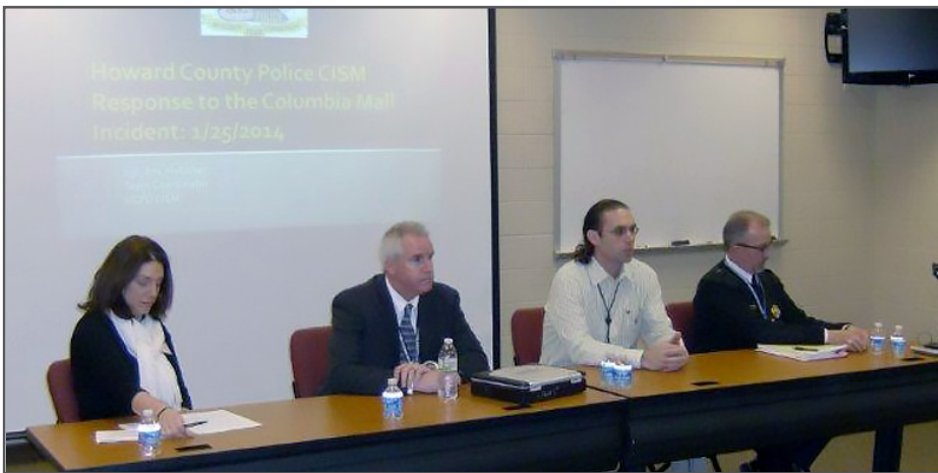
At the statewide CISM symposium in March 2014, A panel of responders from the January shooting at the Mall in Columbia discuss how CISM teams dealt with the tragic incident.