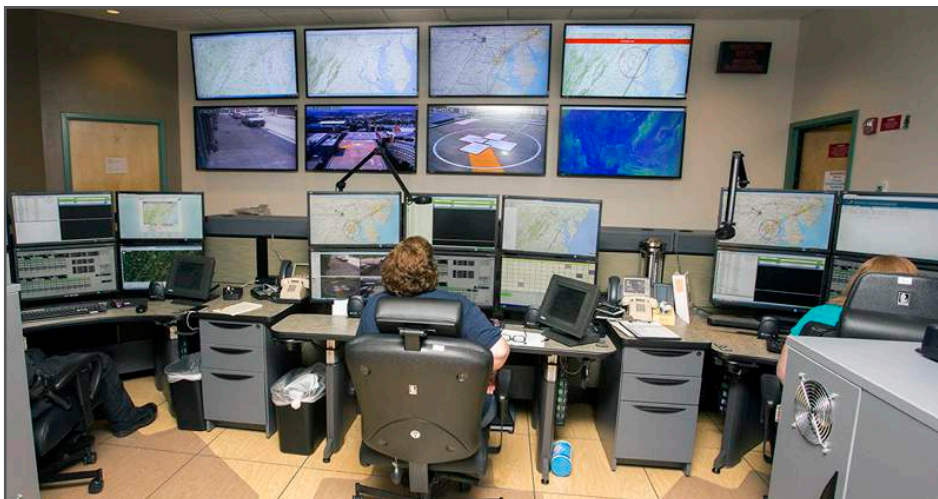
Operations in the new EMRC/SYSCOM center launched successfully on May 27, 2015. The enhanced center incorporates the most technologically advanced communications equipment, but also improves "behind-the-scenes" systems such as cabling and fire-suppression.

Moving into the new EMRC/SYSCOM operations center is an important, but not final, step in improving the State's medical communications. Legacy systems that remain in place and in use will be addressed in the future as part of the upgrade project.