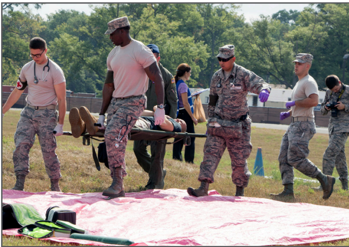
Participants carry an injured "patient" to the triage area during a mock exercise in Prince George's County in September 2015.

Members of the 79th Medical Wing at Joint Base Andrews teamed up with the Prince George's County Fire/EMS department and MIEMSS to prepare for their annual airshow in September. The airshow was preceded by two mass casualty incident management exercises as well as a number of classroom training sessions. Mock patients were triaged, treated, and transported to local hospitals by both ground and air assets. Response and command units from the 79th Medical Group; Joint Base Andrews Fire Department; Prince George's, Calvert, and Anne Arundel Counties; Maryland State Police Aviation Command; and MIEMSS Regional Programs were on scene during the event and supported a successful and safe airshow for the over 100,000 citizens in attendance.