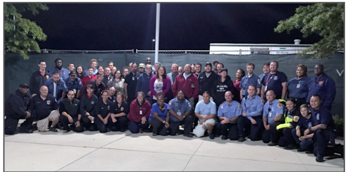
Maryland team members of the Philadelphia deployment gather for a brief photo op.