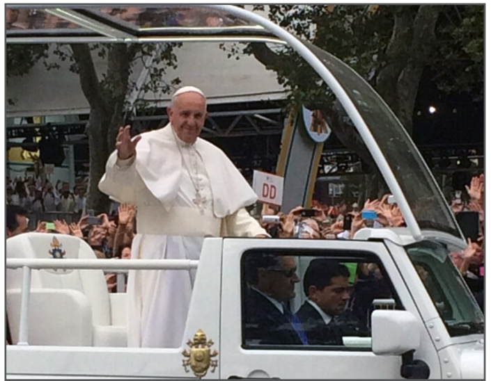
Pope Francis makes his way down the Benjamin Franklin Parkway during one of the papal parades in Philadelphia.