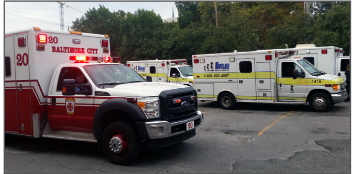
Ambulance Strike Team units gather to begin their deployment for Philadelphia on September 25.