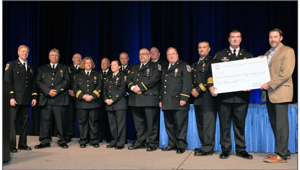
Members of the Calvert ALS receive their award for 2015 Volunteer EMS Service of the Year.

Calvert ALS is based in Prince Frederick, Maryland, and serves as the sole ALS asset providing 100% volunteer emergency medical services to the citizens of Calvert County. It is one of nine departments providing fire, rescue, and EMS to the community through the tiered response in partnership with seven departments providing basic life support and transport units. The department responds to 5,000 calls for service a year and consists of approximately 72 ALS and 60 BLS providers. Calvert ALS has an on-site training space and simulation laboratory available to members 24/7. The agency also has a Paramedic Early Intervention Program (PEIP) that places ALS gear on every BLS unit in the county, thus enabling paramedics to respond from any fire station on the ambulance and instantly upgrade the transport unit to the level of ALS. Calvert ALS participates in countywide and mandated online safety training courses and has a designated infection control officer.