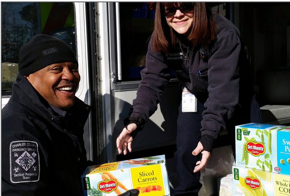
Members of Charles County Department of Emergency Services load donations into one of their vehicles during the holiday food drive.

The Charles County Department of Emergency Services in partnership with the Charles County Volunteer Fire and Emergency Medical Services Association organized a “Fill the Fire Truck” Food Drive this holiday season. They accepted donations of canned goods and other non-perishable food items on behalf of the Southern Maryland Food Bank.