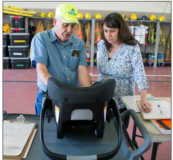
A Certified Child Passenger Safety Technician demonstrates the safety features of an infant car seat to an expectant mother at a check-up event.

To learn details about upcoming courses or to register yourself, go to cert.safekids.org . To learn about scholarships for healthcare/EMS personnel, contact CPS@miemss.org or call 410-706-8647.