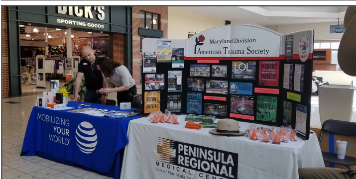
Distracted Driving events took place statewide on April 6, 2016, including virtual reality simulations and pledge drives to not "drive distracted."