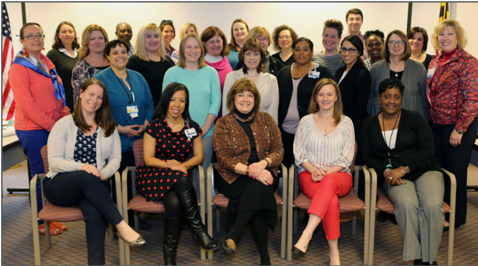
The members of the Maryland Trauma Quality Improvement Committee (TQIC), made up of representatives from the Maryland Trauma Centers, were responsible for planning and holding the statewide events during Distracted Driving Prevention Awareness Day.

If you have any questions about the transition, please call the Office of Licensure and Certification at 410-706-3666 or 800-762-7157.