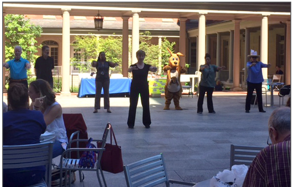
Trauma Roo, representing the American Trauma Society, participated in a tai chi demonstration at The Johns Hopkins Hospital during one of their fall prevention events.