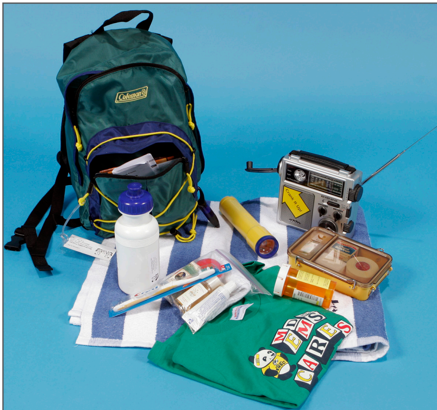
A disaster preparedness kit, like that shown here, should include necessities like medication, clothing, and water, but flashlights, radios, and batteries are also a good idea.