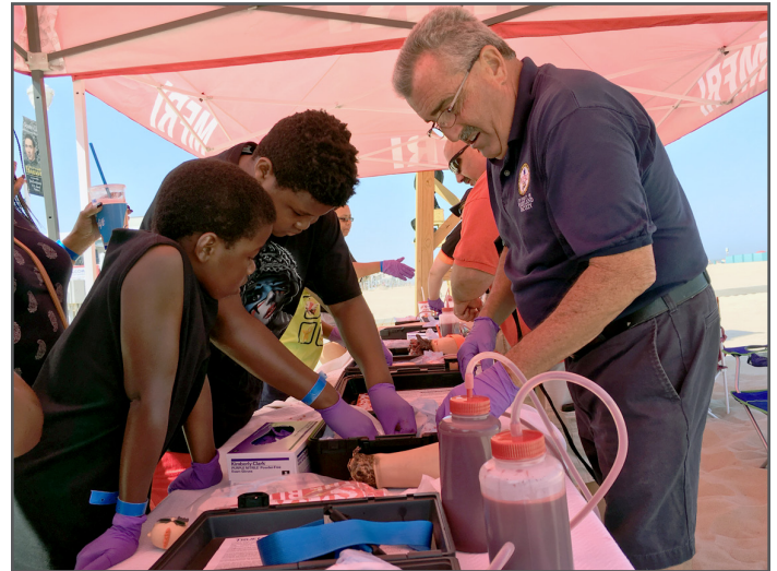
Maryland Fire and Rescue Institute instructors trained members of the public in applying bleeding control techniques in Ocean City, as part of the nationwide Stop the Bleed campaign.