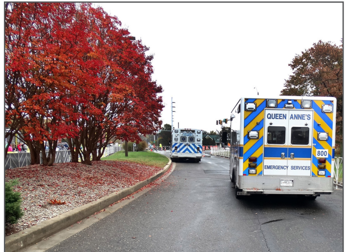
Left photo, members of the mutual aid EMS teams observe runners as they cross the finish line at the 4th annual 10k Across the Bay race. Right photo, Queen Anne's County EMS units wait next to the race course to provide emergency care, if needed.