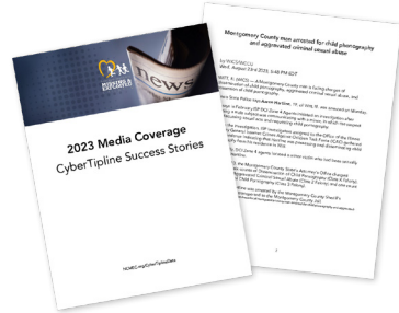
2023 Media Coverage CyberTipline® Success Stories

In 2023, the CyberTipline® received over 186,000 reports regarding online enticement – a more than 300% increase from just 2021. Online enticement is a form of exploitation involving an individual who communicates online with someone believed to be a child with the intent to commit a sexual offense or abduction. Online enticement is a broad category that includes sextortion, in which a child is groomed or coerced to take sexually explicit images or even meet face-to-face with a perpetrator for sexual purposes.