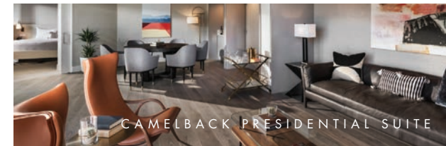
CAMELBACK PRESIDENTIAL SUITE

End the day with a soak in a luxurious bathtub overlooking Camelback Mountain, then take in Arizona's delightful weather on your private, third-floor balcony.