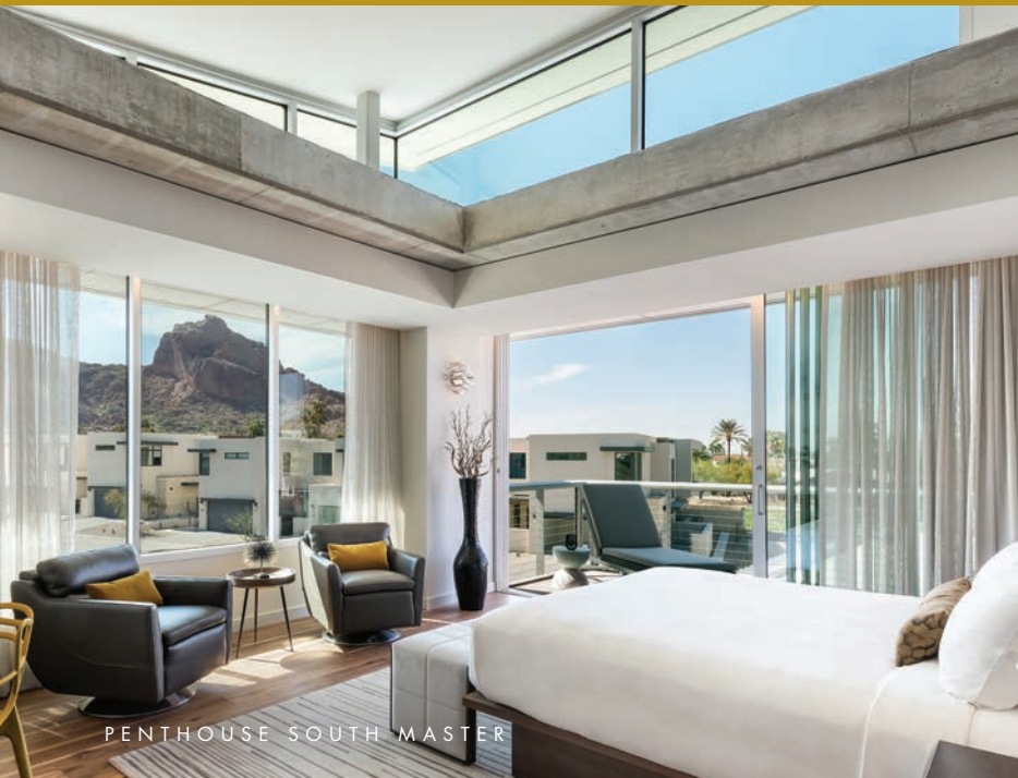
PENTHOUSE SOUTH MASTER