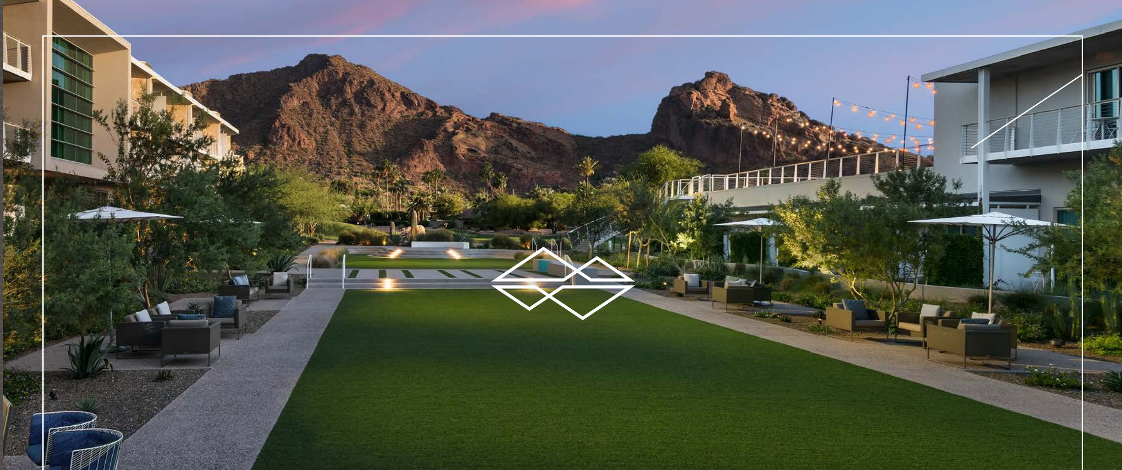
MOUNTAIN SHADOWS The heart of Paradise Valley.