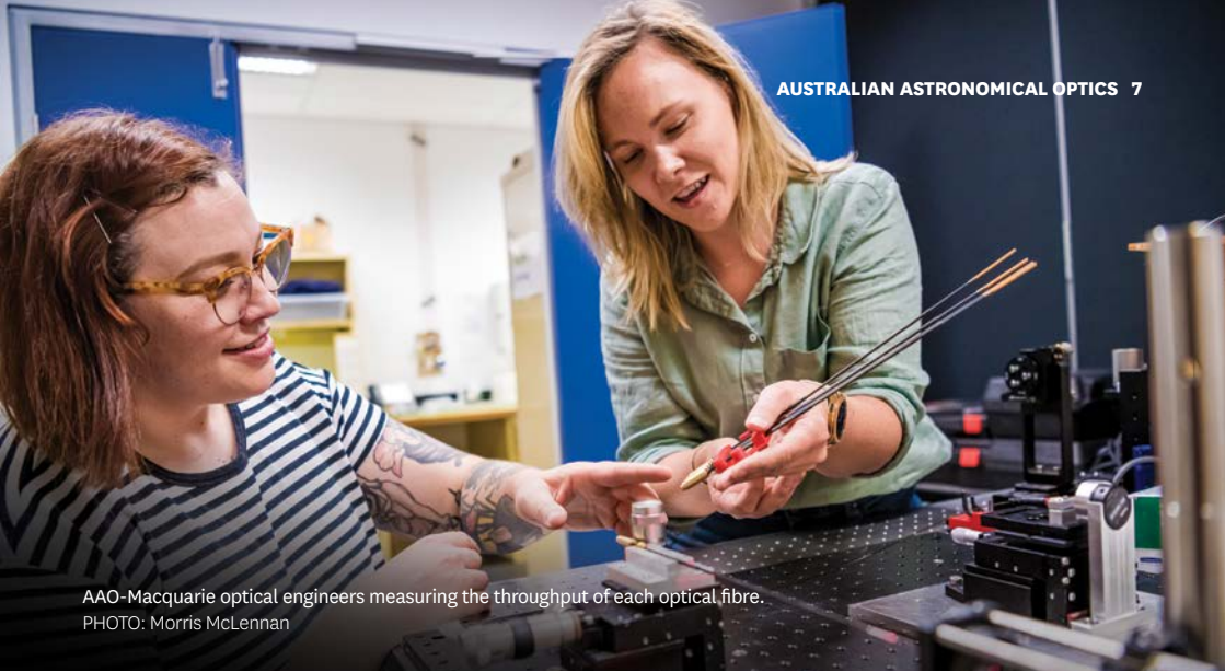
AAO-Macquarie optical engineers measuring the throughput of each optical fibre.