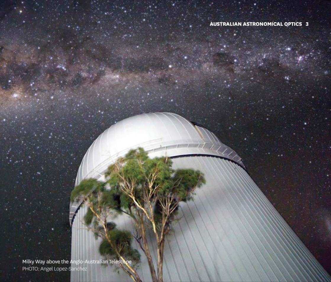
Milky Way above the Anglo-Australian Telescope