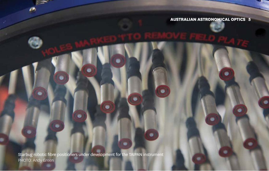
Starbug robotic fibre positioners under development for the TAIPAN instrument